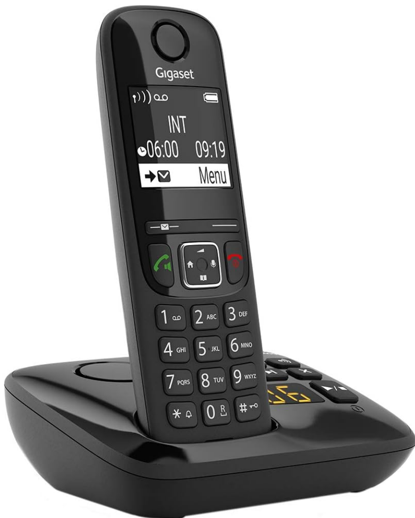
Figure 4: ECO DECT Technology. This image highlights the phone's energy-saving features and its German manufacturing origin.