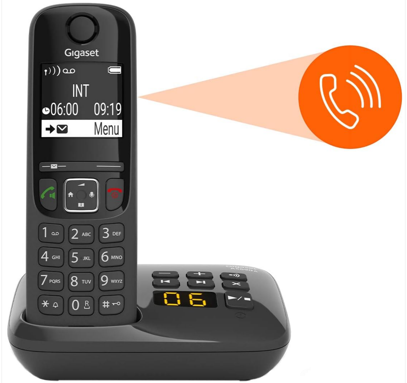
Figure 2: Brilliant Sound Quality. This image emphasizes the phone's excellent audio performance, particularly during hands-free conversations.