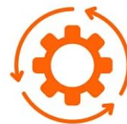
Figure 3: Practical Functions. This image highlights key features such as adjustable volume, a large contact directory, and customization options.

Individuelle Bildeinstellung & Klingeltoneinstellung