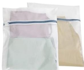
S ( 11.8"x15.7" )