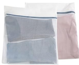
L ( 19.7"x23.6" )