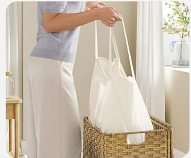
Easy to Pull Out