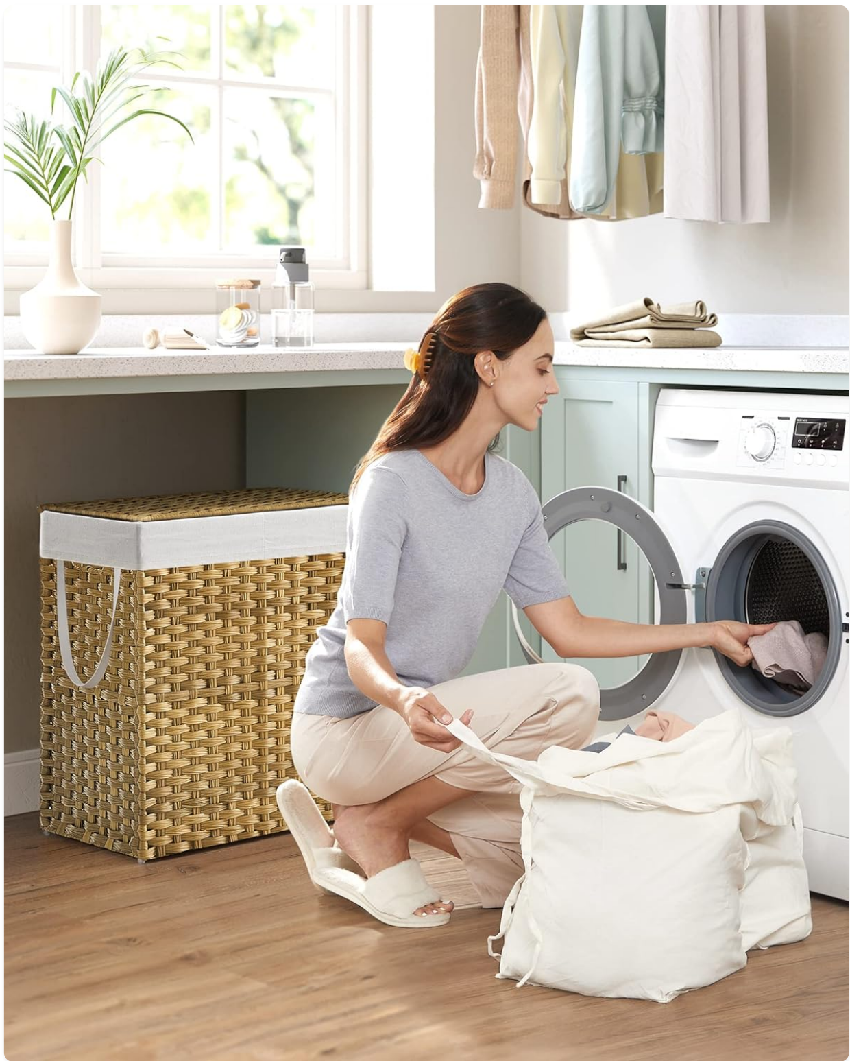
Image 1: The SONGMICS 110L Natural Wicker Laundry Hamper in a home laundry room.

This image shows the natural wicker laundry hamper positioned next to a washing machine, highlighting its aesthetic integration into a home environment. The hamper features a lid and a woven exterior.