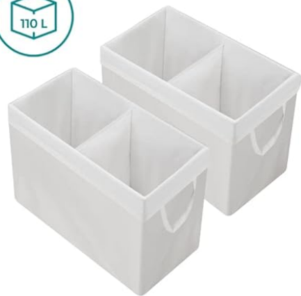
Image 2: Hamper with lid open, revealing two removable dual liners.

This image illustrates the hamper's lid in an open position, showcasing the two internal compartments created by the removable liner bags. The lid is designed to stay open for easy access.