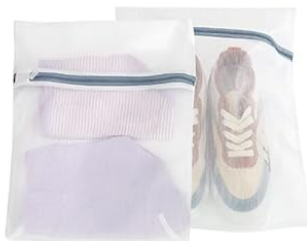
M ( 15.7"x19.7" )