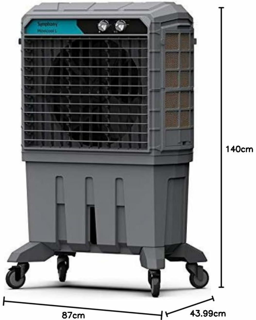
Image 4.1: Dimensions of the Symphony MOVICOOL L 125 Air Cooler, showing approximate measurements of 87D x 44W x 140H Centimeters.