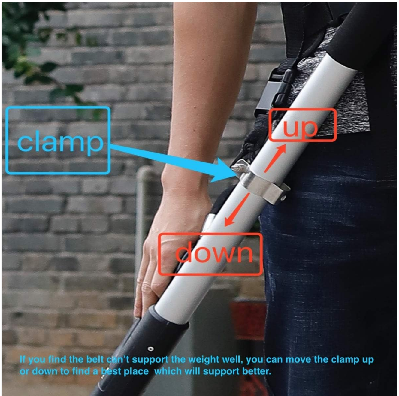
Figure 3: A user demonstrating the proper use of the belt kit to support the telescoping wand, showing how the clamp can be adjusted for comfort and leverage.