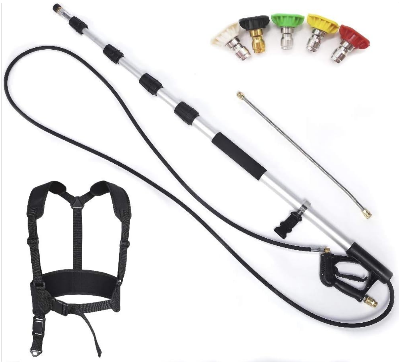
Figure 1: Main components of the LOVHO Telescoping Spray Wand package, including the wand, belt, and various nozzles.