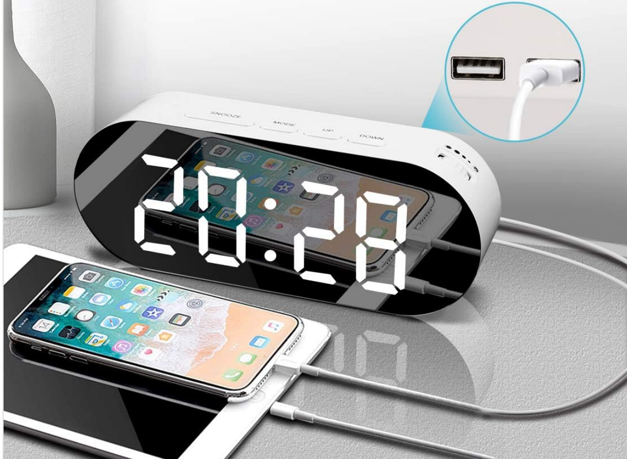
Image: The alarm clock with two smartphones plugged into its dual USB charging ports, demonstrating its charging capability.

USB ports can charge your smart device (USB cable is not include)