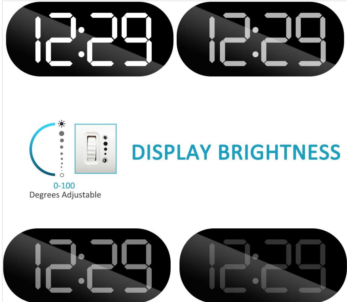
Image: Visual representation of the dimmer function, illustrating the adjustable brightness levels from 0 to 100 degrees.

Rotate the 'DIMMER CONTROL' knob located on the side of the clock to adjust the display brightness. This allows you to customize the light intensity to your preference, preventing it from being too bright at night.