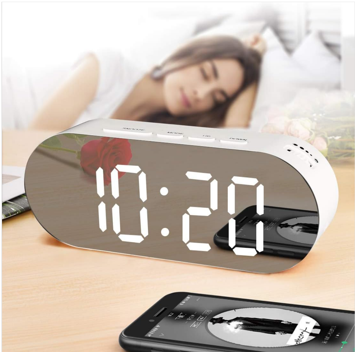
Image: The WulaWindy Digital Mirror Surface Alarm Clock showing the time, demonstrating its clear display and mirror functionality.