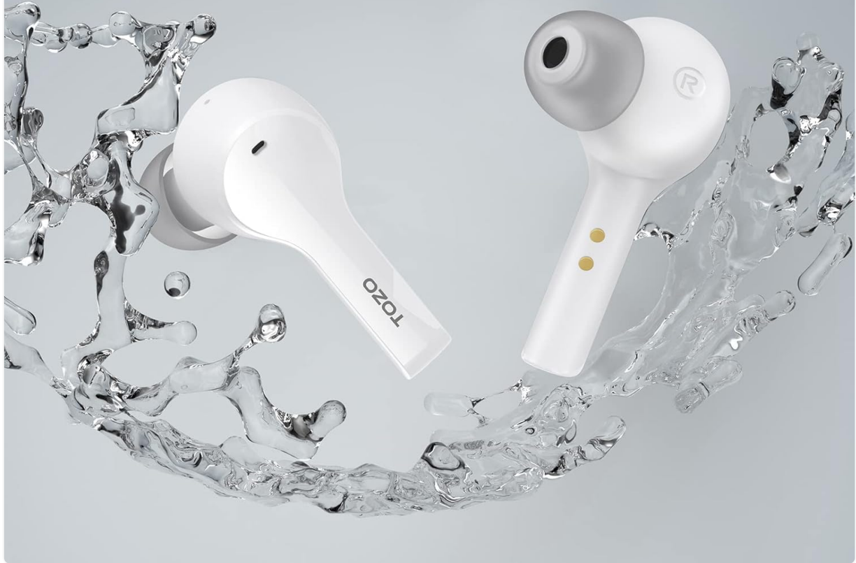
Image 3.3: Visual representation of the IPX7 waterproof capability of the earbuds.

Waterproof nano-coating is adopted to resist splashes, rain, and sweat