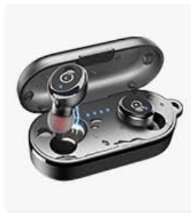
Image 5.1: Visual guide to the smart touch controls on each earbud.