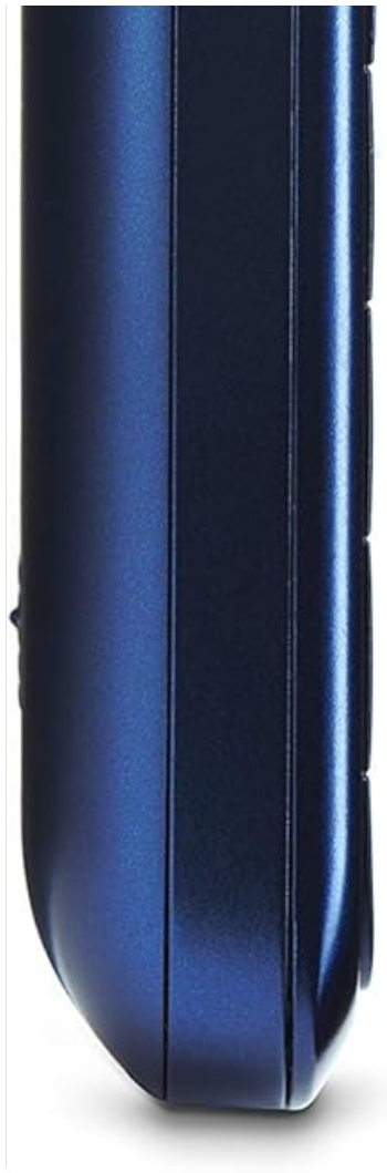
Image: Side view of the Panasonic KX-TU110 mobile phone, blue, highlighting the volume control buttons and charging port. The Mini USB charging port is visible at the bottom of the side panel.