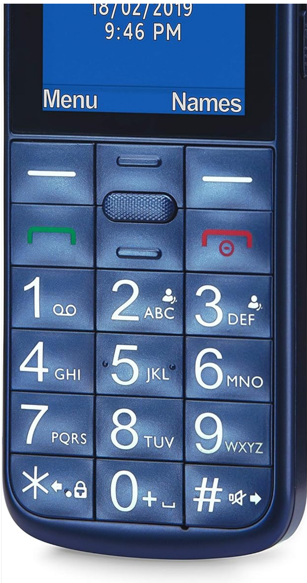
Image: Front view of the Panasonic KX-TU110 mobile phone, blue, with the screen displaying date and time, and the large, backlit keypad clearly visible. The screen shows 'Menu' and 'Names' soft keys.