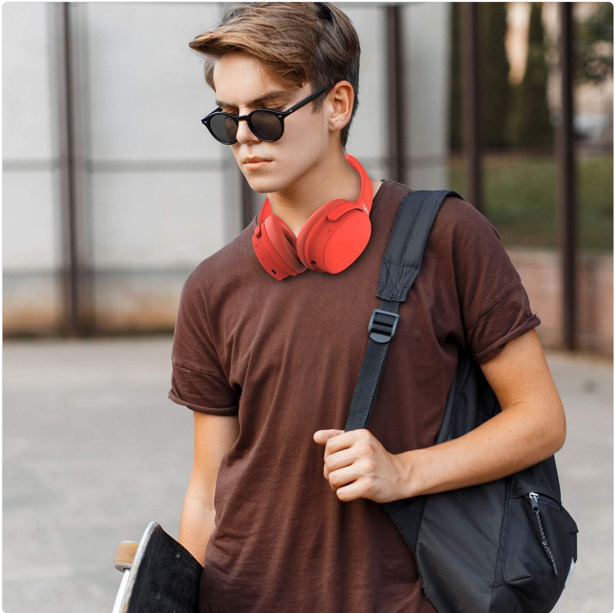
Figure 7.2: Foldable Design for Easy Portability.