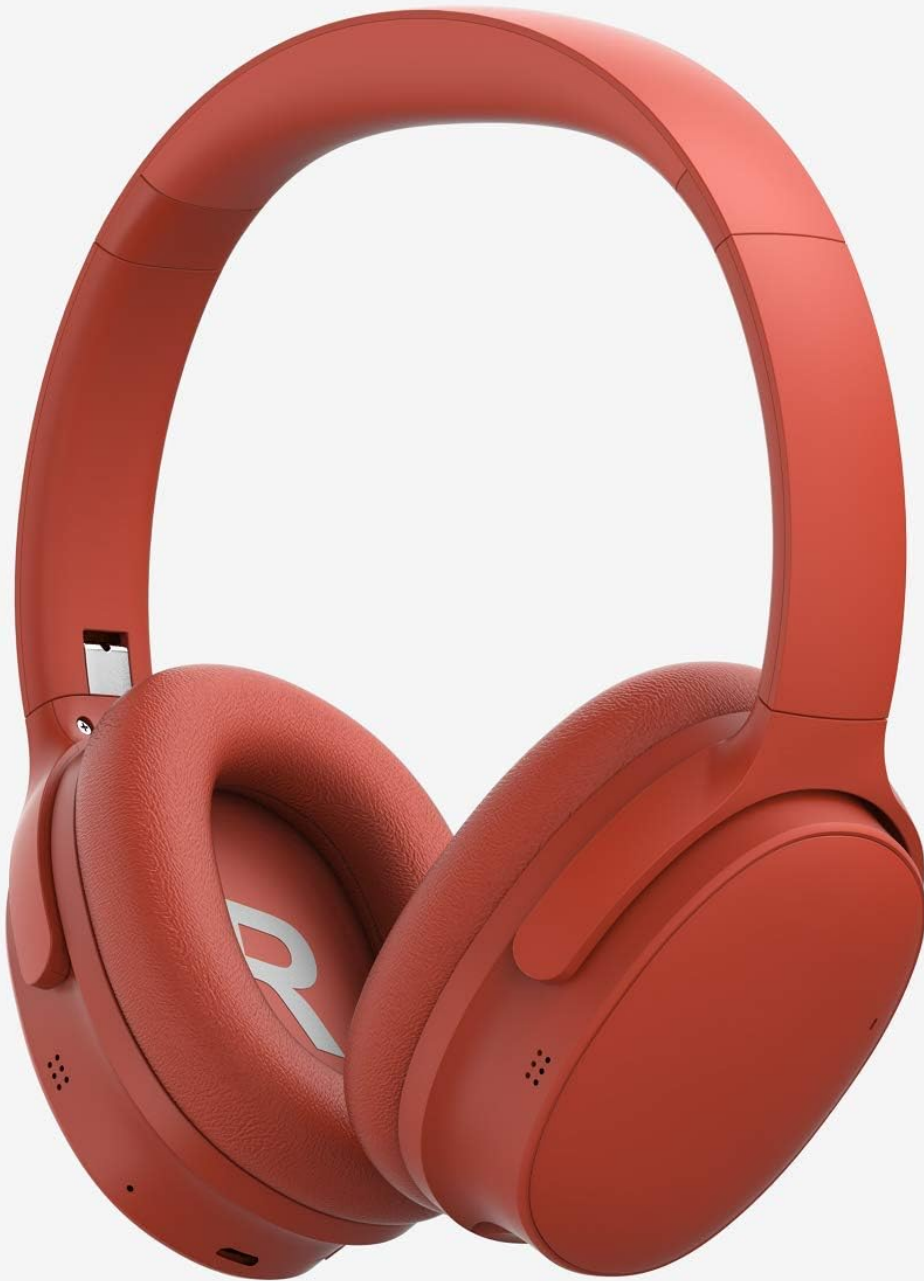
Figure 1.1: dyplay Urban Traveller Active Noise Cancelling Headphones.