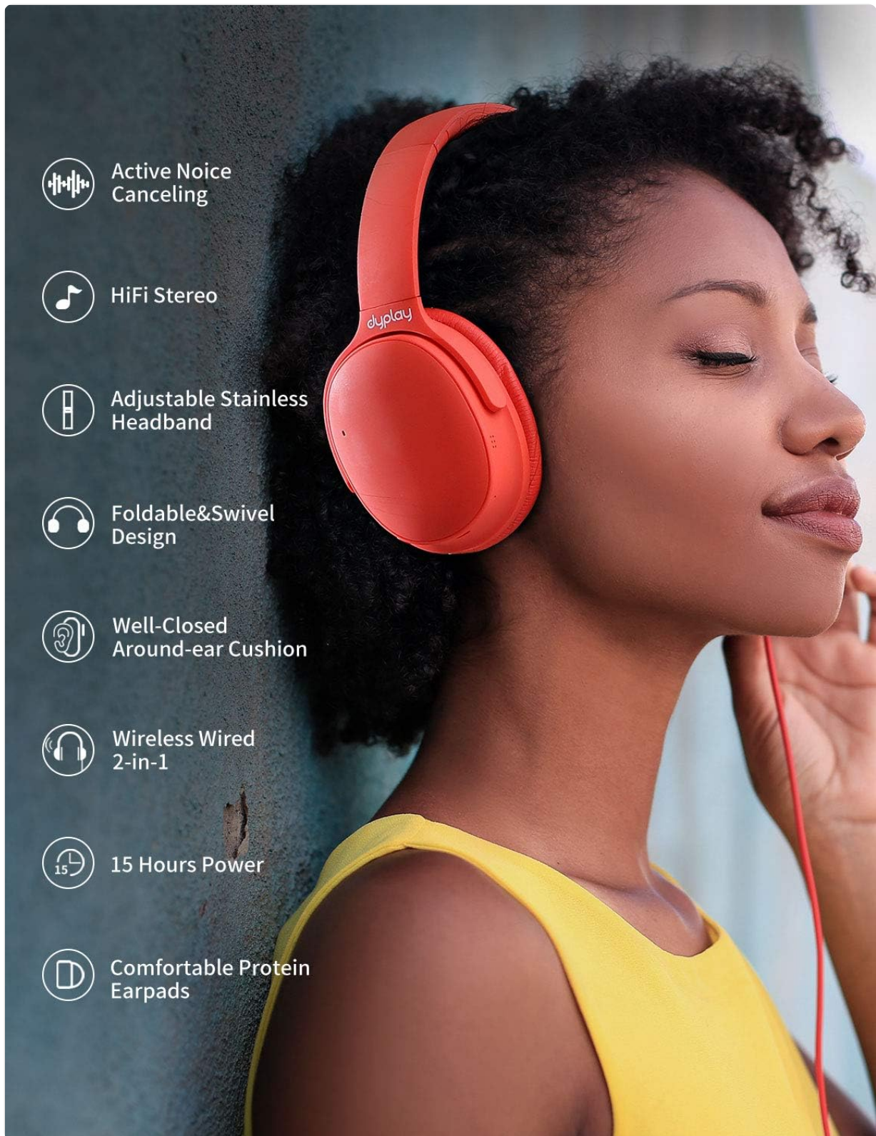
Figure 3.1: Key Features of dyplay Urban Traveller Headphones.

The dyplay Urban Traveller headphones feature a sleek matte grey finish with red accents, providing a premium look and feel. The design prioritizes comfort and portability.