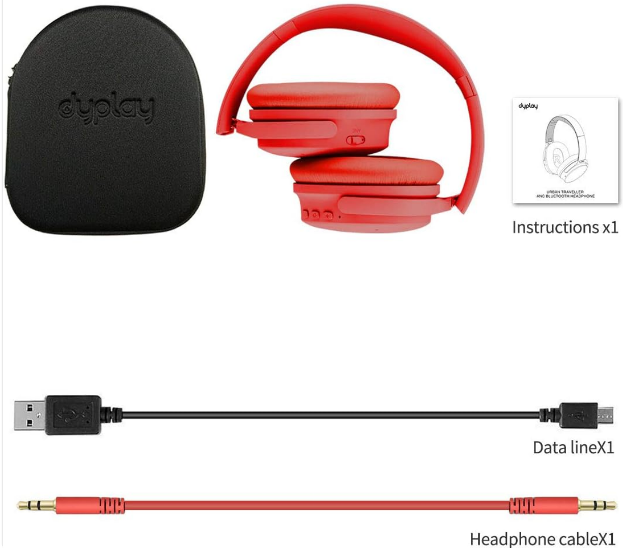
Figure 2.1: Package Contents of dyplay Urban Traveller Headphones.

The included carrying pouch is made of a durable, canvas-like material, offering good protection for your headphones.