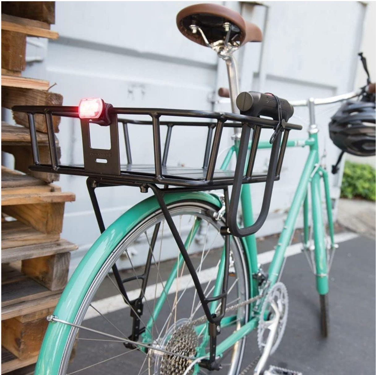
Image: The Local Basket installed on the rear of a bicycle, featuring a U-lock holder and a mounted tail light.