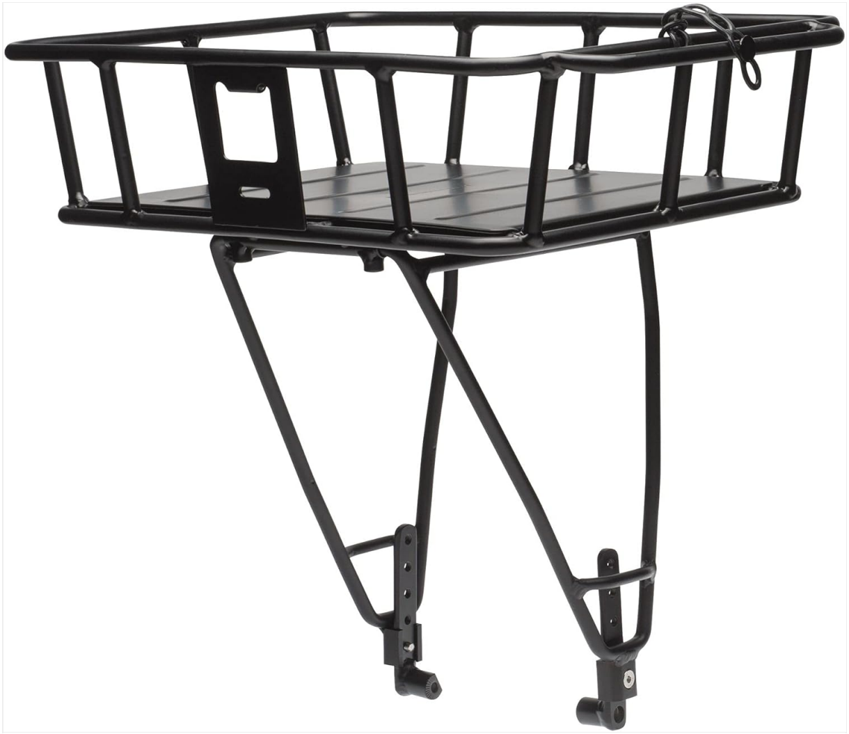
Image: The Blackburn Local Basket Bike Rack, shown detached, highlighting its structure.