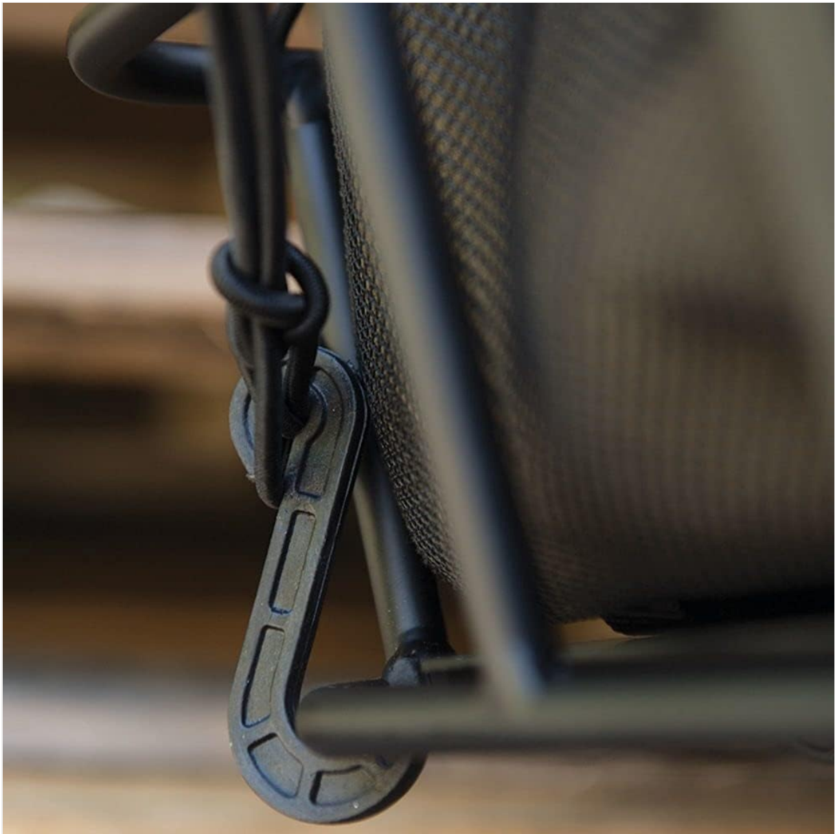
Image: A close-up view of the cargo net hook attached to the basket frame.