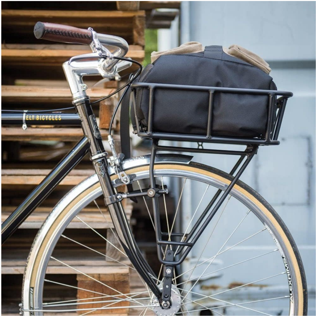
Image: The Local Basket installed on the front of a bicycle, carrying a small bag.