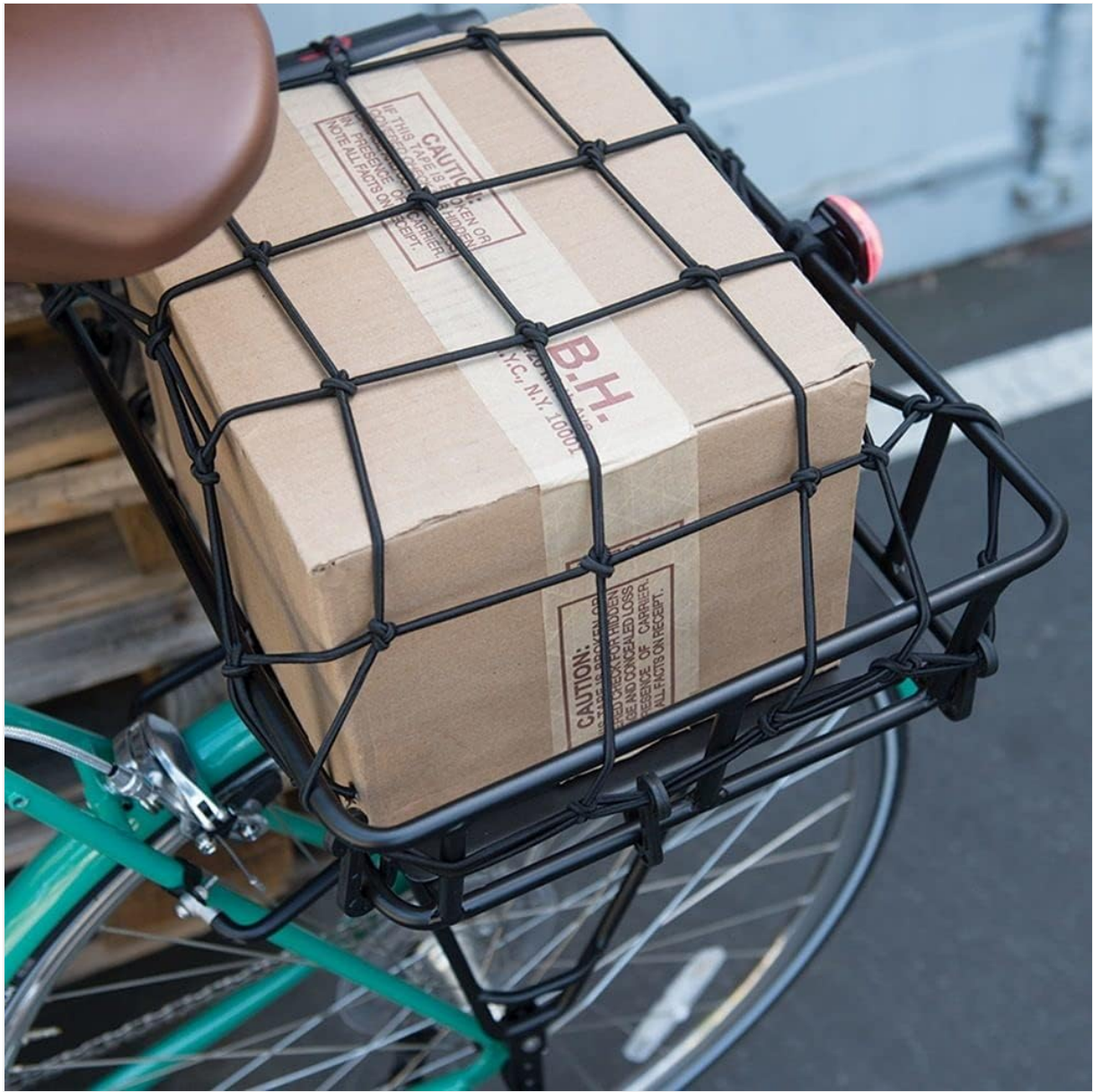
Image: A cardboard box secured within the rear-mounted basket using the provided cargo net.