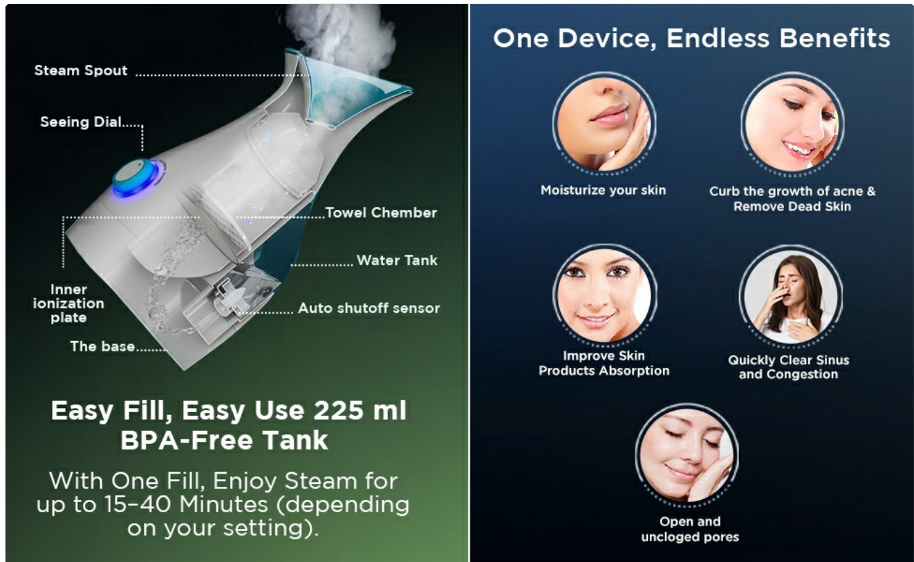
Figure 2: Key components of the Dr Trust 3-in-1 Nano Ionic Facial Steamer.