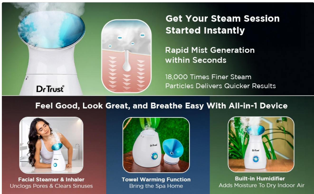
Figure 4: Using the facial steamer for skin rejuvenation.