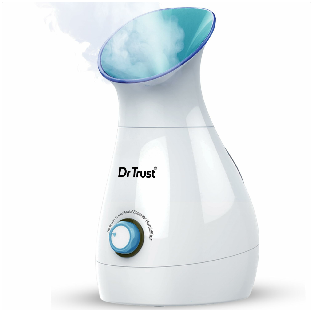
Figure 1: Dr Trust USA 3-in-1 Nano Ionic Facial Steamer, Humidifier, and Towel Warmer.