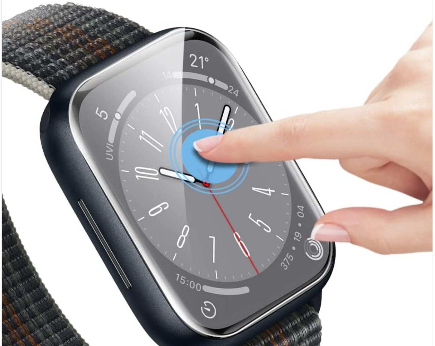
Image: A finger interacting with an Apple Watch screen protected by the LK film, illustrating its high touch sensitivity.

The protector provides clear viewing Ultra responsive touch sensitivity and a perfect for design