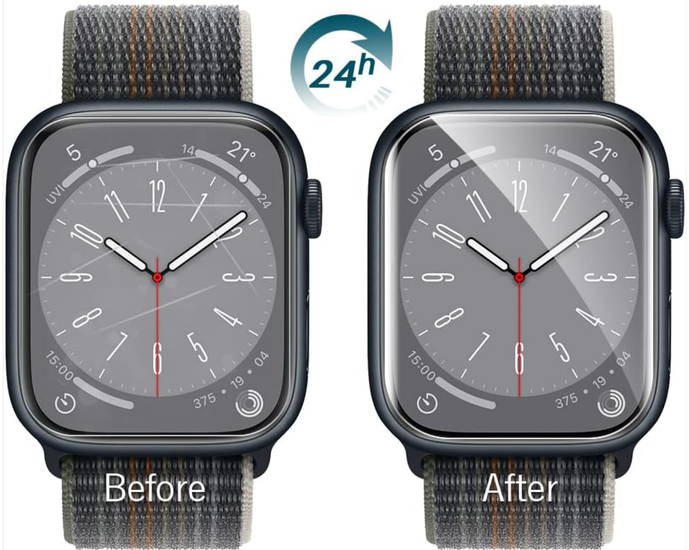
Image: A visual comparison demonstrating the self-healing capability of the screen protector, showing how bubbles and minor imperfections disappear within 24 hours.

Any bubble and scratches will disappear automatically in 24 hours.