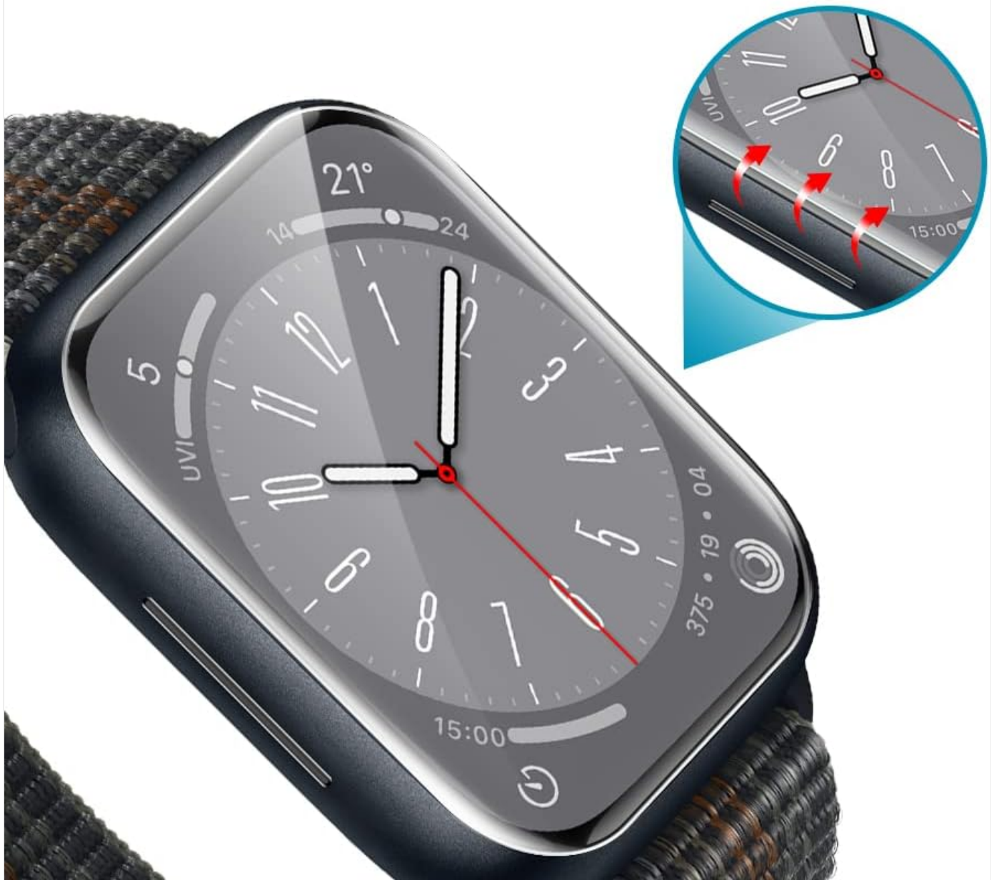
Image: A close-up showing the screen protector providing maximum coverage, extending to the curved edges of the Apple Watch screen.

Flexible protector max coverage to the edge of the cell watch radian