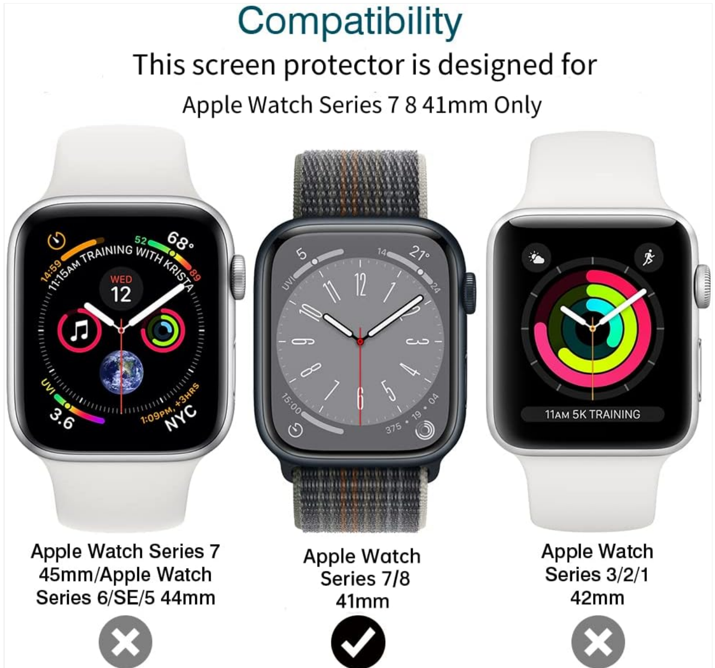
Image: A visual guide illustrating that the screen protector is compatible with Apple Watch Series 7/8 41mm, but not with 45mm or 42mm models.

This screen protector is specifically designed for Apple Watch Series 7, 8, and 9 (41mm models). It is also compatible with Apple Watch 40mm models (Series 6, SE, 5, 4). Please ensure your Apple Watch model matches these specifications for proper fit and function.