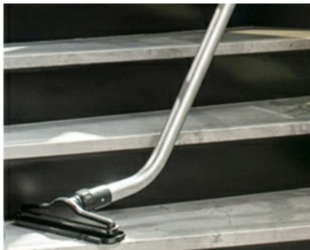
Image: A person using the Prolux 2.0 backpack vacuum to clean stairs, demonstrating its portability and ease of use in multi-level environments.