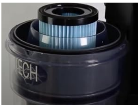
Image: A close-up view of the HEPA filter within the Prolux 2.0 vacuum's dust collection system, illustrating its design for capturing fine particles.