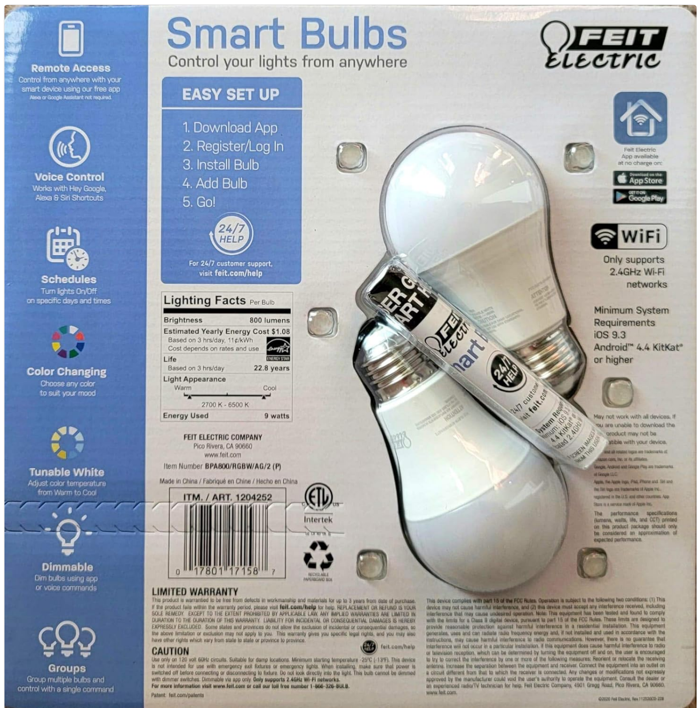
Image: Back packaging of the Feit Electric Smart Wi-Fi LED Light Bulbs, detailing easy setup steps, lighting facts (800 lumens, $1.08 estimated yearly cost, 22.8 years life), and system requirements.