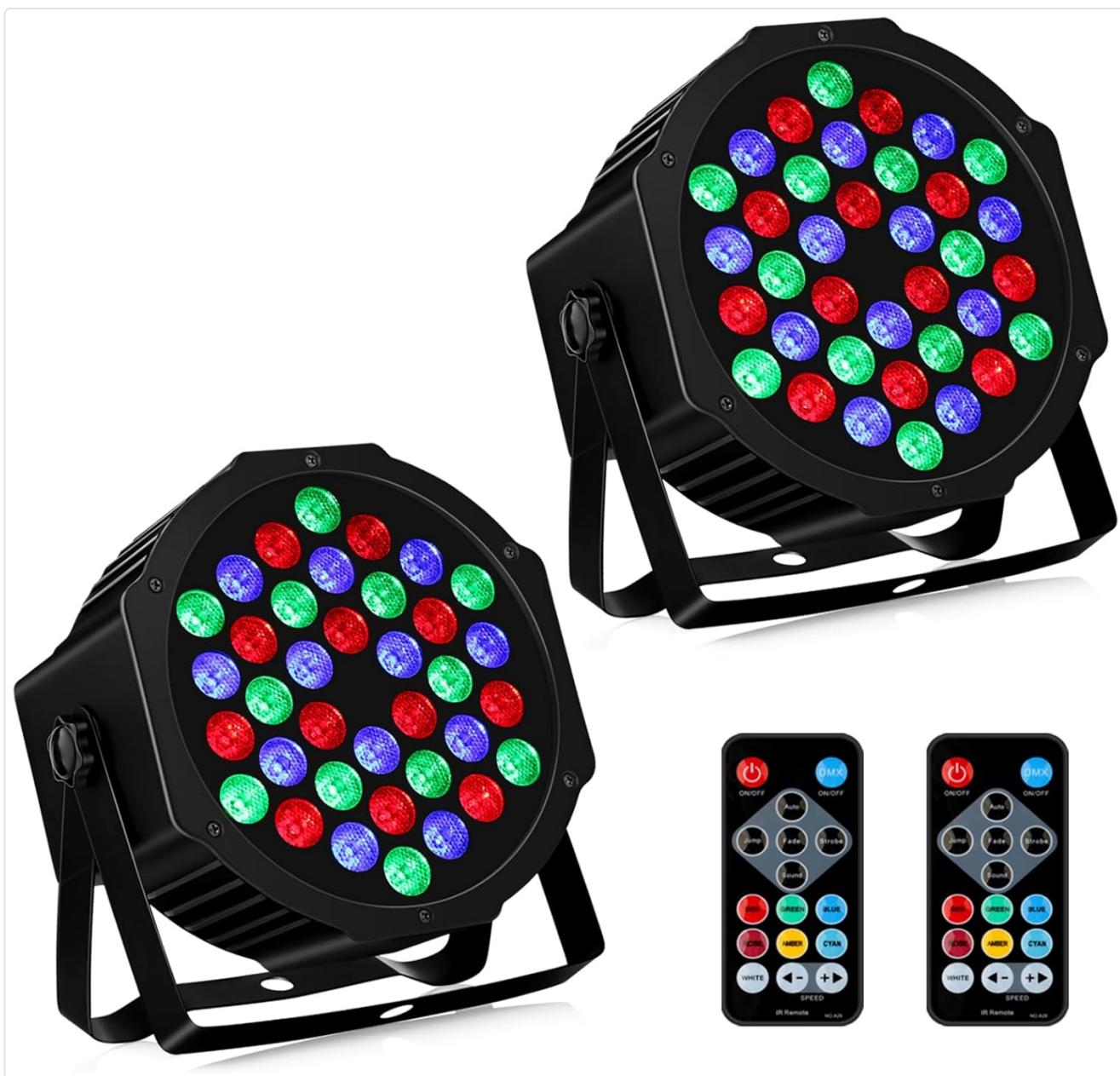
Figure 1: Two YeeSite 36LEDs RGB Stage Lights with two remote controls. This package includes two 36LEDs RGB Stage Lights and two remote controllers, providing a complete lighting solution.