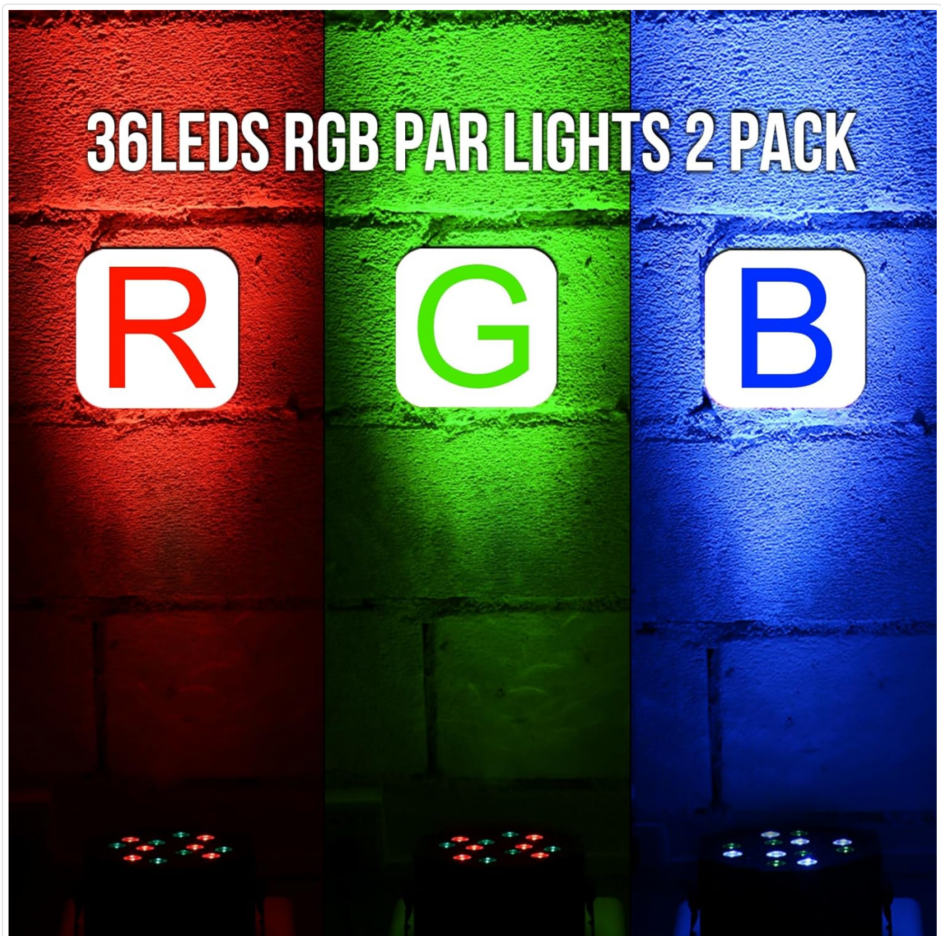
Figure 2: Demonstration of Red, Green, and Blue light output. The lights feature 12 Red, 12 Green, and 12 Blue LEDs, allowing for vibrant static colors and various color mixing possibilities.