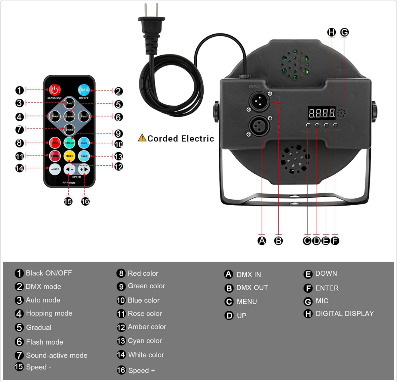
Figure 4: Detailed layout of the remote control. The remote features direct color buttons (Red, Green, Blue, Rose, Amber, Cyan, White), mode selection buttons (On/Off, Auto, Jump, Fade, Strobe, Sound), and speed adjustment controls.

The included remote control provides convenient access to all lighting modes and color selections. Ensure the remote is pointed towards the light unit for effective control.