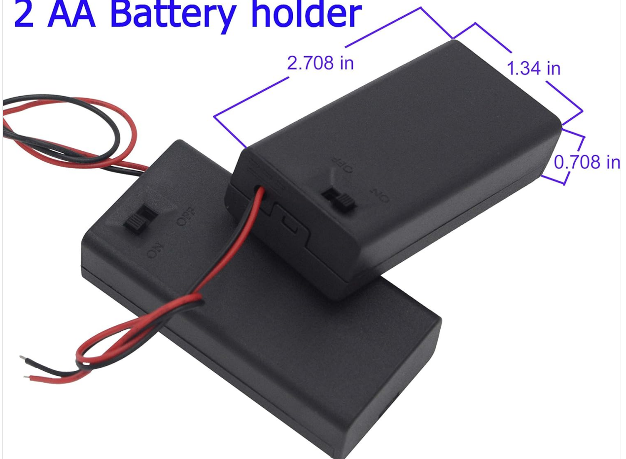
Image: Two 2-cell AA battery holders, one on top of the other, with dimensions indicated (length 2.708 inches, width 1.34