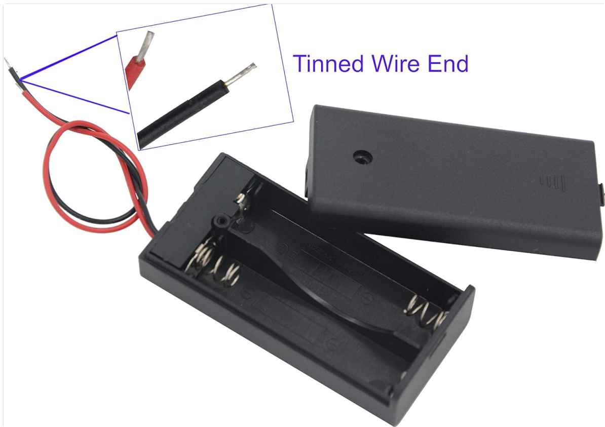
Image: A close-up view of the red and black tinned wire ends, ready for connection to an electrical circuit. An inset shows a magnified view of the tinned copper strands.