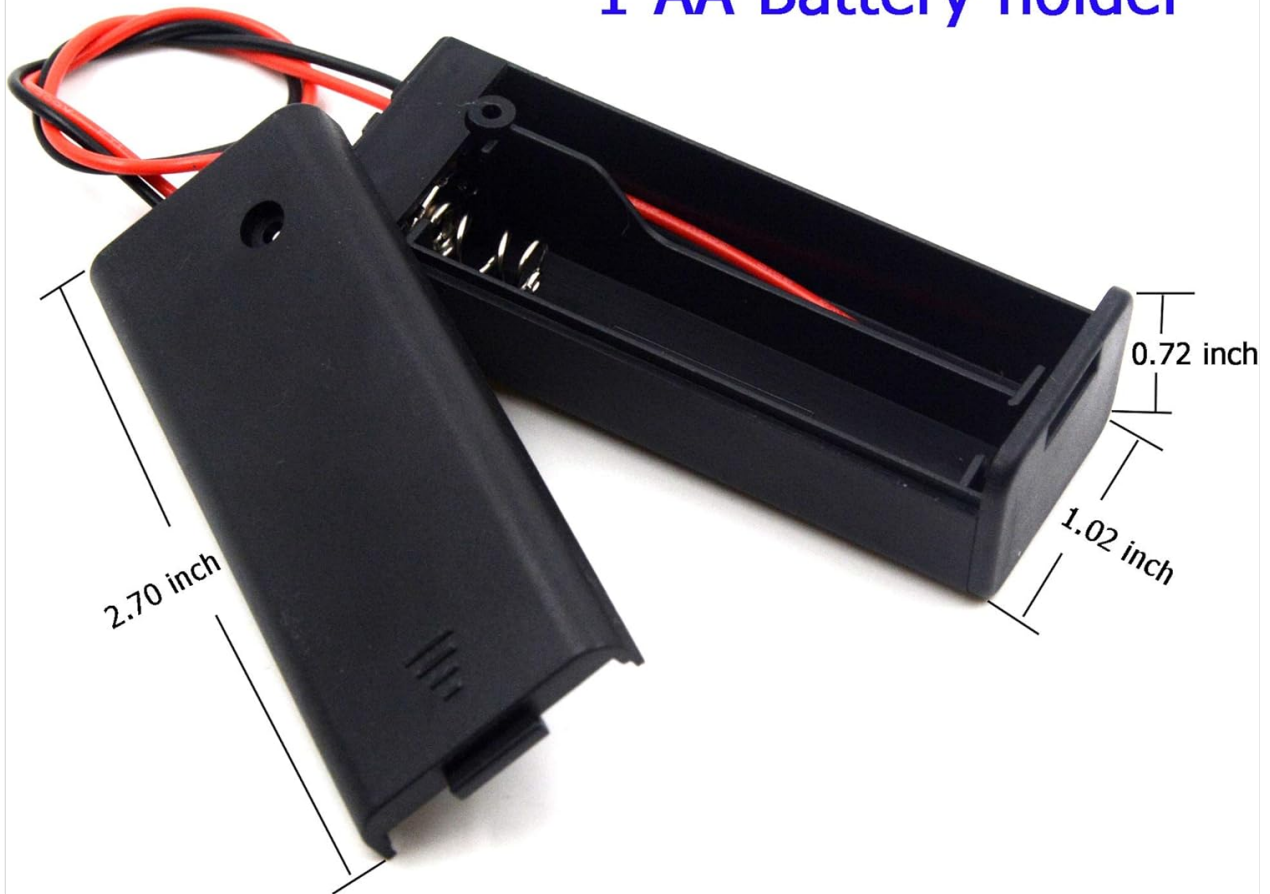
Image: A single AA battery holder with its cover removed, showing the battery compartment and detailed dimensions (length 2.70 inches, width 1.02 inches, height 0.72 inches).