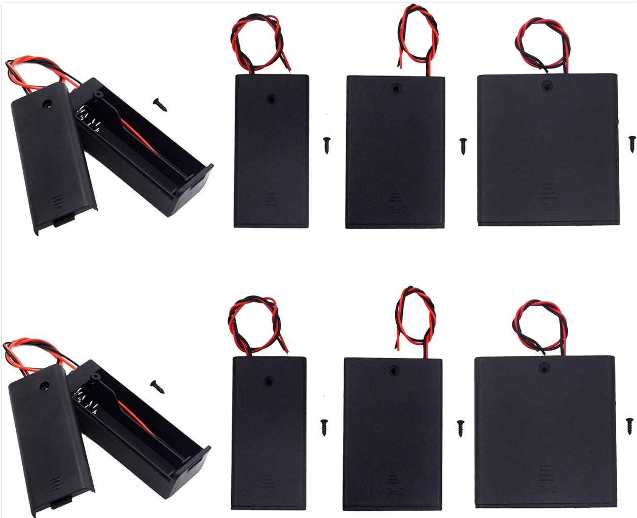
Image: An assortment of eight black AA battery holders, including single, double, triple, and quadruple cell configurations, each with a switch, cover, and red/black wire leads. Screws are also visible.