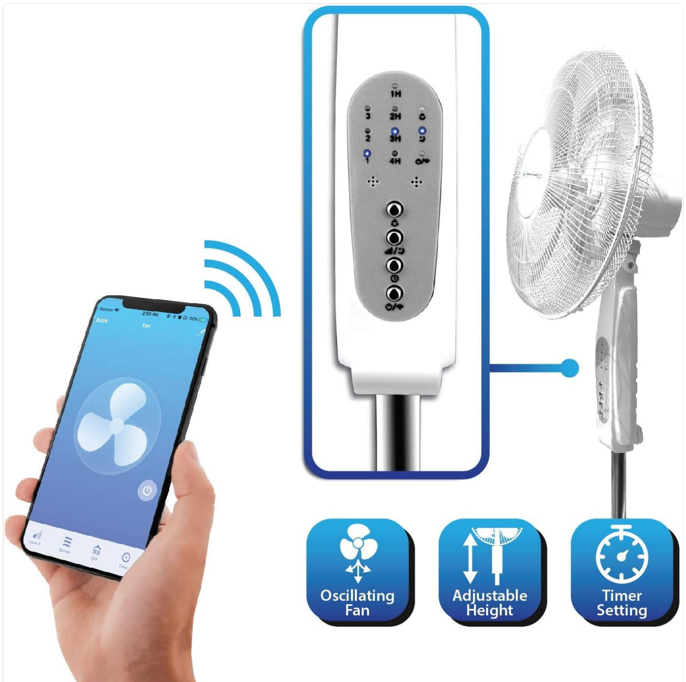
Figure 2: Fan control panel and adjustable height feature