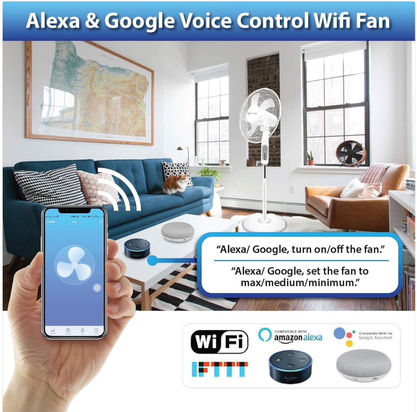
Figure 5: Voice Control with Amazon Alexa and Google Home