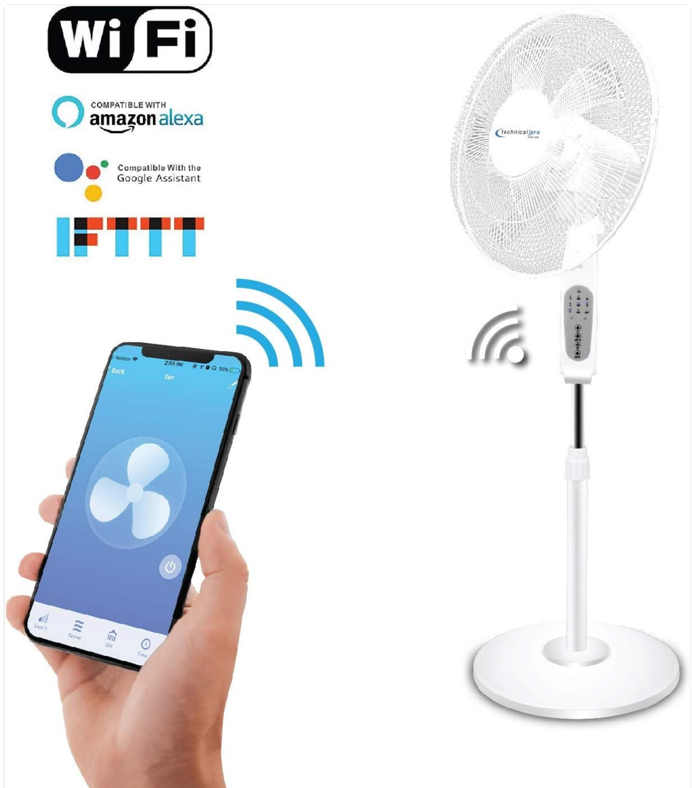
Figure 3: Wi-Fi and Smart Home Compatibility