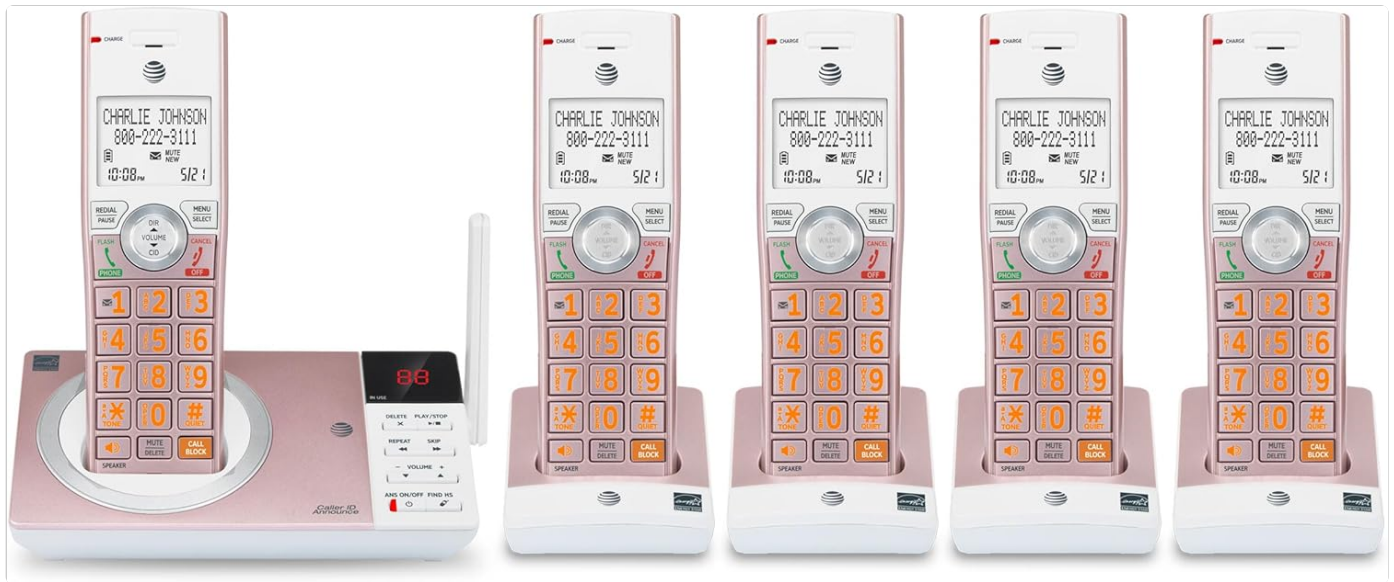
Image: The AT&T CL82557 DECT 6.0 5-Handset Cordless Phone System, showing the main base unit and five rose gold cordless handsets with their individual charging cradles.