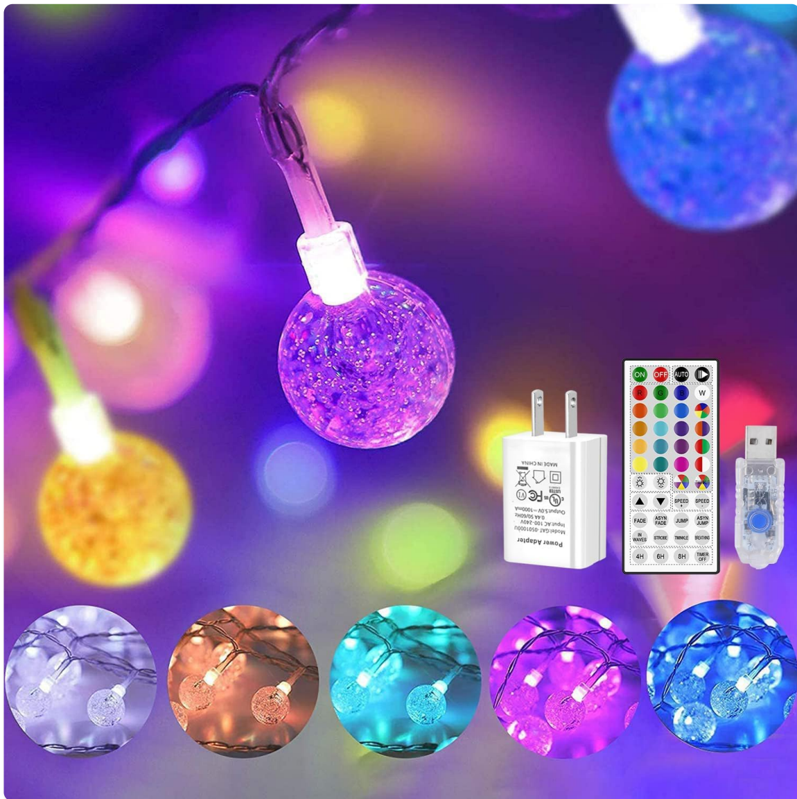
Image 3.1: Package contents including string lights, remote, and USB wall charger.