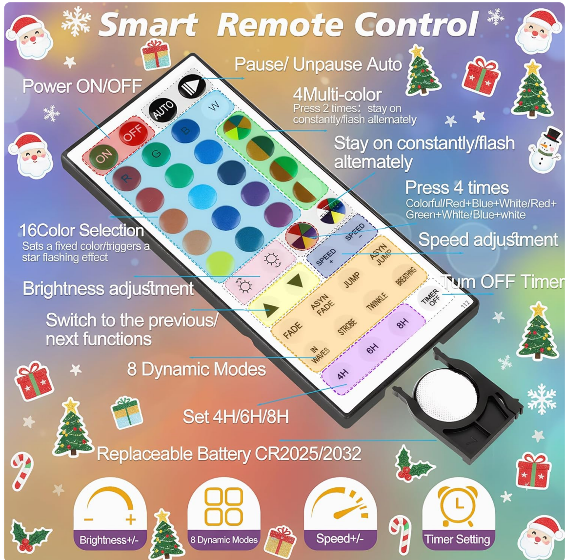
Image 6.1: Layout of the remote control buttons for various functions.