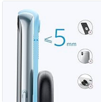
Image 4.4: This diagram illustrates the case compatibility of the wireless charger, showing that it can charge through cases up to 5 mm thick. It also indicates that magnetic and metal attachments or cards will interfere with charging.

The PowerWave 10 Stand is designed to charge directly through most protective cases up to 5 mm thick. This includes cases made of rubber, plastic, or TPU. Magnetic and metal attachments, or cards placed between the phone and the case, will prevent charging and should be removed.