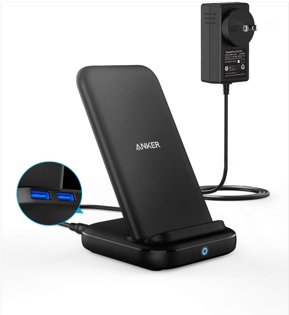
Image 1.1: Anker PowerWave 10 Stand with 2 USB-A Ports and included 36W DC adapter. The image highlights the two USB-A ports on the side of the charging stand.