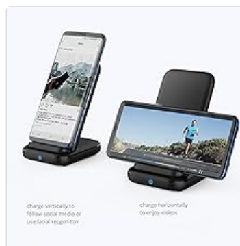
Image 4.2: This image demonstrates the versatility of the Anker PowerWave 10 Stand, showing a smartphone charging vertically (suitable for social media or facial recognition) and horizontally (ideal for watching videos).

The PowerWave 10 Stand supports both vertical and horizontal placement of your smartphone during wireless charging. This allows for continued use of the device, such as watching videos or checking messages, without interrupting the charging process.