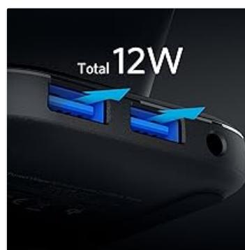
Image 4.3: A close-up view of the two USB-A ports located on the side of the Anker PowerWave 10 Stand, highlighting their combined 12W total output for charging additional devices.

In addition to wireless charging, the stand includes two USB-A ports on the back, providing a combined output of 12W (5V/2.4A max for each port). These ports can be used to charge other devices simultaneously, such as smartwatches, earbuds, or other smartphones that are not Qi-compatible.