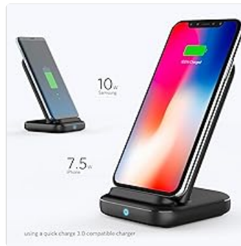
Image 4.1: This image displays the Anker PowerWave 10 Stand with two smartphones, illustrating the different wireless charging speeds. One phone is shown receiving 10W charging (typical for Samsung devices), and another is shown receiving 7.5W charging (typical for iPhone devices).