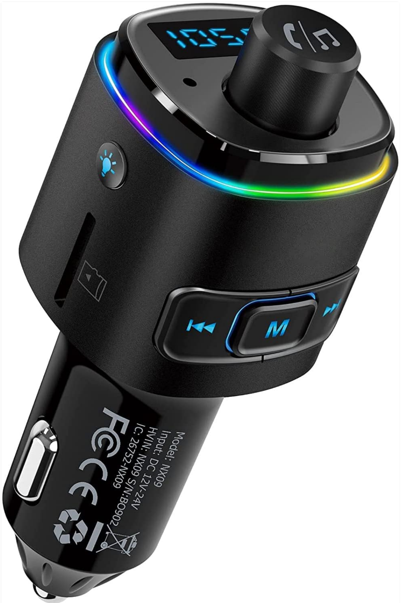
Image: The Nulaxy NX09 Bluetooth FM Transmitter inserted into a car's power outlet, displaying its LED screen.