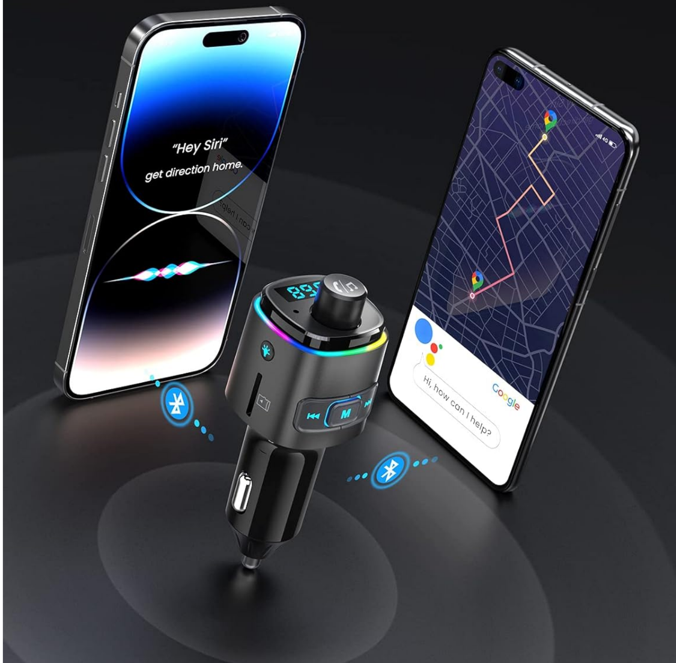
Image: The Nulaxy NX09 facilitating voice navigation with Siri and Google Assistant on connected smartphones.