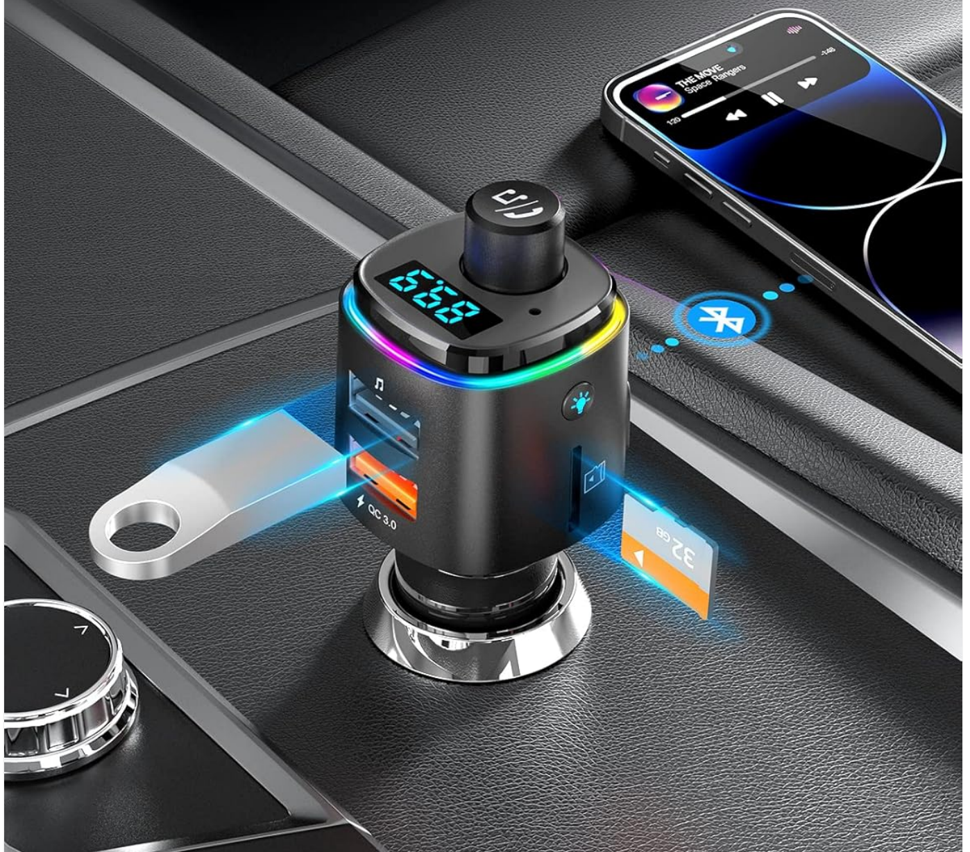
Image: The Nulaxy NX09 displaying its capability to play music from Bluetooth, a USB flash drive, or a microSD card.

Use the "Previous" and "Next" buttons to skip tracks. Rotate the multi-function knob to adjust the volume.