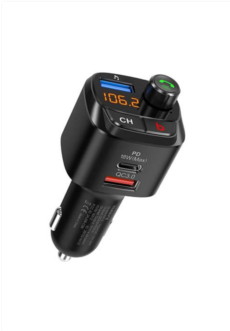
Image: A user interacting with the Nulaxy NX09's multi-function knob to manage a phone call, highlighting the ease of hands-free operation.