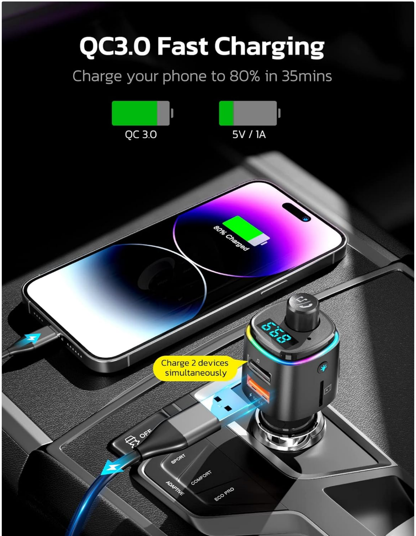
Image: The Nulaxy NX09 demonstrating its dual charging capability, with one phone connected to the QC3.0 port and another to the 5V/1A port.

You can charge two devices simultaneously.