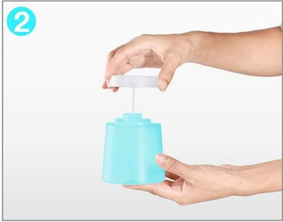
Remove the lid