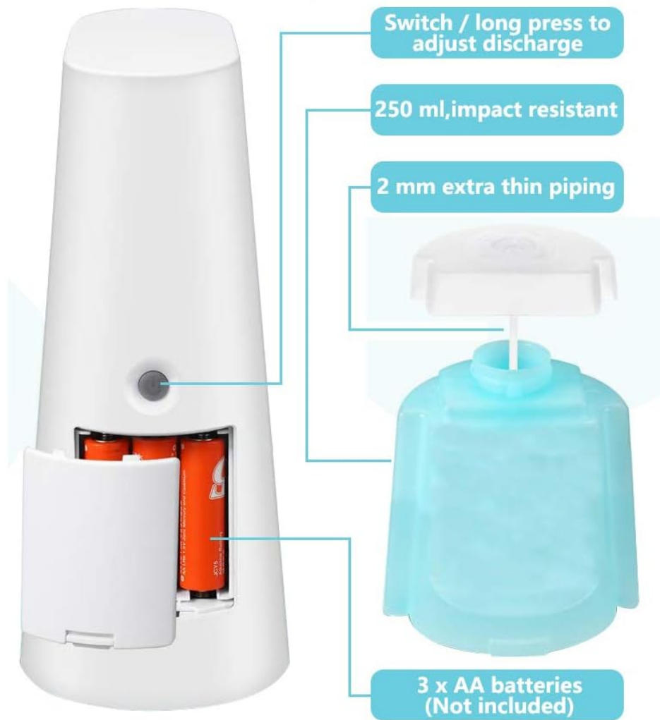
Image: Diagram illustrating the battery compartment for 3x AA batteries and internal components.