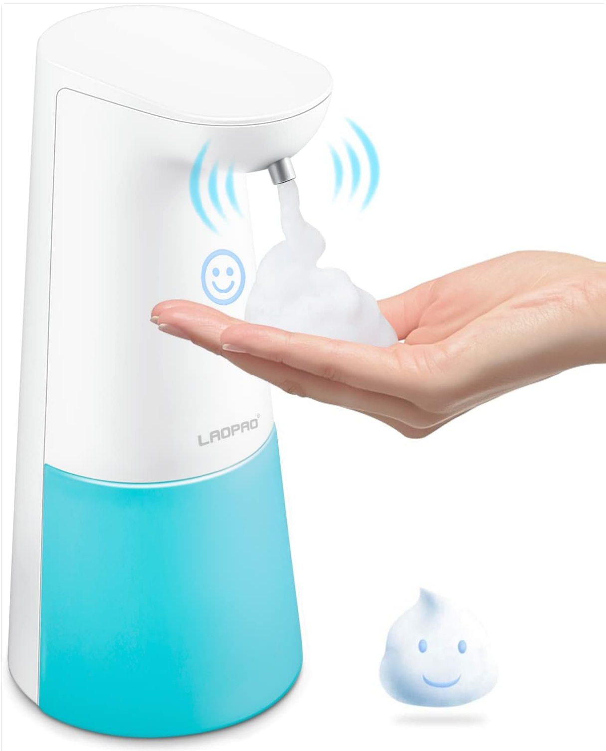
Image: The LAOPAO Automatic Foaming Soap Dispenser in blue and white, demonstrating foam dispensing.