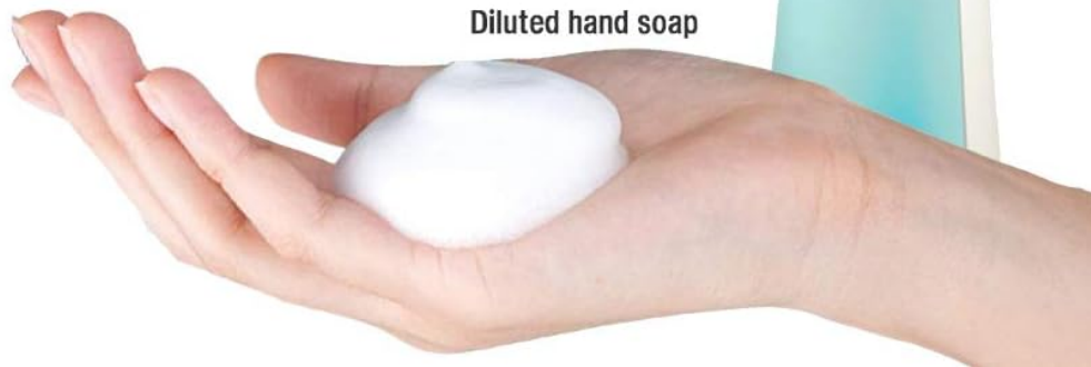
Image: Visual guide on supporting various hand soaps, including direct foaming soap and diluted gel/liquid soap.