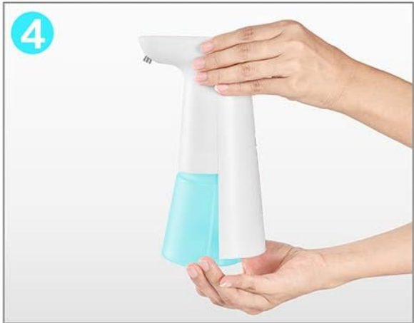
Put soap tank back in place

Image: Step-by-step guide for loading the soap tank, removing the lid, adding soap, and replacing the tank.