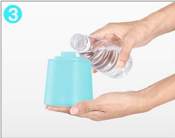
Add foam soap directly or diluted gel/liquid soap