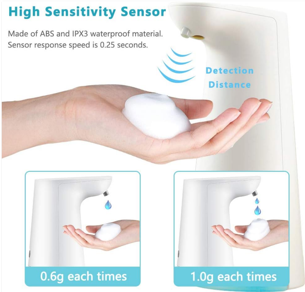
Image: Illustration of the high sensitivity sensor and adjustable foam output levels.

Made of ABS and IPX3 waterproof material. Sensor response speed is 0.25 seconds.