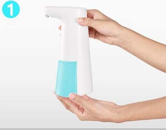
Load the soap tank