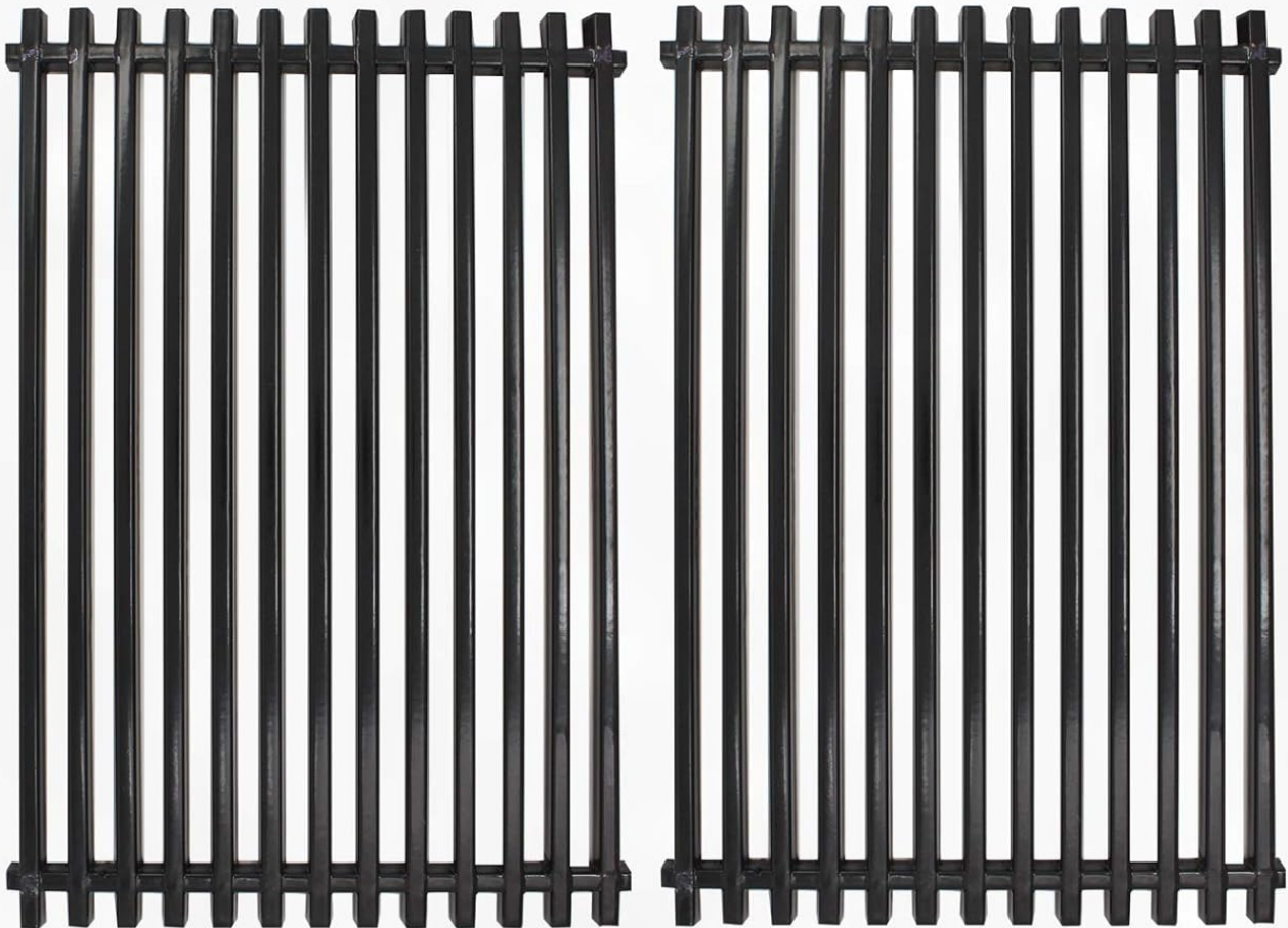
Image: A pair of UpStart Components BBQ grill cooking grates, showcasing the product packaging and the grates themselves. These grates are designed for even heat distribution.