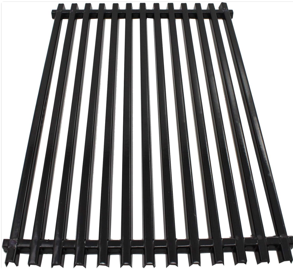
Image: An angled view of one UpStart Components grill grate, demonstrating its sturdy construction and the smooth finish of the porcelain coating.