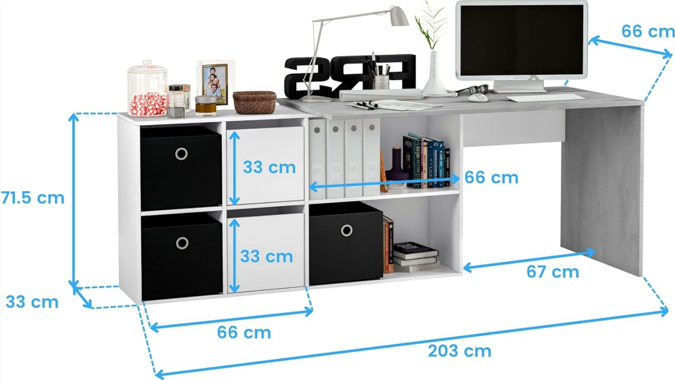
Image 7.1: Detailed dimensions of the desk in an extended configuration.