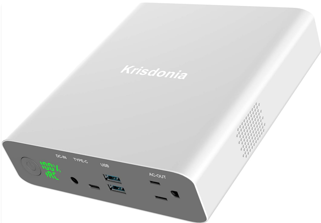
Image 1.1: The Krisdonia 27000mAh 130W AC Power Bank, a compact and powerful portable charger.

This manual provides essential information on how to safely and effectively use your power bank, including setup, operation, maintenance, and troubleshooting tips. Please read this manual thoroughly before using the product and keep it for future reference.