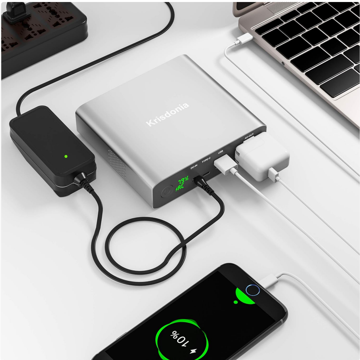
Image 6.1: The power bank simultaneously charging a laptop, smartphone, and itself.