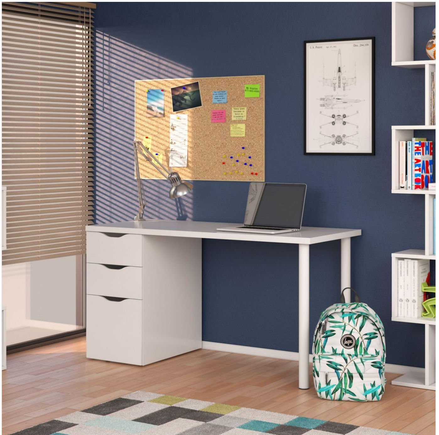
Image 2: The Habitdesign Athena desk positioned in a room with a blue wall and cork board, demonstrating its adaptability to various interior designs. The storage unit is on the left side.