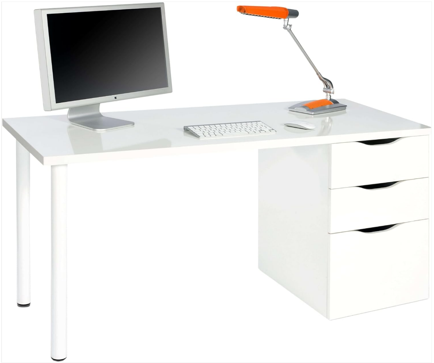
Image 4: The Habitdesign Athena desk set up with a computer monitor, keyboard, and mouse, demonstrating its functionality as a workstation. The storage unit is on the right side.