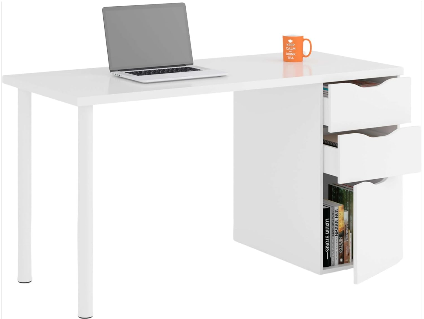
Image 1: The Habitdesign Athena desk in a home office setting, showcasing its clean white finish and integrated storage. A laptop and mug are placed on the desk surface.