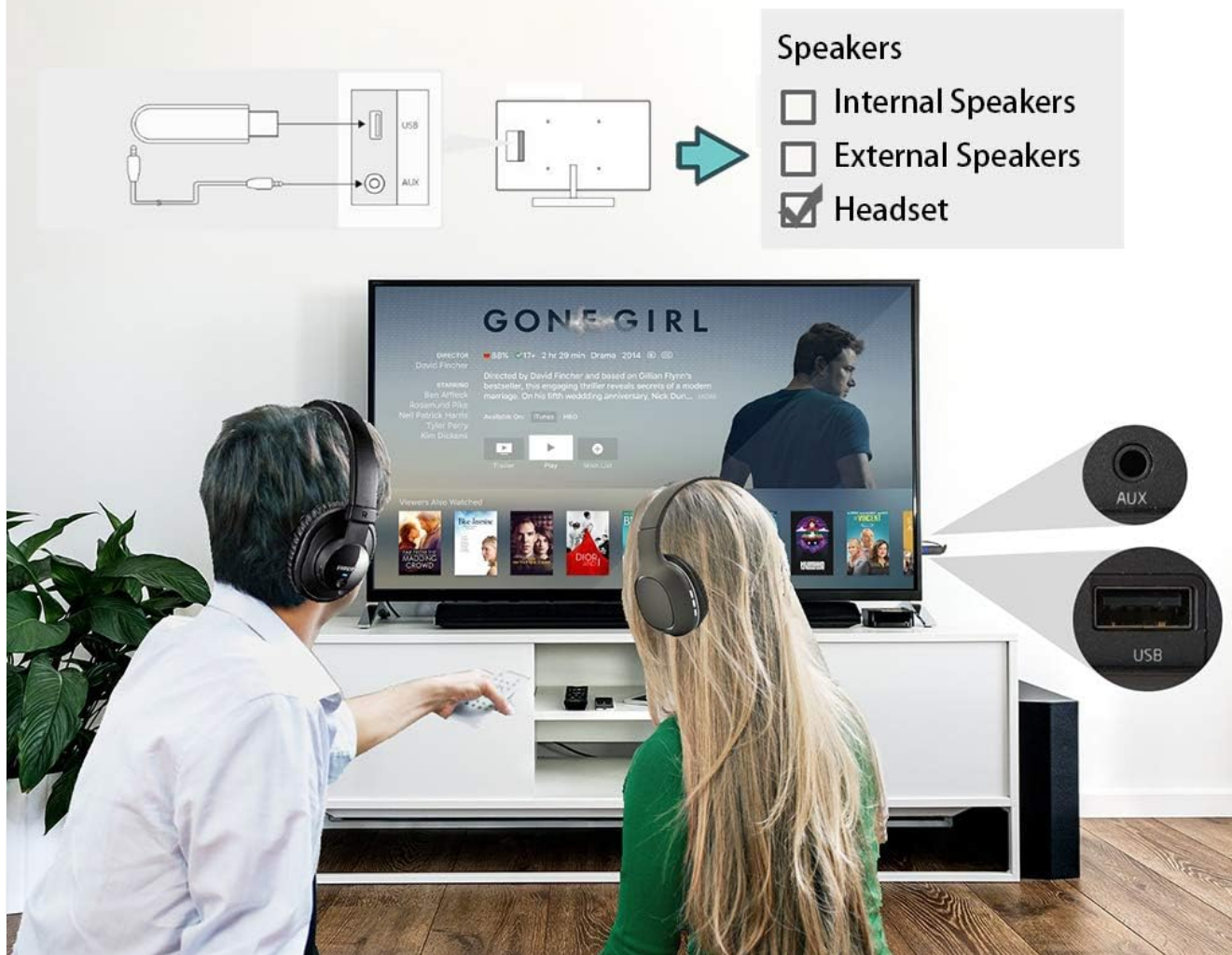
Figure 4: Setup diagram for connecting the Golvery adapter to a TV using both USB for power and a 3.5mm AUX cable for audio input.

Enjoy TV entertainment with great sound quality and no lip-sync audio delay