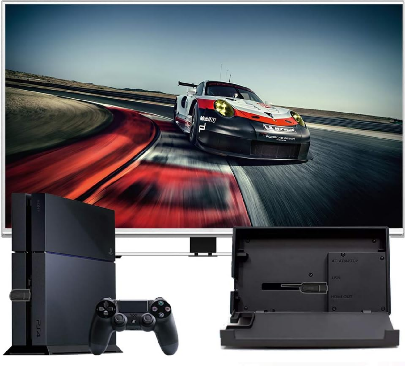
Figure 3: The Golvery adapter connected to a PS4 console and a Nintendo Switch dock, illustrating its use for wireless gaming audio.

NOTE: 3.5MM MIC is required for voice chat need.(Need purchase separately )