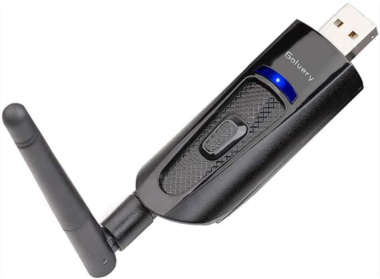
Figure 1: Galvery USB Bluetooth 5.0 Audio Transmitter Adapter with its external antenna attached.

The adapter features a USB-A connector for power and data, an external antenna port for improved range, and a multi-function button for pairing. A blue LED indicator shows the device's status.