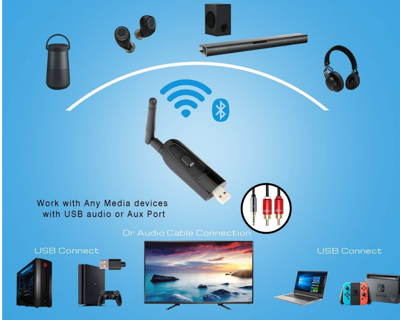
Figure 5: The Golvery adapter is designed to pair exclusively with Bluetooth headphones or speakers for audio transmission.

Important Note: This adapter is designed exclusively for transmitting audio to Bluetooth headphones or speakers. It is not a general-purpose Bluetooth dongle for connecting other Bluetooth devices like keyboards, mice, or game controllers. It functions as a USB audio adapter that uses Bluetooth for its output.