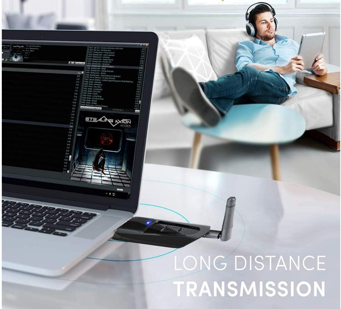
Figure 2: The Golvery adapter connected to a laptop, demonstrating its plug-and-play functionality for PC/Laptop use.

Plug the Golvery adapter directly into an available USB port on your PC or laptop. The device is designed for plug-and-play operation, meaning no specific drivers are typically required for basic audio functionality on Windows 10 or macOS. Once connected, your computer will recognize it as a USB audio device.