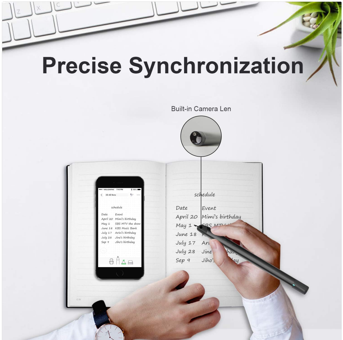
Image: The NEWYES Smart Pen captures handwritten notes from a special notebook and displays them digitally on a connected mobile device.