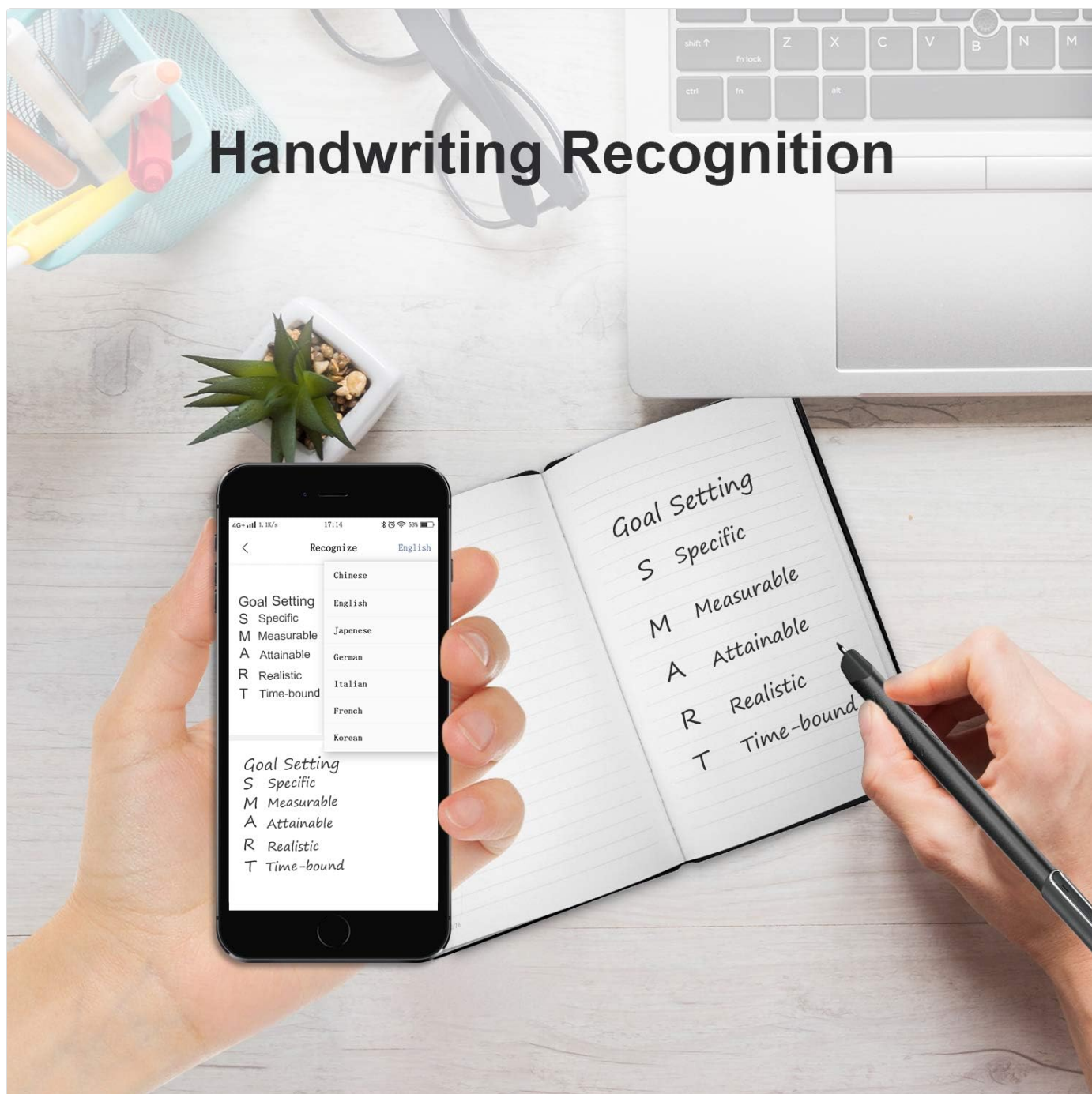
Image: A user writes in a notebook with the Smart Pen, and the corresponding digital text appears on a smartphone screen, illustrating handwriting recognition.

The NEWYES Note app features handwriting recognition, converting your handwritten notes into editable digital text. This function supports both cursive and print. Minor adjustments to your writing style may enhance recognition accuracy.