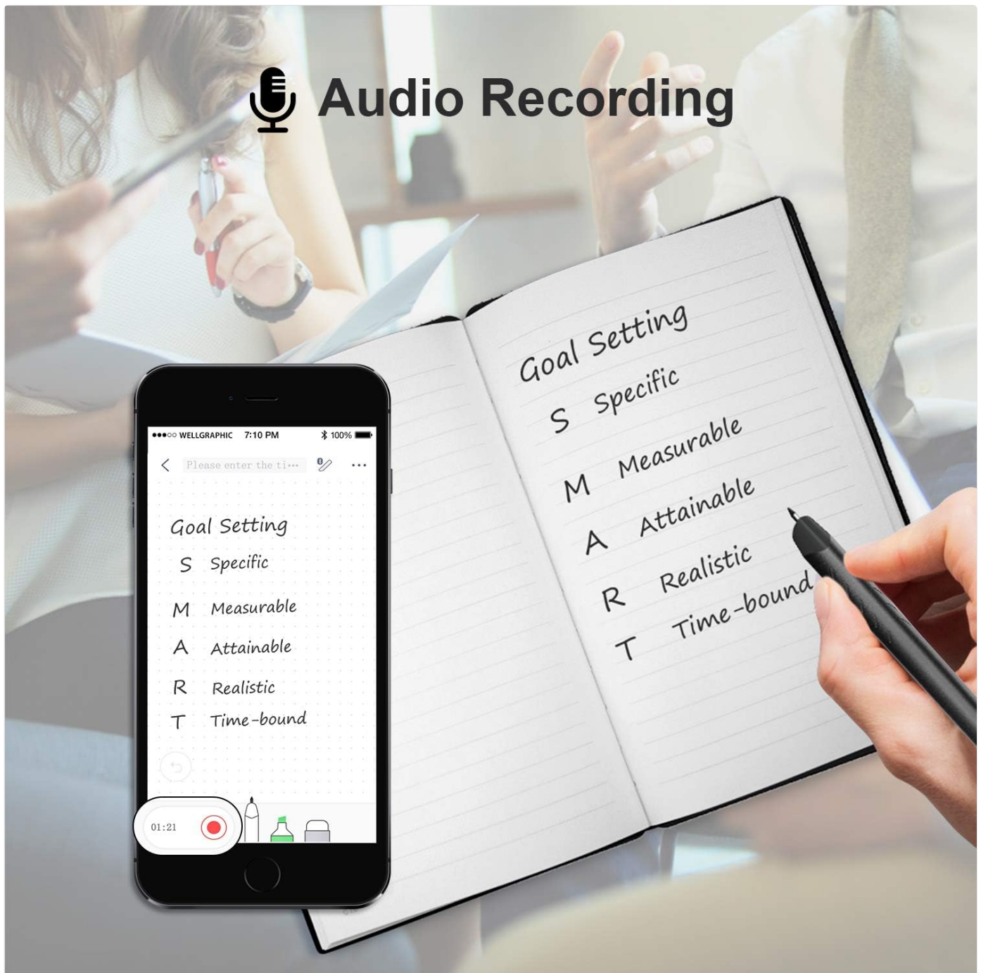
Image: The Smart Pen is used to write in a notebook while a smartphone displays the NEWYES Note app with an active audio recording function.