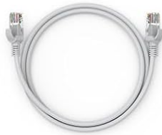
1M Ethernet Cable x 1