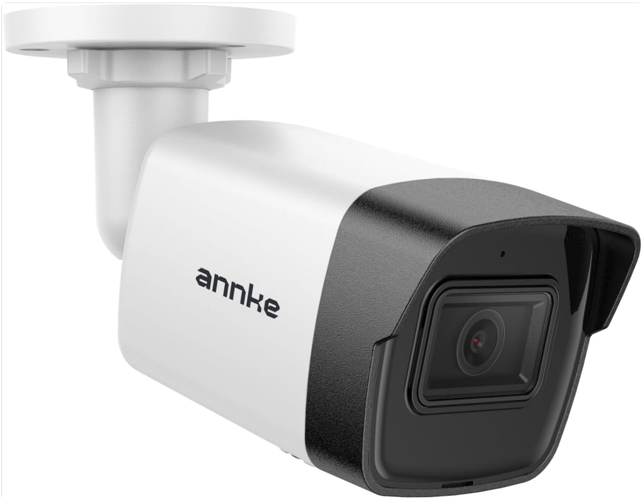
The ANNKE C500-5MP Outdoor PoE Security IP Camera, a robust solution for outdoor surveillance.