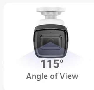
115° Angle of View

Illustration of the items included in the product packaging.