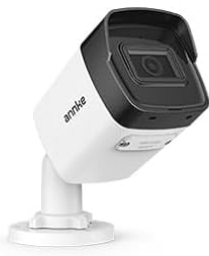
ANNKE Camera x1