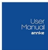
User's Manual For Camera x 1