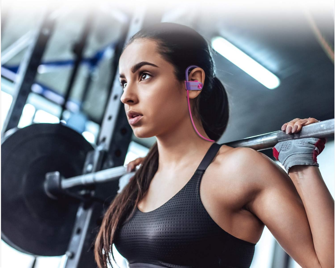
Figure 5.2: Extended Playtime. This image shows the headphones in use during a workout, emphasizing the 8-hour battery life.