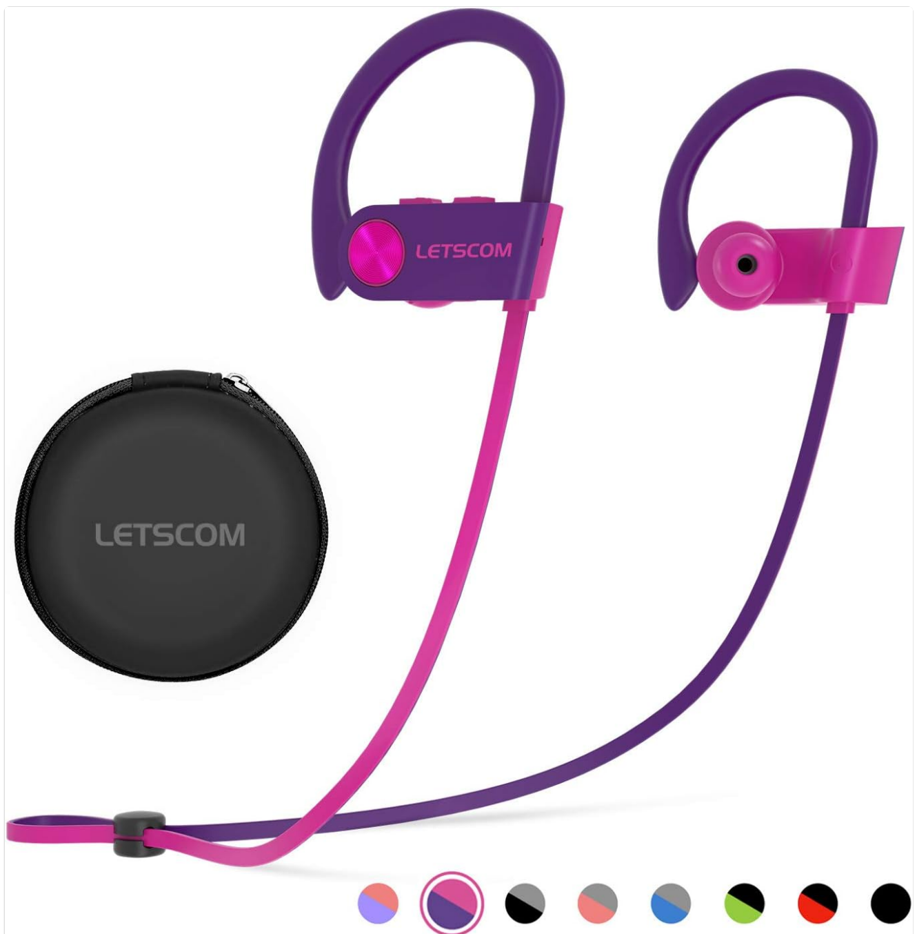
Figure 3.1: LETSCOM U8I Bluetooth Headphones. This image shows the headphones and their accompanying travel case.