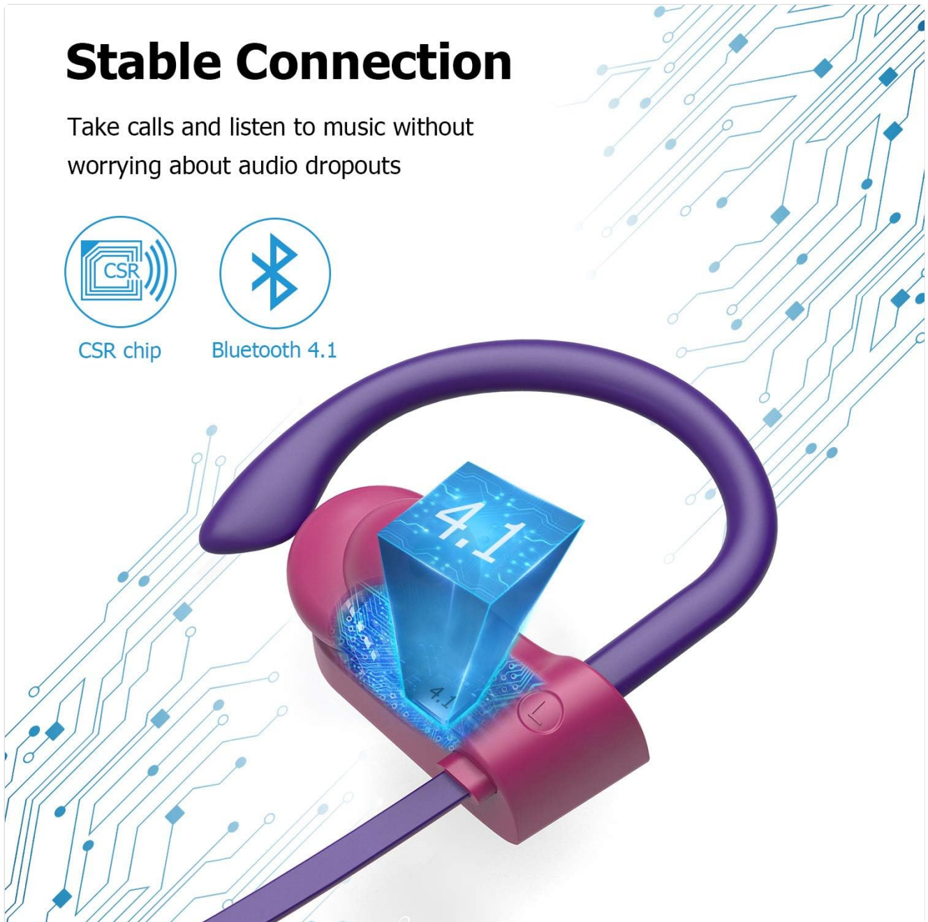
Figure 4.1: Stable Bluetooth Connection. This graphic highlights the Bluetooth 4.1 technology and CSR chip for reliable audio transmission.

The headphones utilize Bluetooth 4.1 for stable connection.