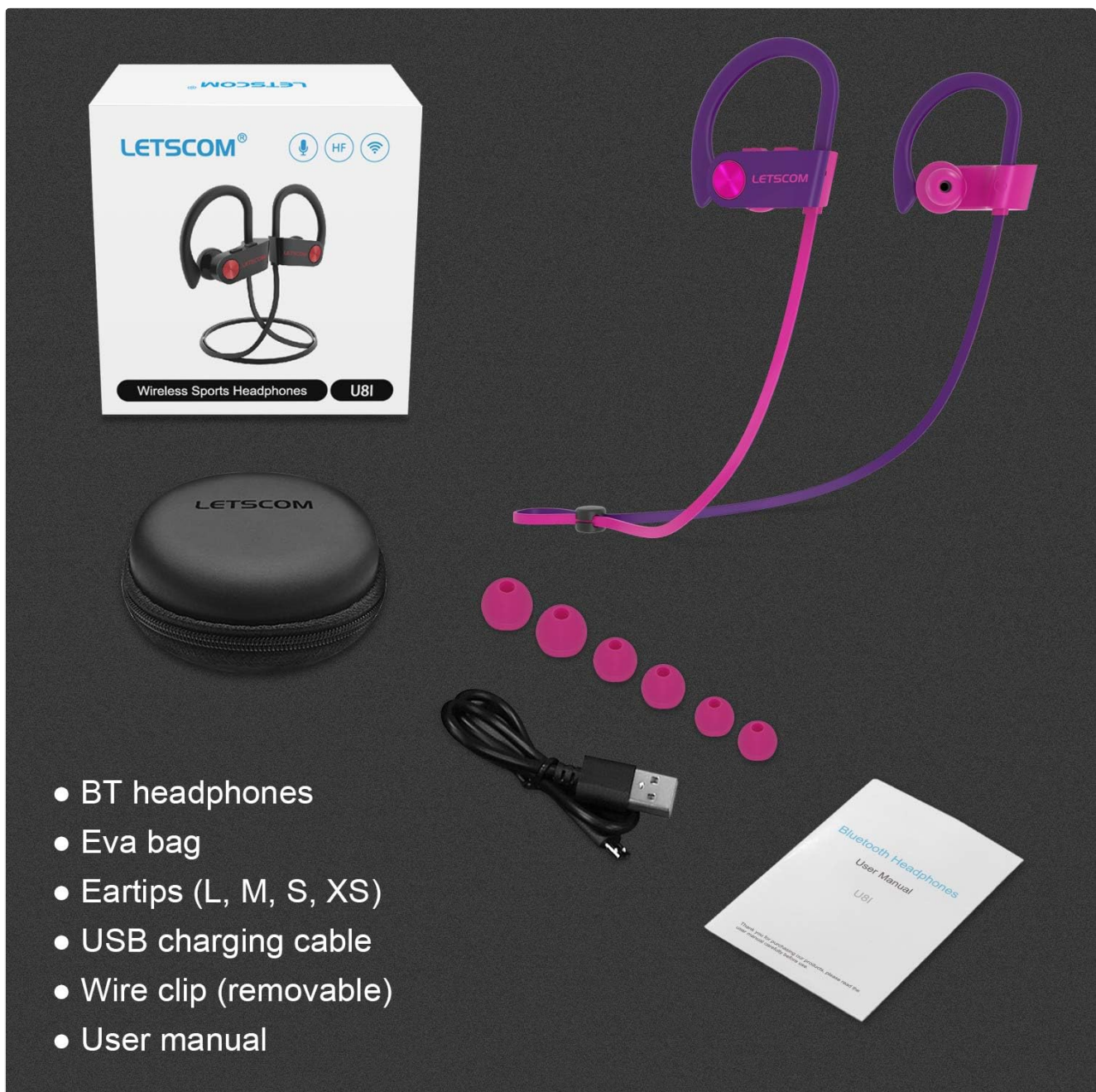
Figure 2.1: LETSCOM U8I Package Contents. This image displays all items included in the product package, neatly laid out for identification.