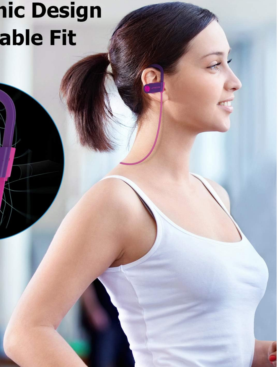
Figure 3.2: Ergonomic Design. This image demonstrates how the headphones fit comfortably around the ear, ensuring stability during activity.