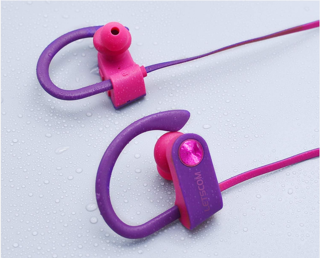
Figure 6.1: IPX7 Waterproof Rating. This image highlights the headphones' resistance to water, making them suitable for workouts and outdoor activities.