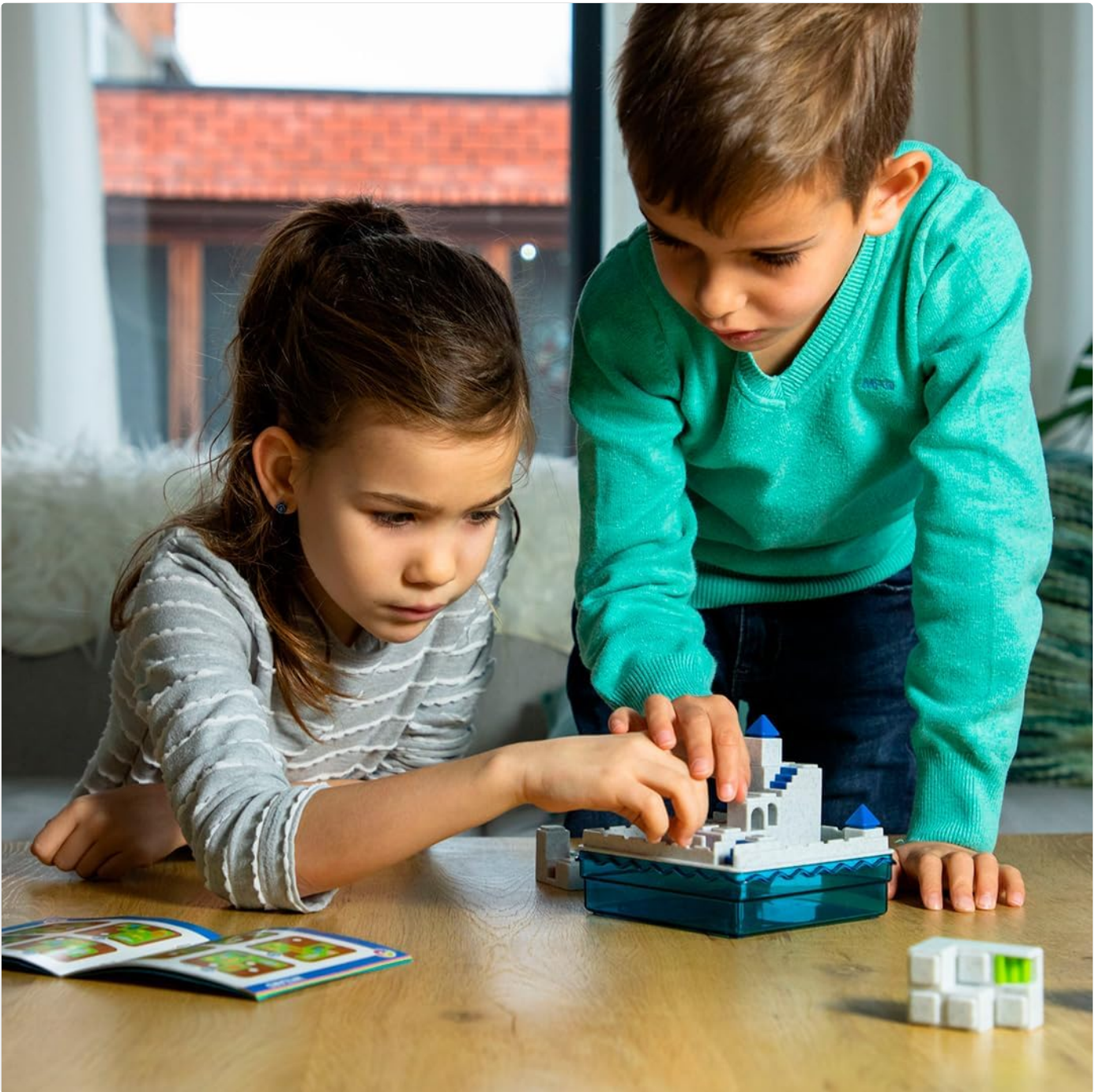
Image: Two children working together to solve an Atlantis Escape challenge, demonstrating collaborative problem-solving.

Image: A player engaged in solving a challenge, carefully positioning a staircase piece to extend the path.