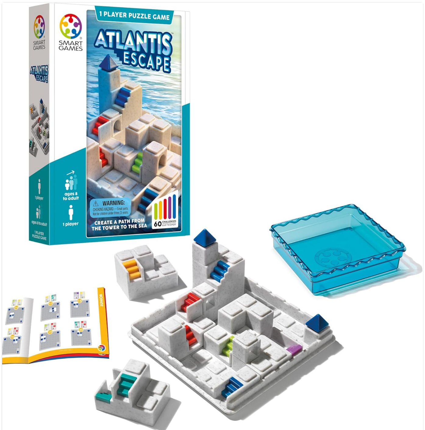
Image: All components of the SmartGames Atlantis Escape, including the game board, various 3D staircase pieces, and the challenge booklet, are shown ready for play.