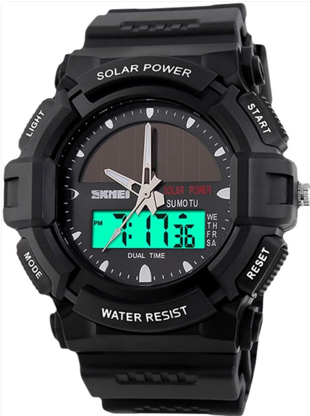
Image: Front view of the SKMEI 1050-Black-F Digital Sports Watch, showcasing its large face and digital display.