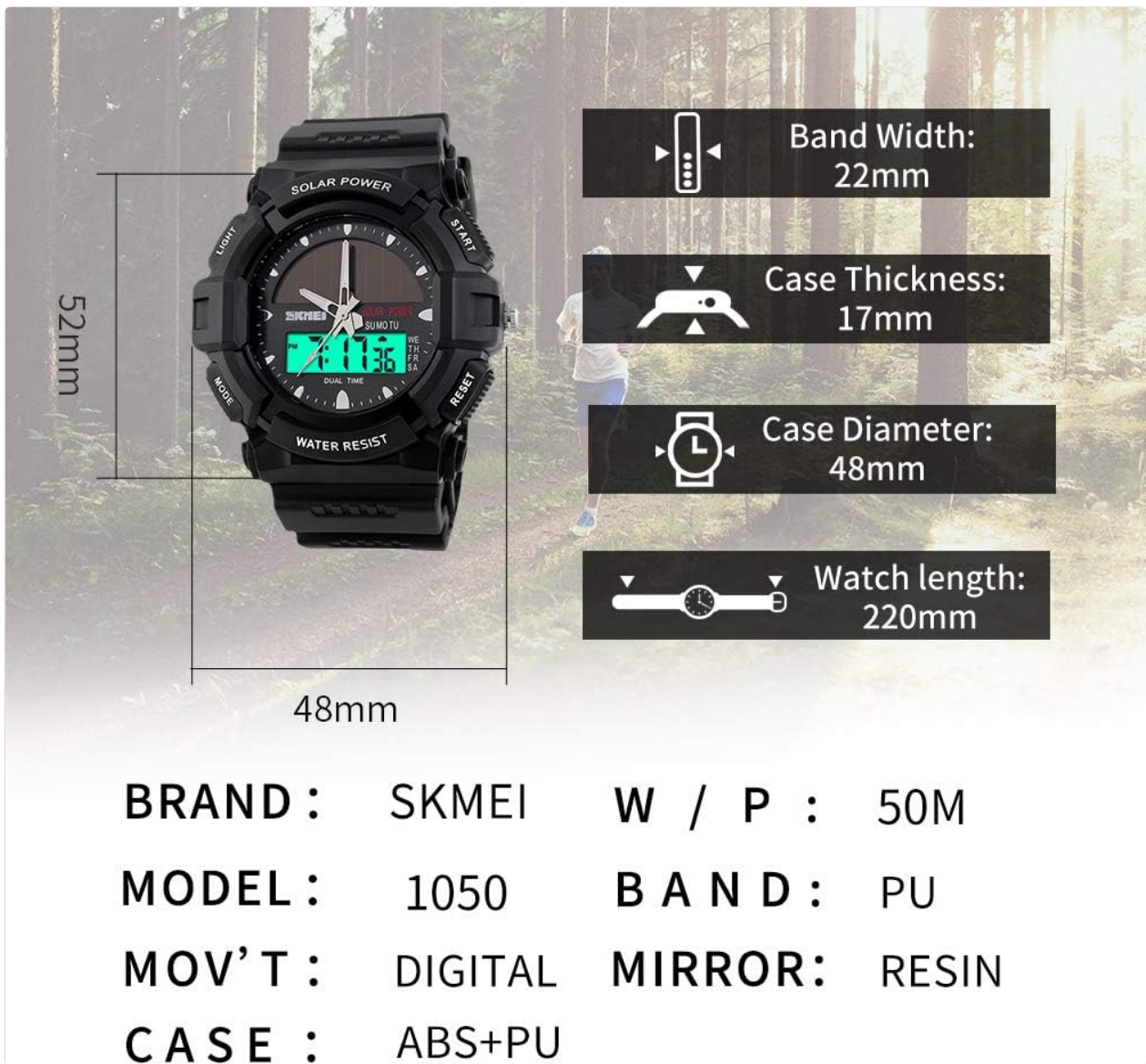
Image: Diagram illustrating the key dimensions of the SKMEI 1050-Black-F watch, including band width, case thickness, case diameter, and watch length.