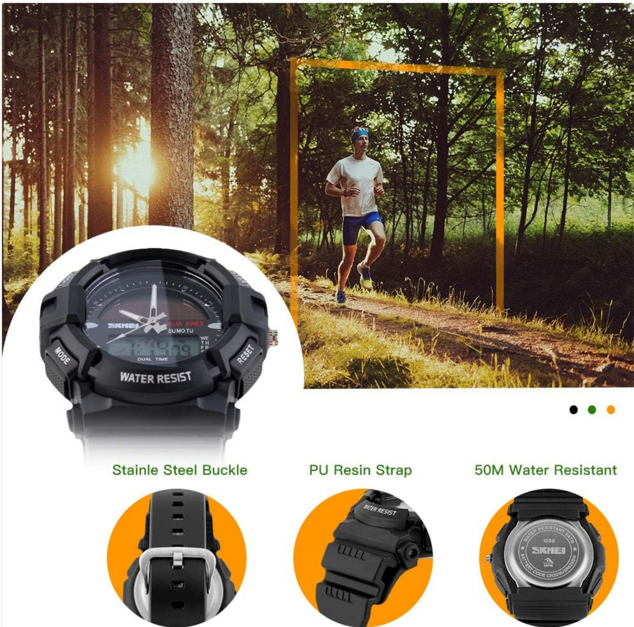
Image: Close-up view of the watch's stainless steel buckle, PU resin strap, and an indication of its 50M water resistance.