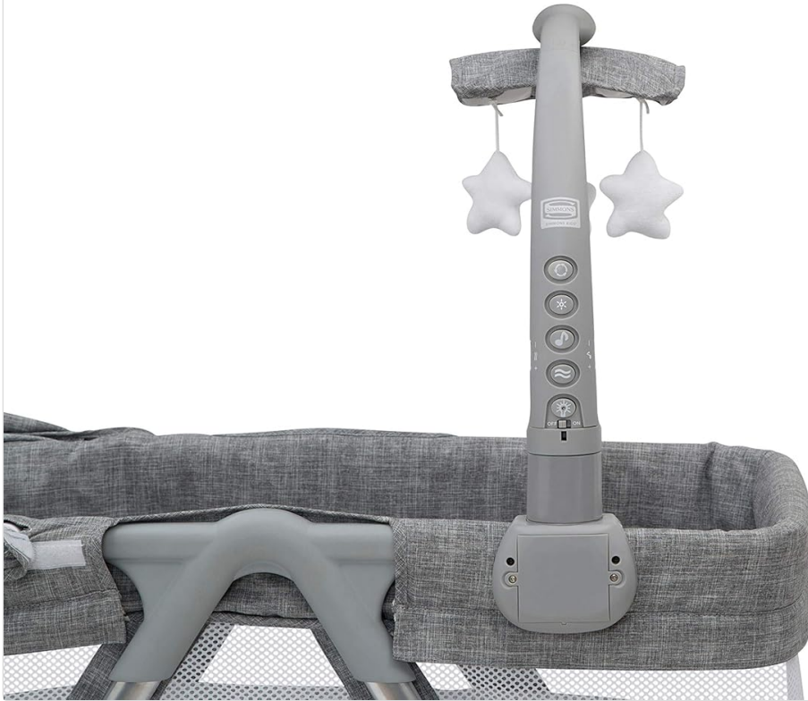
Image 5.1: Controls on the electronic mobile arm for nightlight, vibrations, twinkle lights, and music.