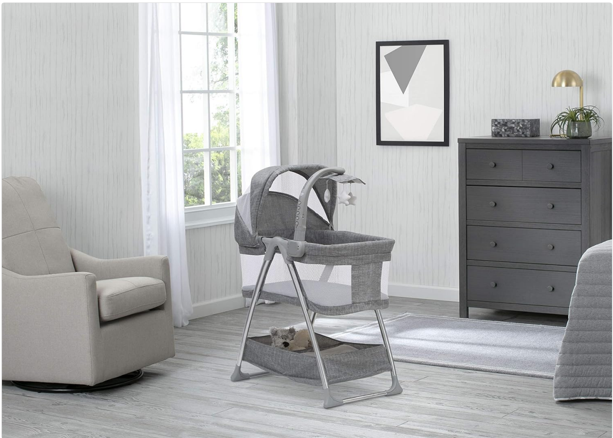
Image 1.1: The Simmons Kids City Sleeper Bedside Bassinet in a modern bedroom.