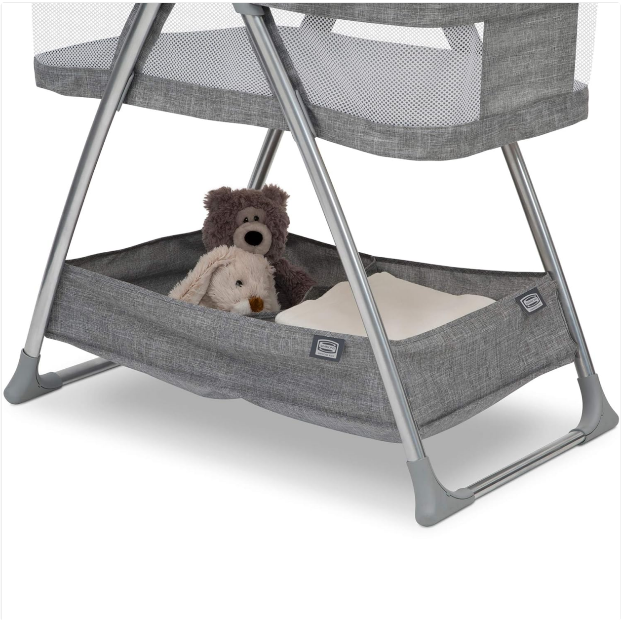
Image 4.2: The spacious storage basket located beneath the bassinet.