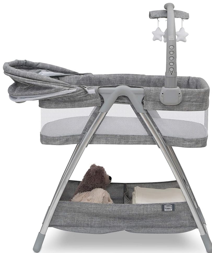
Image 5.2: The bassinet with its canopy retracted for open access.