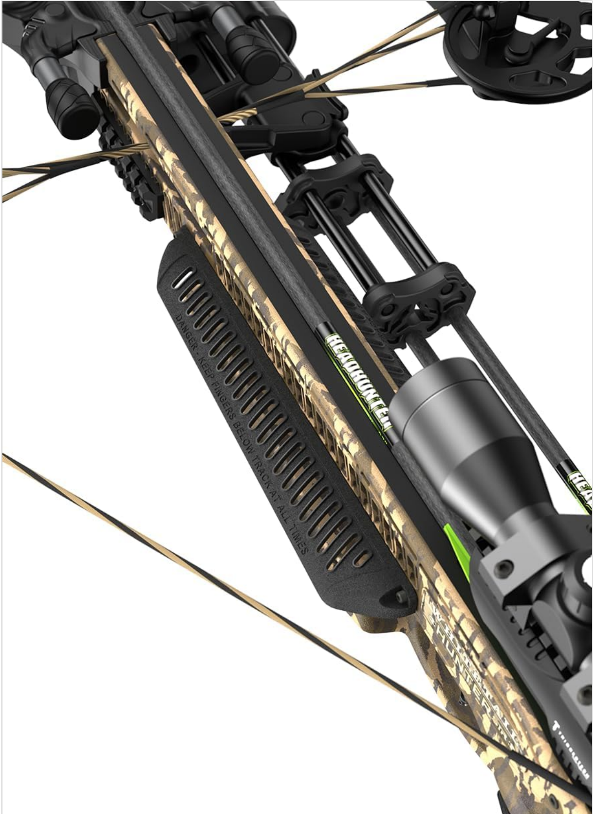
Image: A close-up of the rear stock of the Barnett Whitetail Hunter STR Crossbow, showing the buttstock and the integrated stirrup. This area is used for bracing the crossbow during cocking.