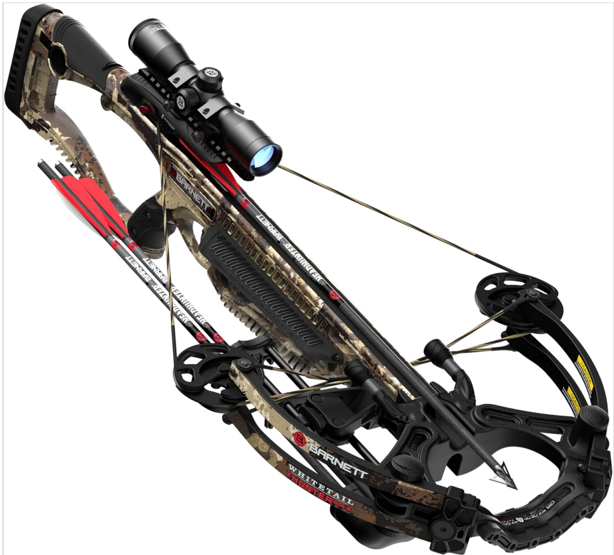
Image: The Barnett Whitetail Hunter STR Crossbow, featuring a camouflage pattern, mounted scope, and two arrows in the quiver. This image provides an overall view of the assembled crossbow.