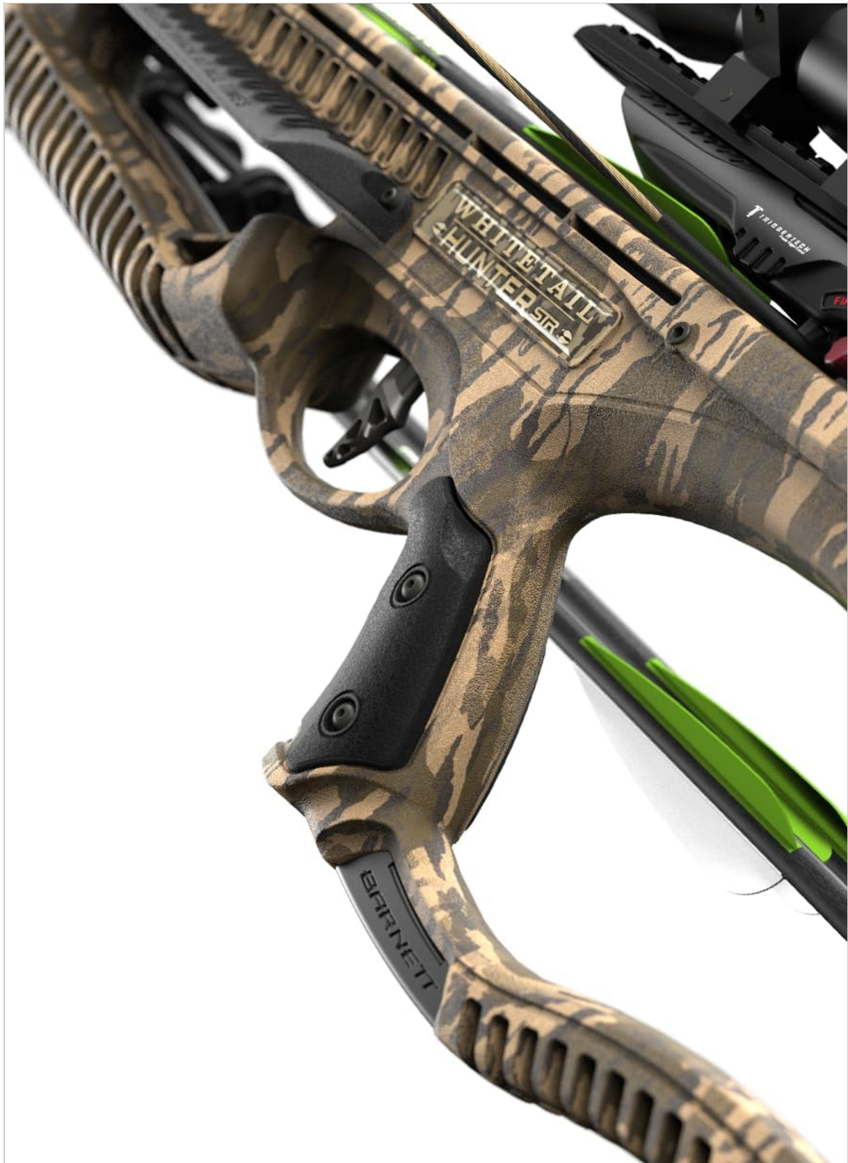
Image: A detailed view of the grip and trigger area of the Barnett Whitetail Hunter STR Crossbow, highlighting the TriggerTech Frictionless Release Technology. This image is relevant for understanding the firing mechanism.