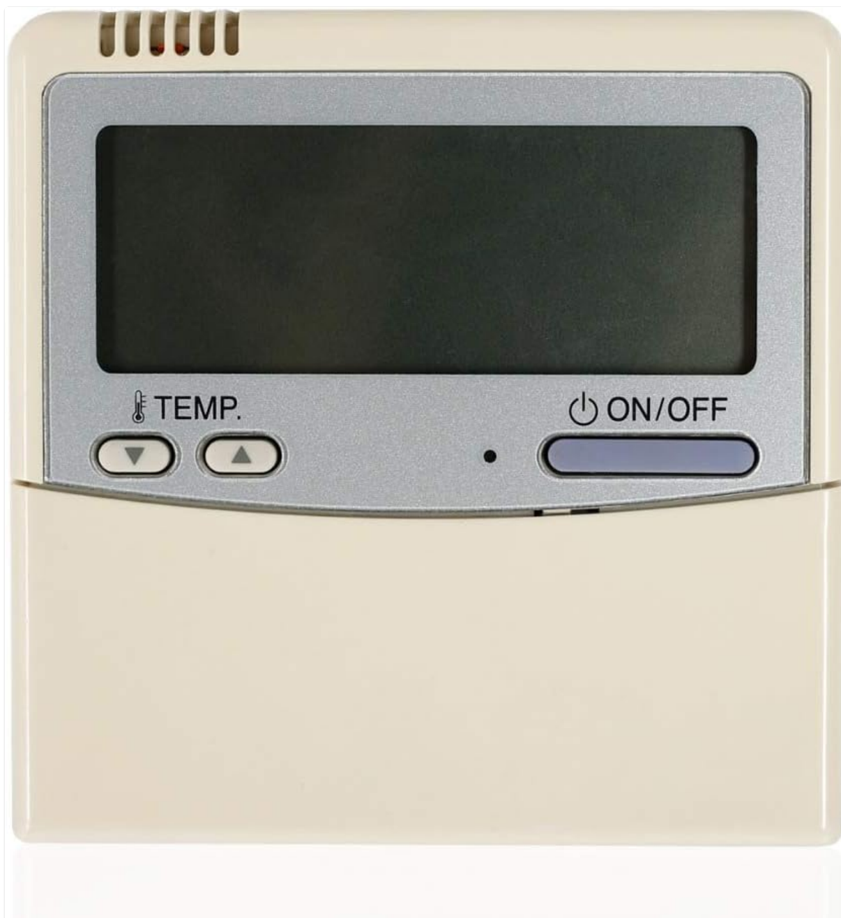
Figure 1: Front view of the remote control. This image displays the primary interface of the remote, including the display area, temperature controls, and power button.