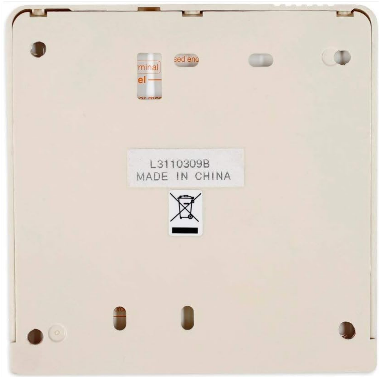
Figure 2: Back view of the remote control. This image shows the rear of the device, including the battery cover and manufacturing details.