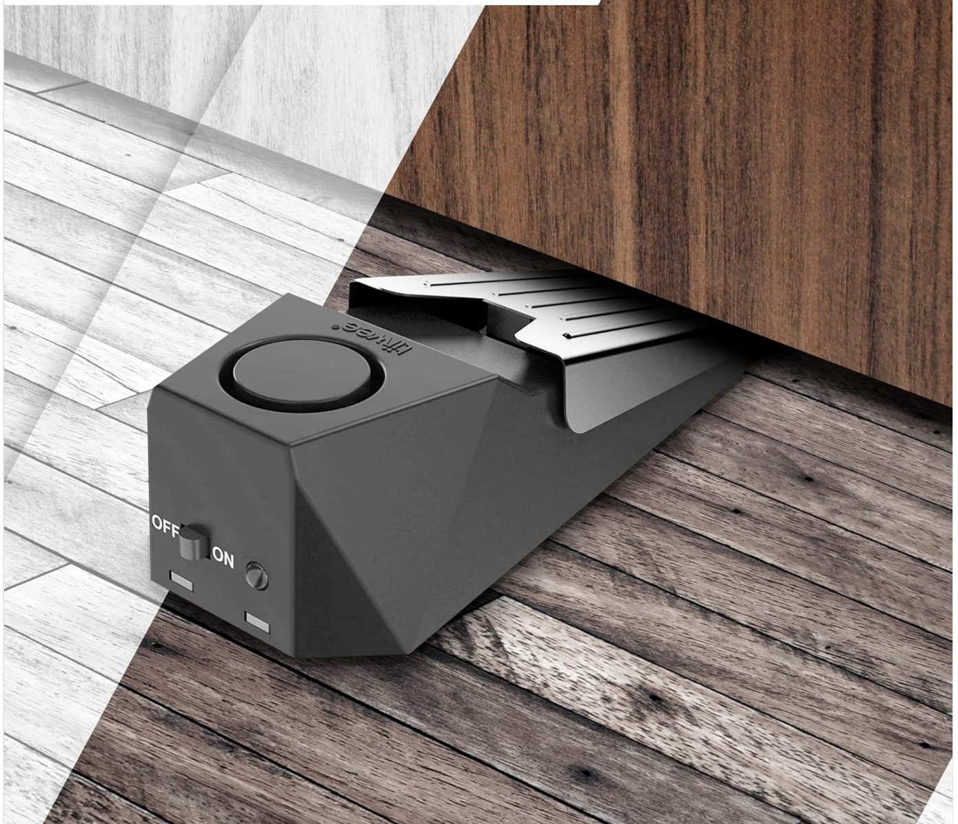
Image: The door stopper alarm positioned securely under a closed wooden door, ready to detect movement.