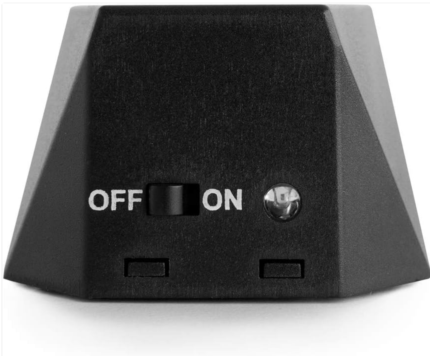
Image: A detailed view of the ON/OFF switch and the small LED indicator light on the side of the tiivee door stopper alarm.