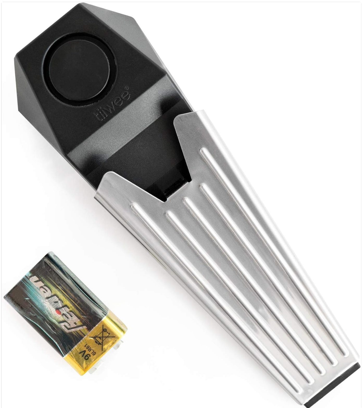
Image: The tiivee door stopper alarm next to a 9V battery, illustrating the battery type required.