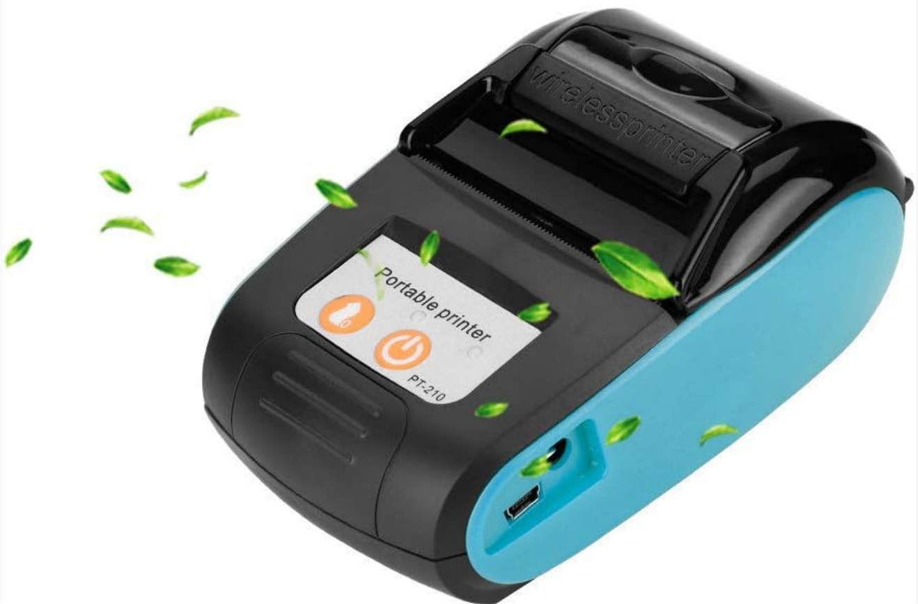
Figure 2: The PT-210 features a 1500mAh 7.4V rechargeable lithium-ion battery.

The 1500mAh 7.4V rechargeable lithium-ion battery can operate continuously for 3 days.