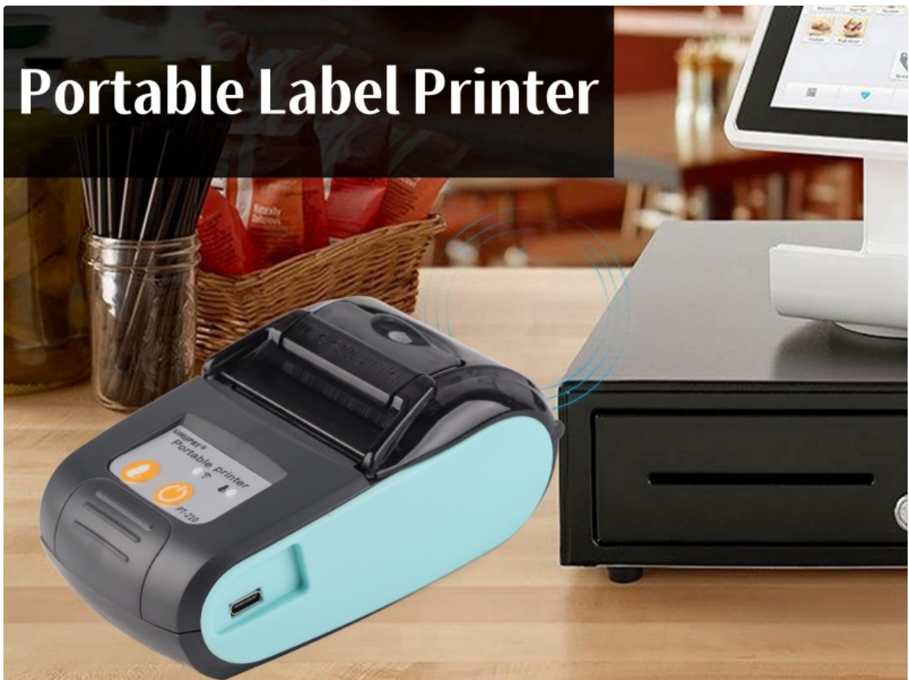
Figure 6: The printer supports smartphone control for easy operation.

After successfully connecting the printer via Bluetooth, open your chosen printing application (e.g., CaysnPrinter for Android, Printer - x for iOS). Within the application, select the PT-210 as your printer and initiate the print command. The printer will automatically process and print the receipt or bill.