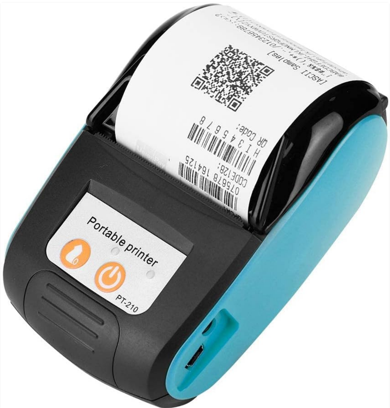
Figure 1: Tangxi PT-210 Portable Thermal Receipt Printer.