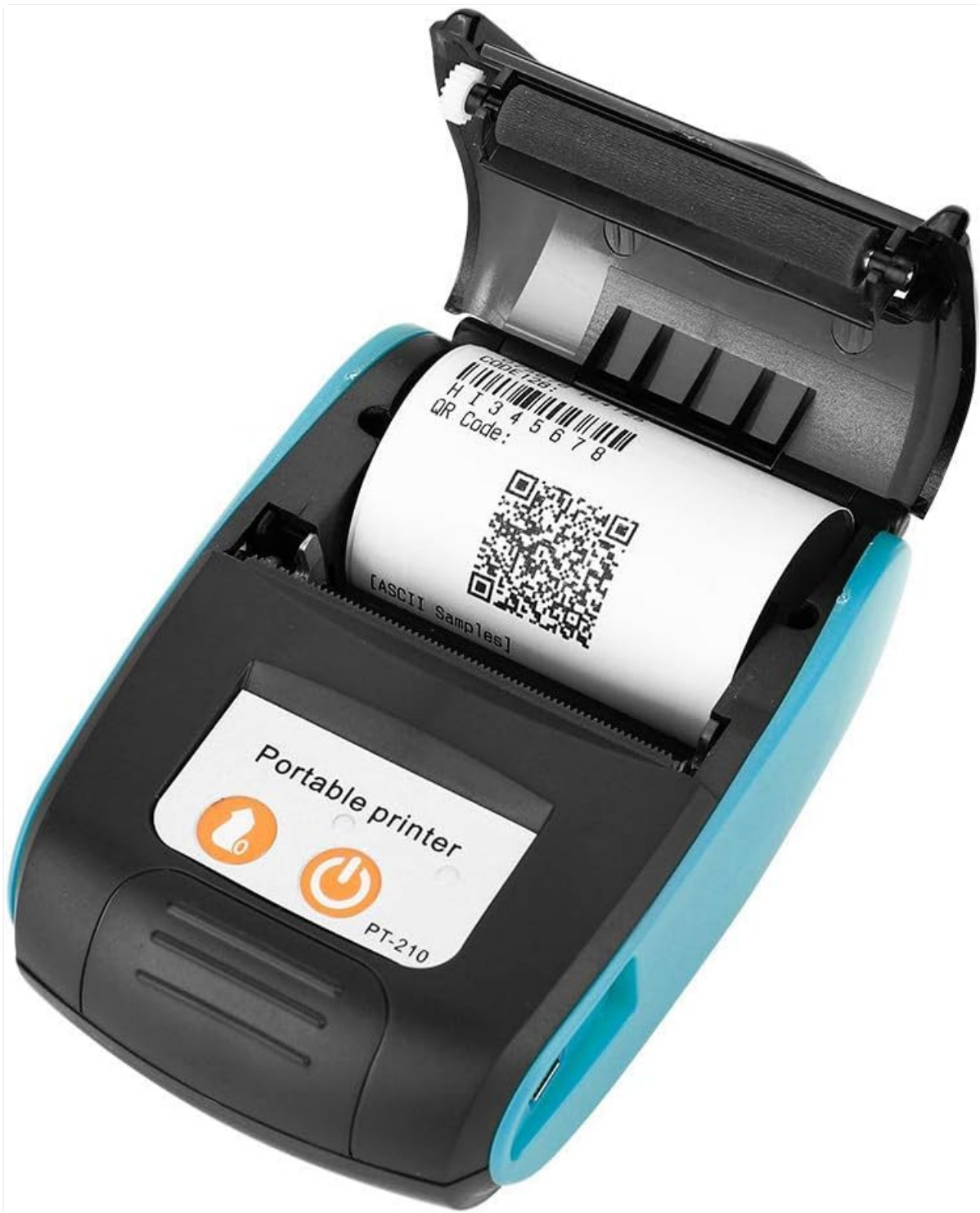
Figure 3: Loading thermal paper into the PT-210 printer.