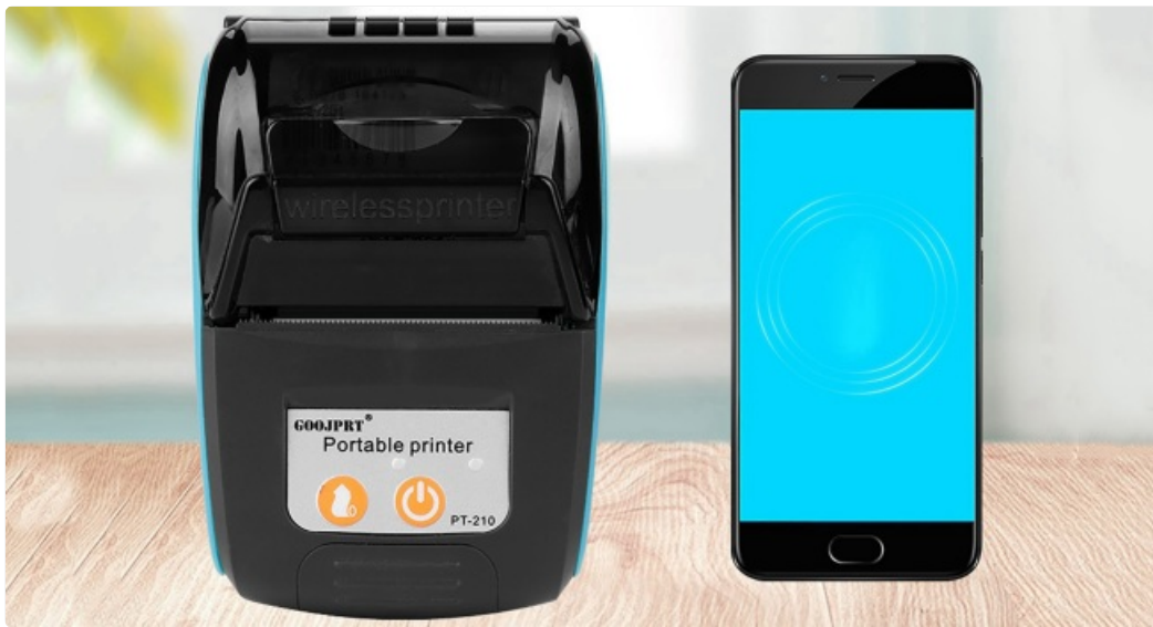
Figure 5: The PT-210 supports Bluetooth 4.0 for wireless printing.