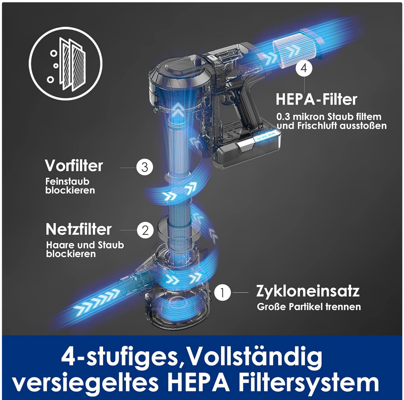
Image 5.1: A detailed diagram illustrating the 4-stage fully sealed HEPA filter system of the Tineco A11 Hero, showing the cyclone insert, mesh filter, pre-filter, and HEPA filter, and their respective functions in separating and blocking particles.