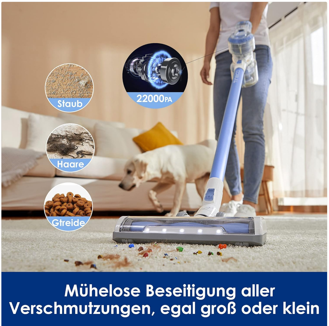
Image 4.1: The Tineco A11 Hero effortlessly removing various types of dirt, including dust, hair, and larger particles like grains, from a carpeted floor.