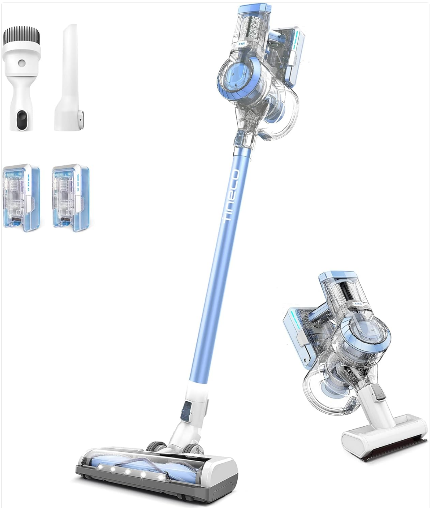
Image 1.1: The Tineco A11 Hero Cordless Vacuum Cleaner, showcasing its main body, extension wand, floor brush, and various accessories including two batteries and different nozzles.