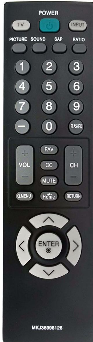
Image: Front view of the VINJABTY MKJ36998126 remote control, showing the button layout. The battery compartment is on the reverse side.