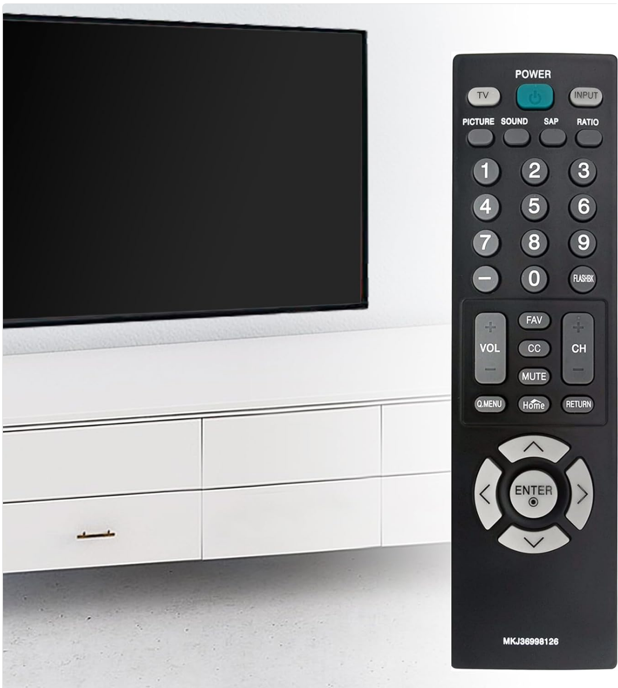
Image: The VINABTY MKJ36998126 remote control shown next to a compatible LG television, illustrating its intended use.