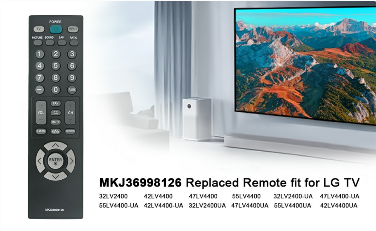
Image: The VINABTY MKJ36998126 remote control displayed alongside a list of compatible LG TV models, including 32LV2400, 42LV4400, 47LV4400, and 55LV4400 series.

Image: The VINABTY MKJ36998126 remote control with its length (7.28 inches) and width (1.97 inches) clearly marked.