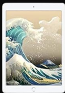
iPad (6th / 7th / 8th Gen)