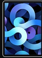
iPad Air (3rd / 4th Gen)