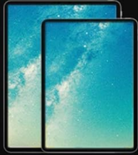
iPad Pro (3rd / 4th Gen, 11" & 12.9")