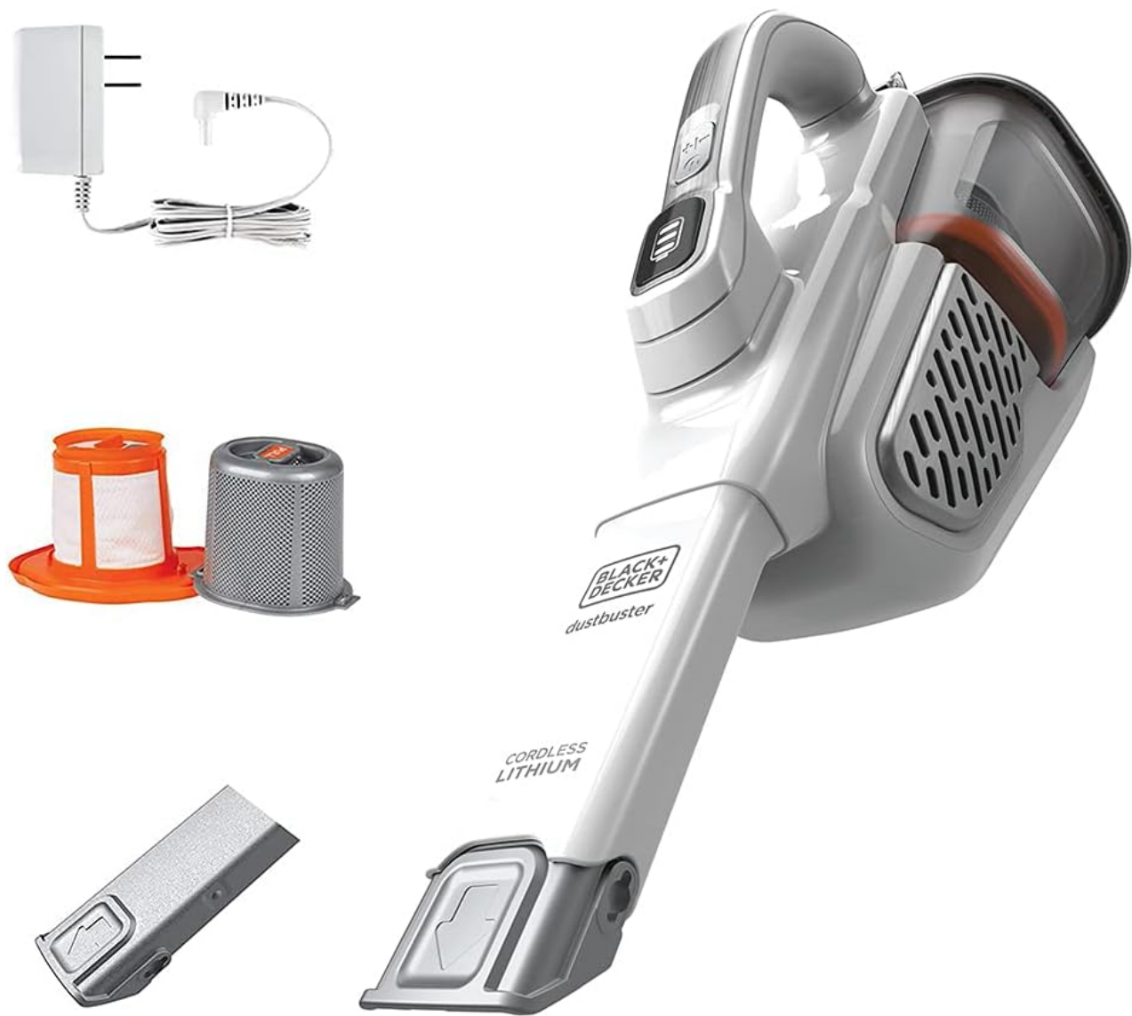
Image: The BLACK+DECKER Dustbuster Handheld Vacuum, Model HHVK320J10, shown with its included charger, pre-filter, and main filter.