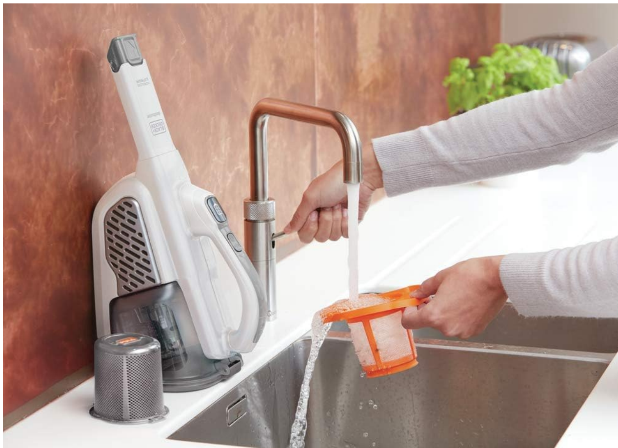
Image: A person rinsing the orange main filter and the grey pre-filter under a kitchen faucet.