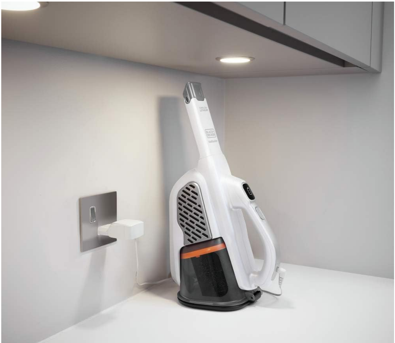
Image: The handheld vacuum plugged into a wall outlet for charging, resting on a kitchen counter.