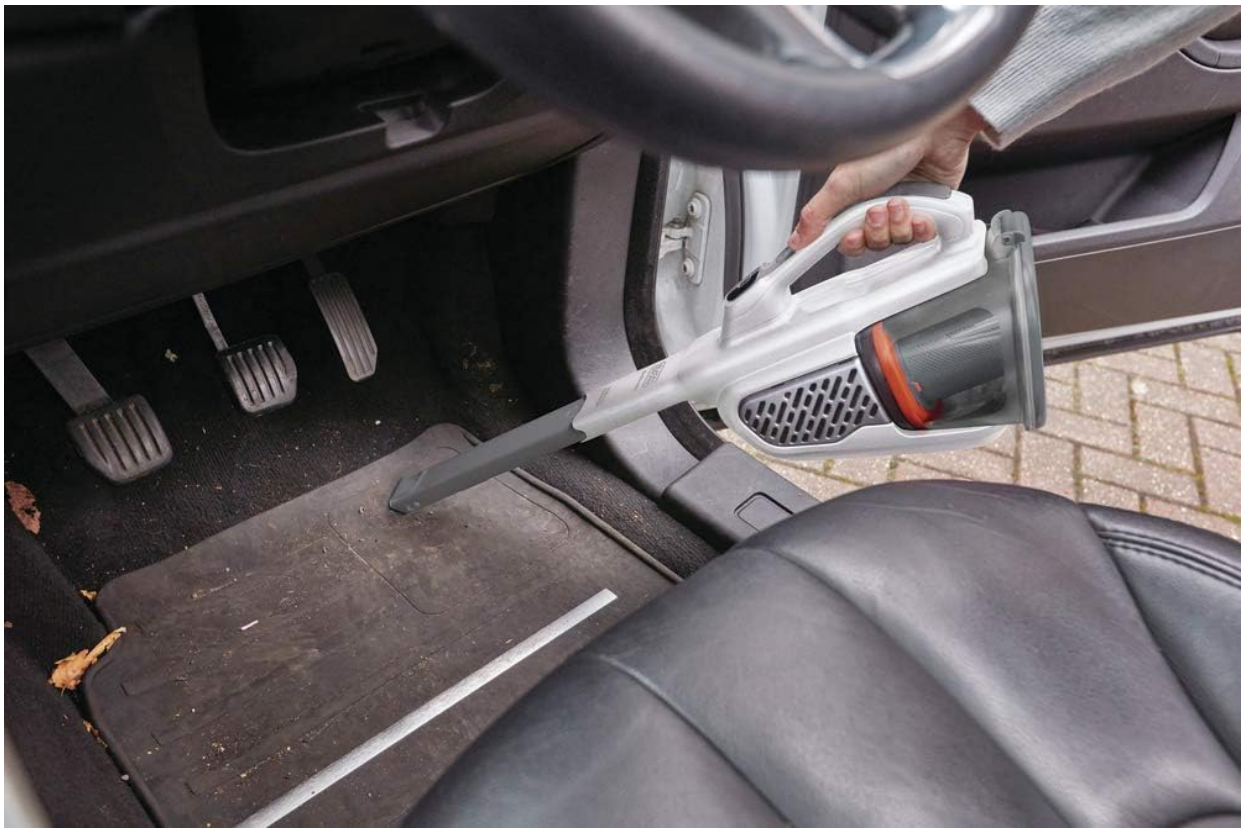
Image: The vacuum being used to clean the floor mat inside a car.