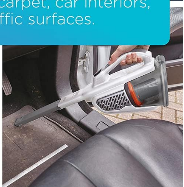
Image: A collage demonstrating the vacuum's versatility for cleaning furniture, car interiors, and high-traffic surfaces.