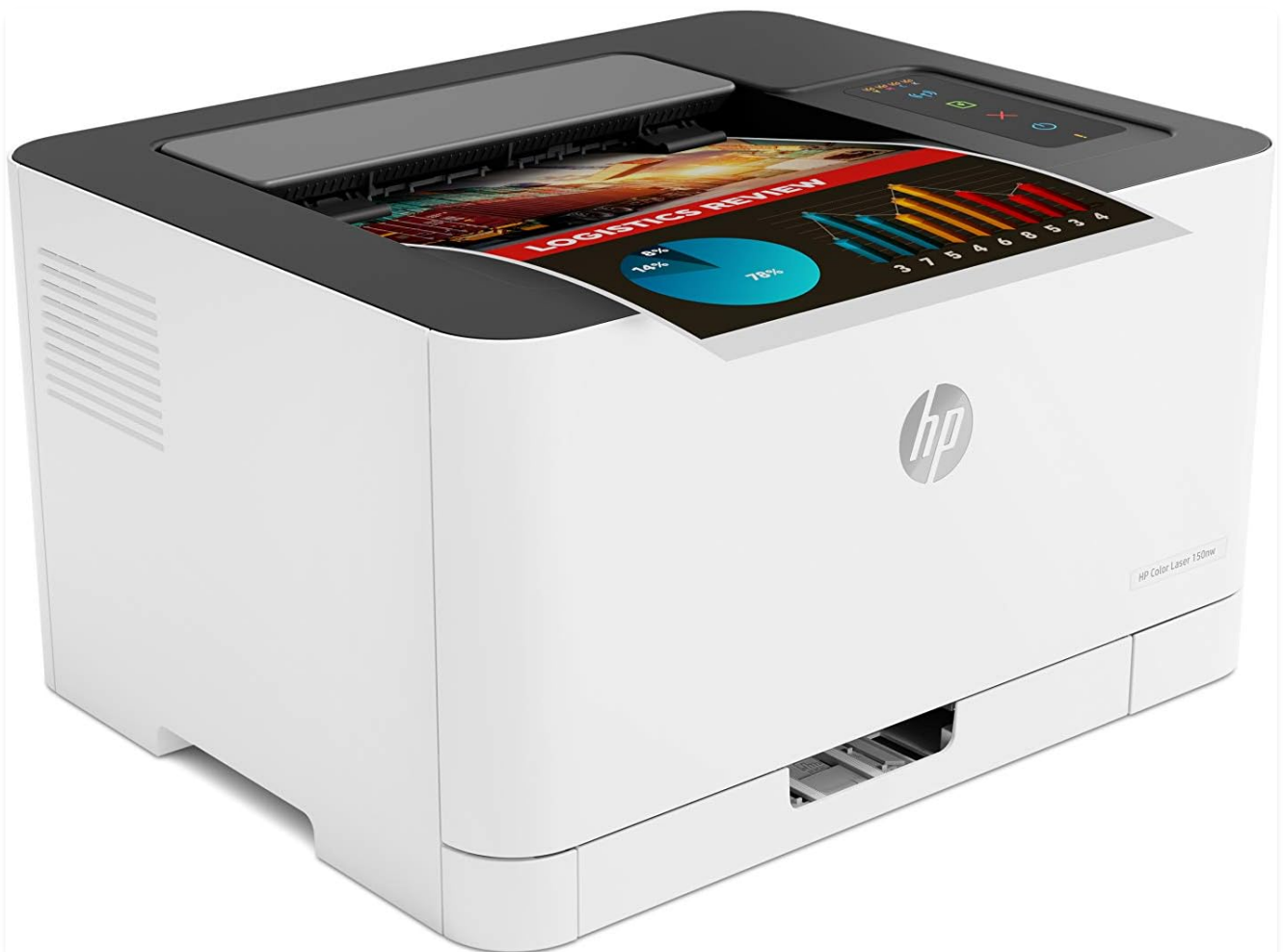
Image: The HP Colour Laser 150nw printer in operation, with a color document being outputted from the top tray.

After installing the necessary drivers, select the HP Colour Laser 150nw from your computer's print dialog. Adjust print settings such as paper size, orientation, and color options as needed, then initiate the print job.