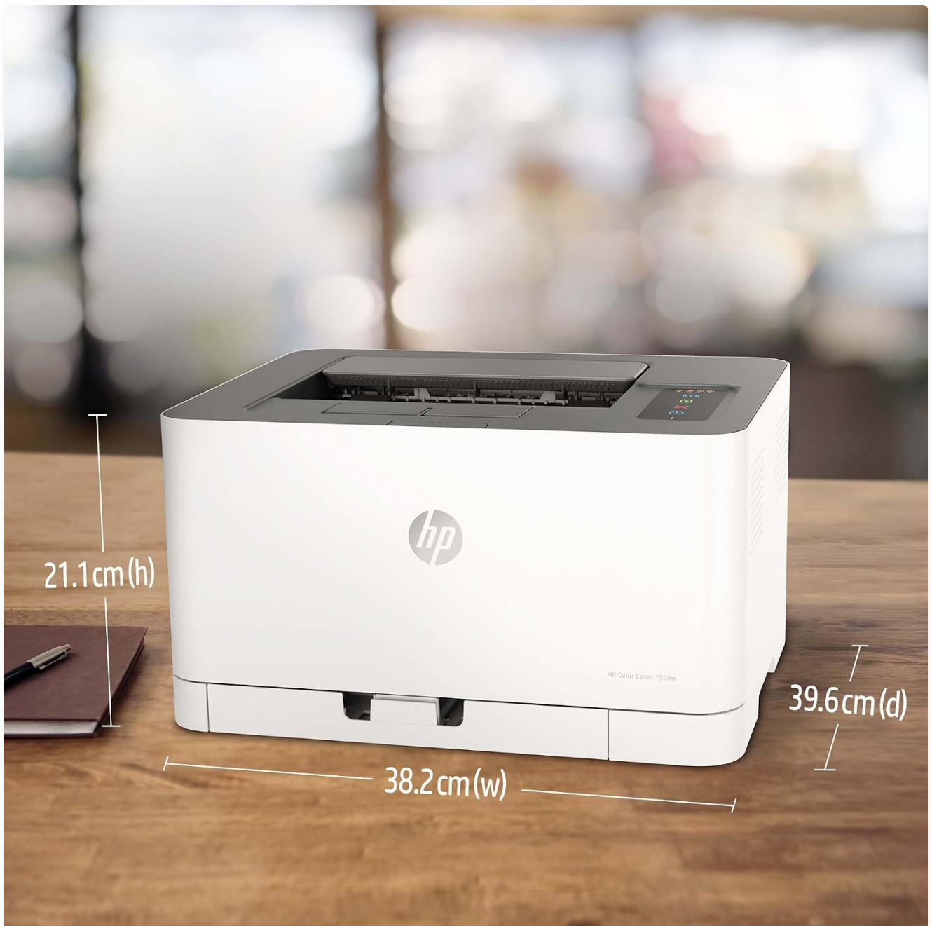
Image: The HP Colour Laser 150nw printer with its dimensions (height: 21.1cm, width: 38.2cm, depth: 39.6cm) indicated, assisting with proper placement.