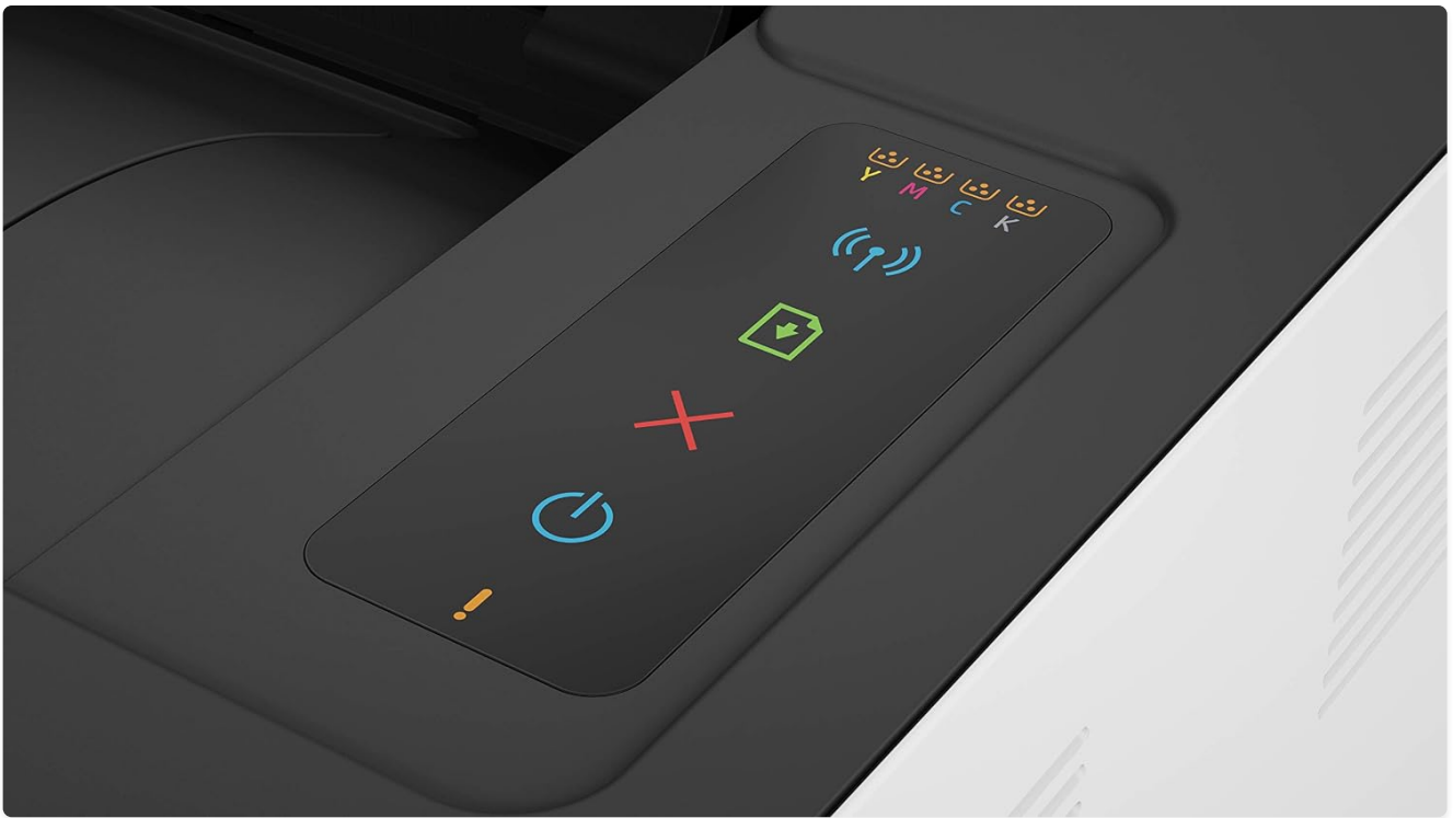
Image: A detailed close-up of the HP Colour Laser 150nw's LED control panel, showing indicators for toner levels (CMYK), Wi-Fi, download, error, and power status.