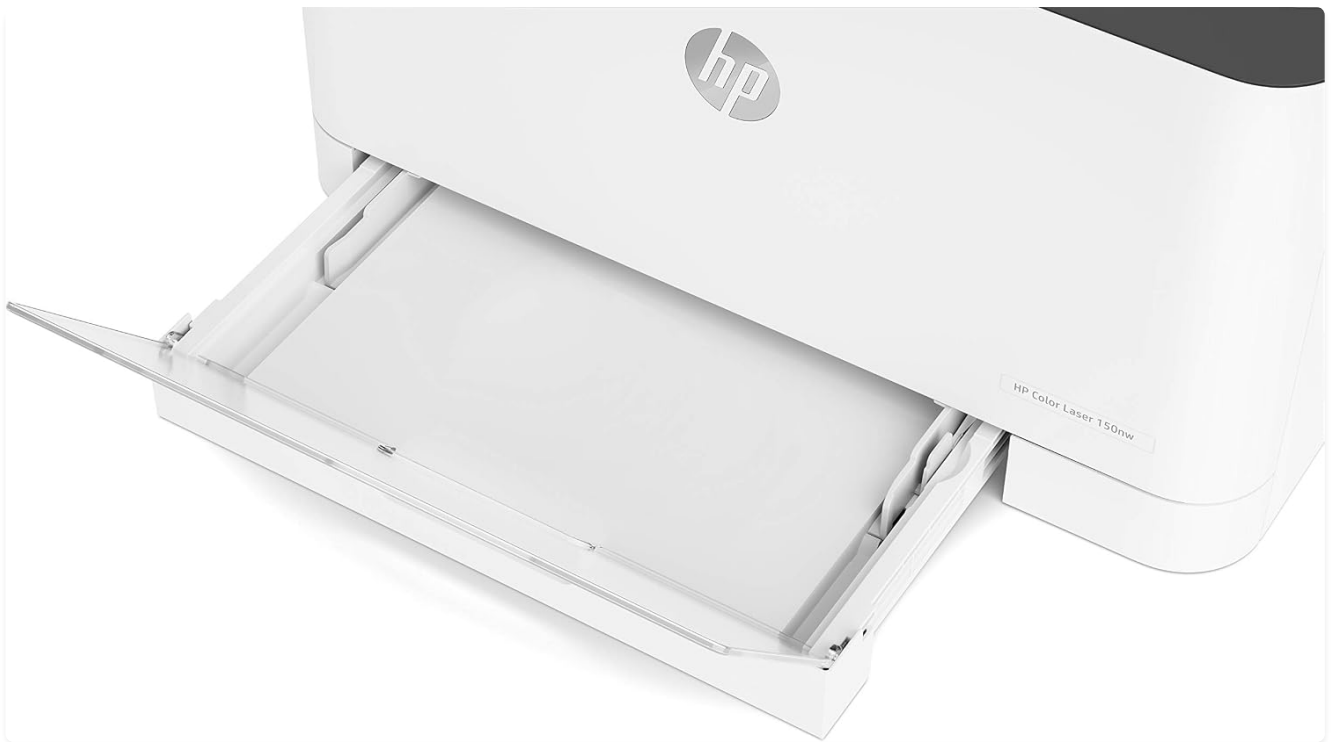
Image: The HP Colour Laser 150nw printer with paper correctly loaded into its input tray, ready for printing.