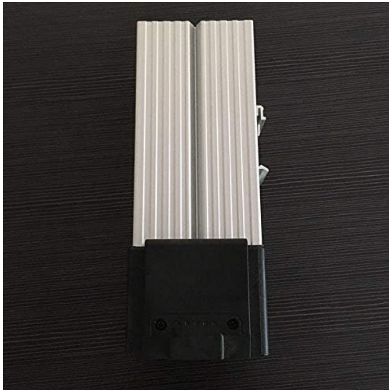
Figure 1: Overall view of the Ochoos HGL046 fan heater. The unit features a silver-colored aluminum body with black end caps.

The Ochoos HGL046 is a compact 400W electric fan heater designed for industrial or small space heating applications. It features a robust aluminum housing and an integrated fan for efficient heat distribution.