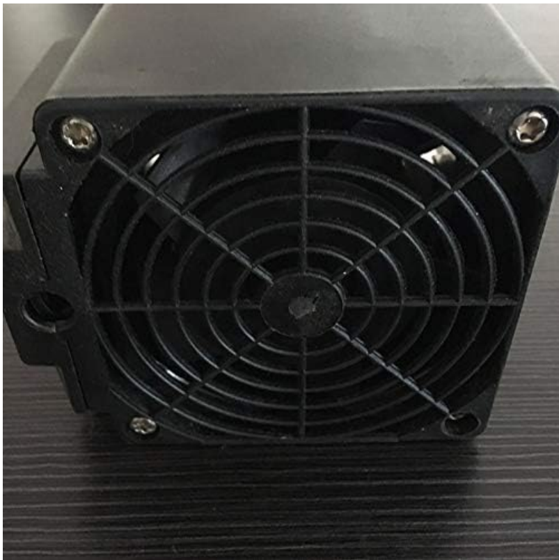
Figure 5: A close-up image of the fan grill, detailing its construction.