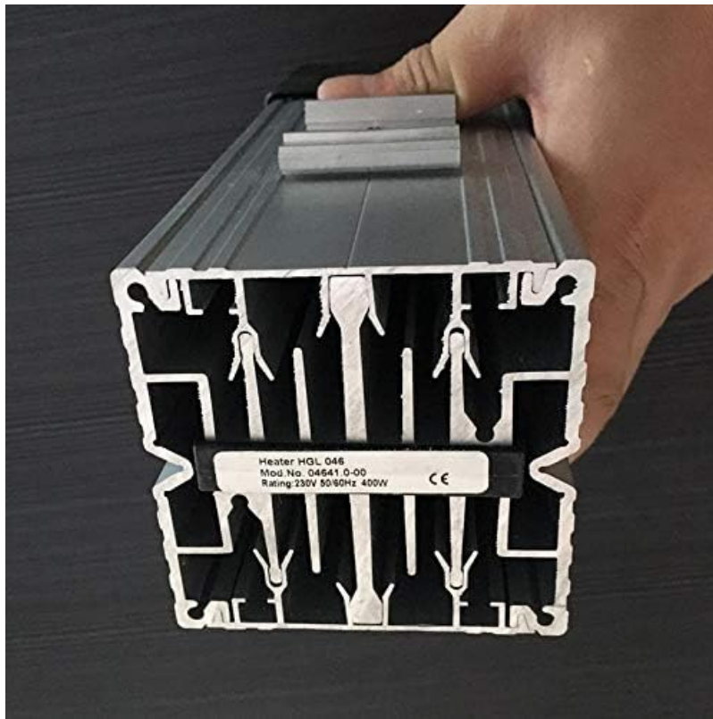
Figure 6: A view of the heater's internal structure, revealing the aluminum fins for heat dissipation and the product rating label (Heater HGL 046, Mod No. 04641 0-00, Rating: 230V 50-60Hz 400W).