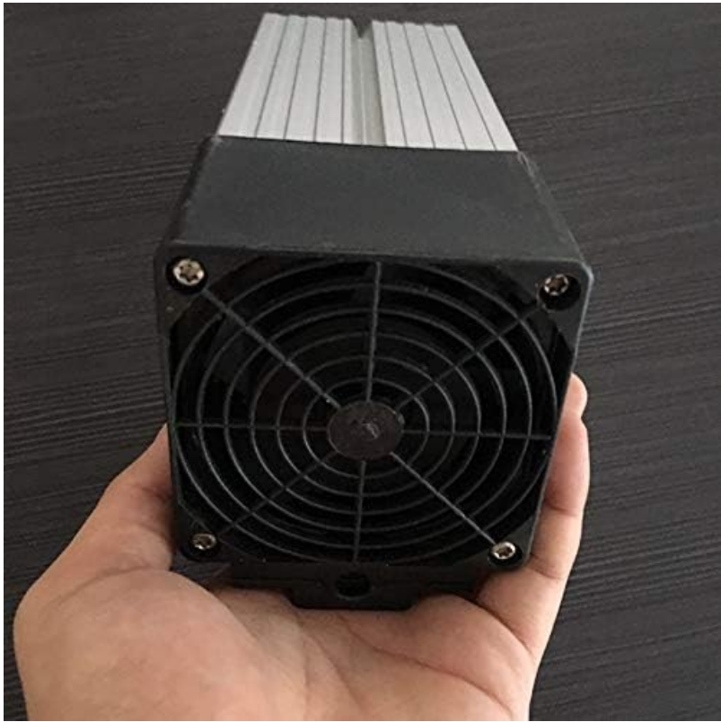
Figure 4: A direct front view of the fan, showing the protective grill and fan blades.