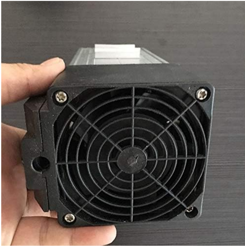
Figure 2: Side view of the heater, highlighting the black protective grill covering the fan at one end of the unit.