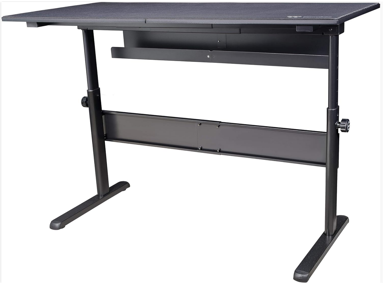
Image: Side view of the desk, showing the manual height adjustment knob on the leg.