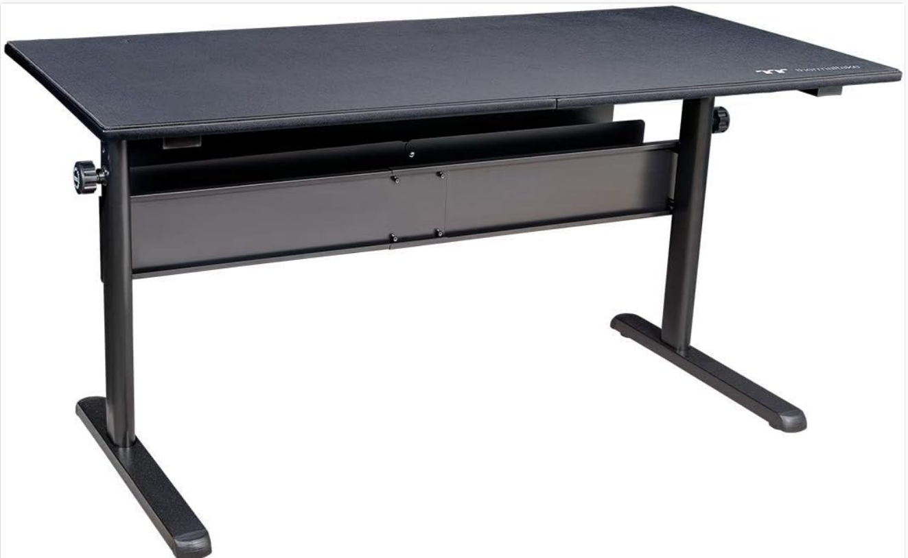
Image: The Thermaltake Level 20 GT Battlestation Gaming Desk, shown from a front-side angle, highlighting its black finish and

This manual provides essential information for the proper assembly, operation, and maintenance of your Thermaltake Level 20 GT Battlestation Gaming Desk. Please read these instructions carefully before beginning assembly or use to ensure safety and optimal performance of the product.