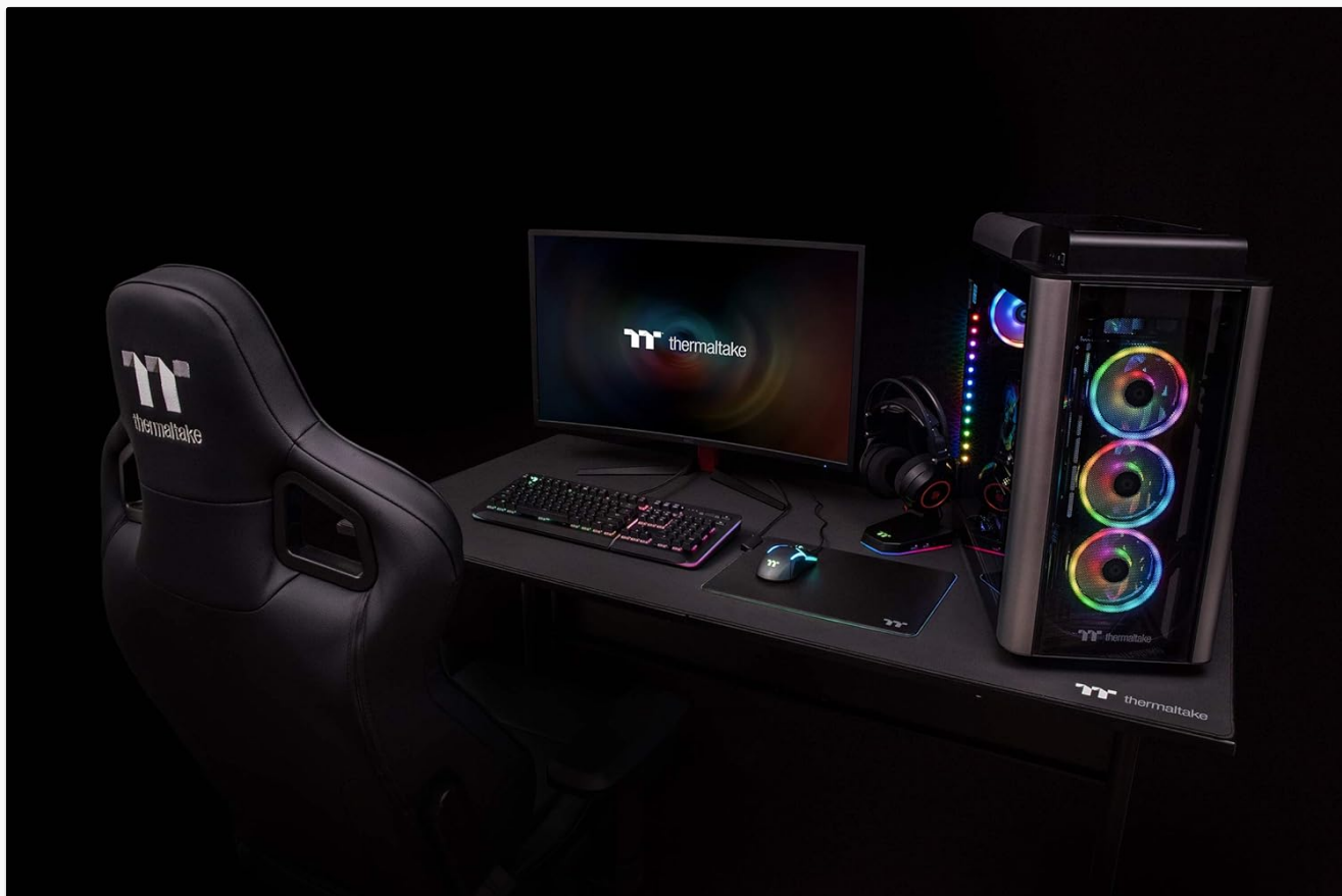
Image: The desk configured with a full gaming setup, including a monitor, keyboard, mouse, and PC tower, demonstrating the ample workspace and integrated desk mat.

The included full-sized desk mat provides an optimized surface for all mouse types and sensors, ensuring superior control and precise tracking. Its non-slip rubber base keeps it securely in place.