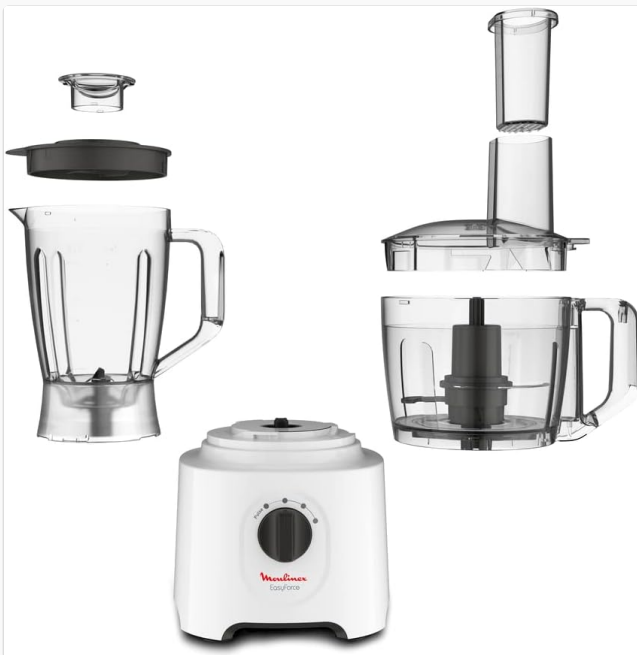
Image 3.2: An exploded view illustrating the individual components of both the food processor and the blender, including the motor base, bowls, lids, and various blades/discs.