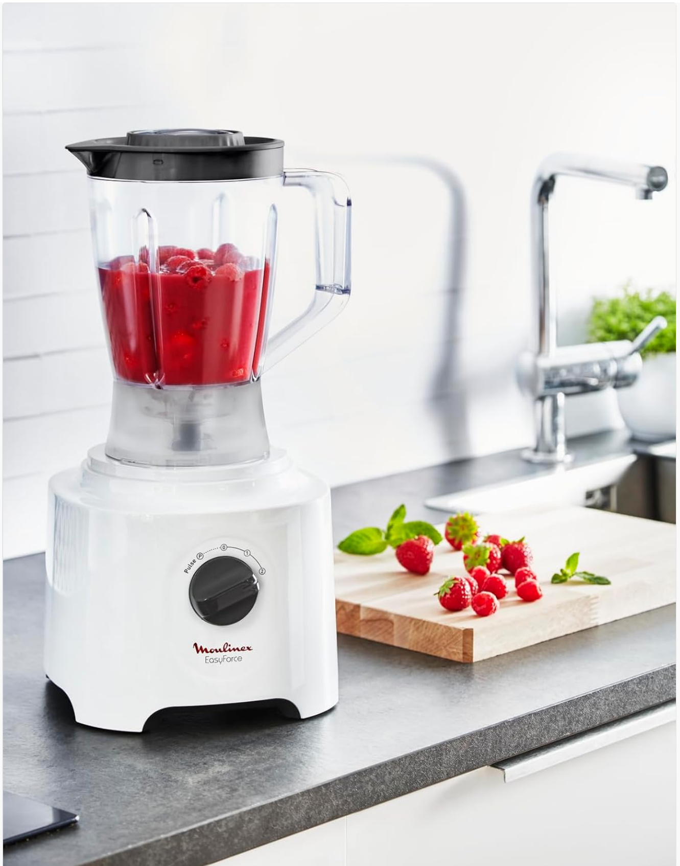
Image 5.2: The blender in use, processing red berries into a smooth mixture.