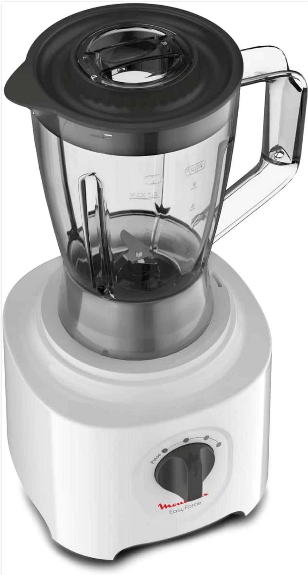
Image 4.1: The food processor unit fully assembled and ready for use.