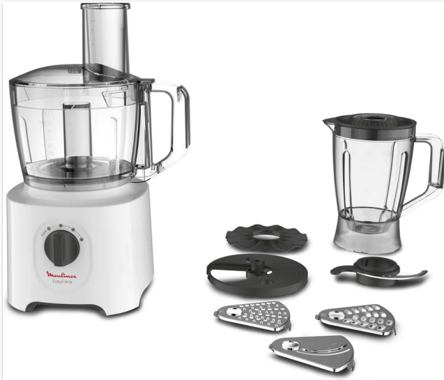
Image 3.1: The Moulinex Easy Force Food Processor showing the motor base, food processor bowl, blender jug, and all 6 attachments.

Your Moulinex Easy Force Food Processor comes with several parts designed for various functions. Familiarize yourself with each component before use.