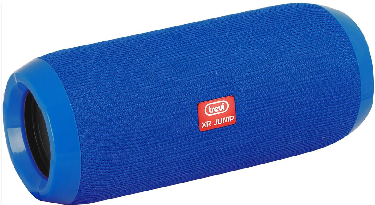
Image 1: Front view of the Trevi XR 84 PLUS Portable Amplified Speaker in blue. This image displays the speaker's cylindrical shape, the mesh grille covering the speakers, and the Trevi XR JUMP logo prominently placed on the front.