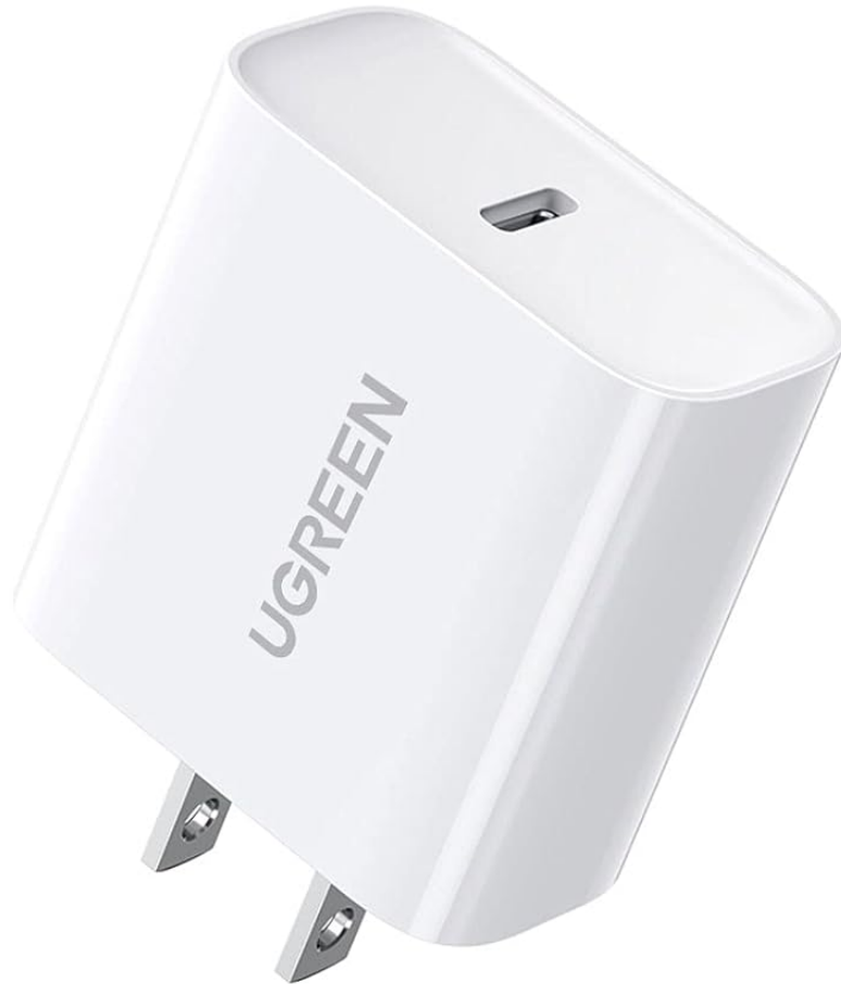
Main Product View: The UGREEN 20W USB C Charger, a compact white wall adapter with a single USB-C port and foldable US prongs, designed for efficient power delivery.