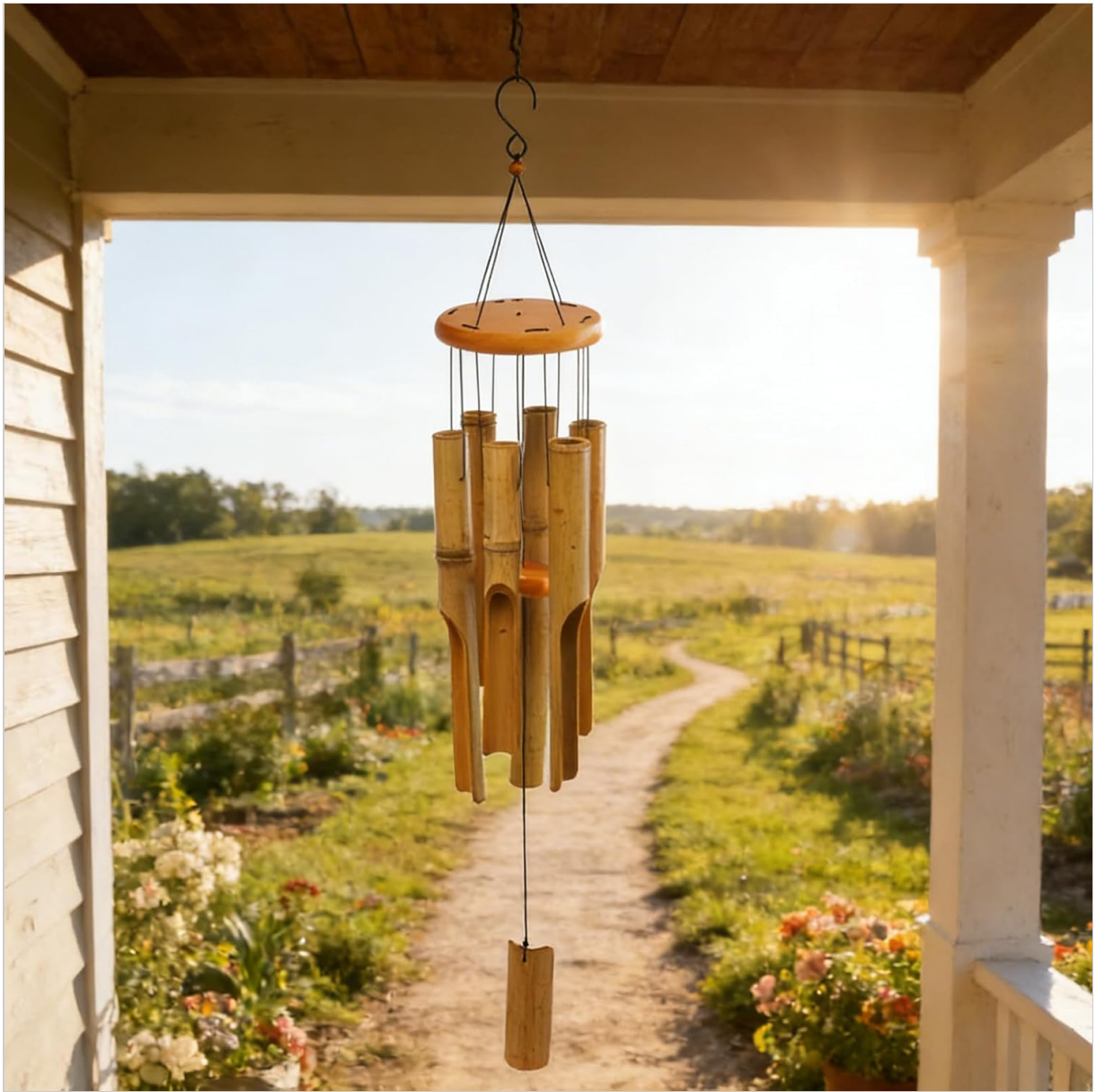
Image: The wind chime hanging from a porch ceiling, overlooking a pathway and field.