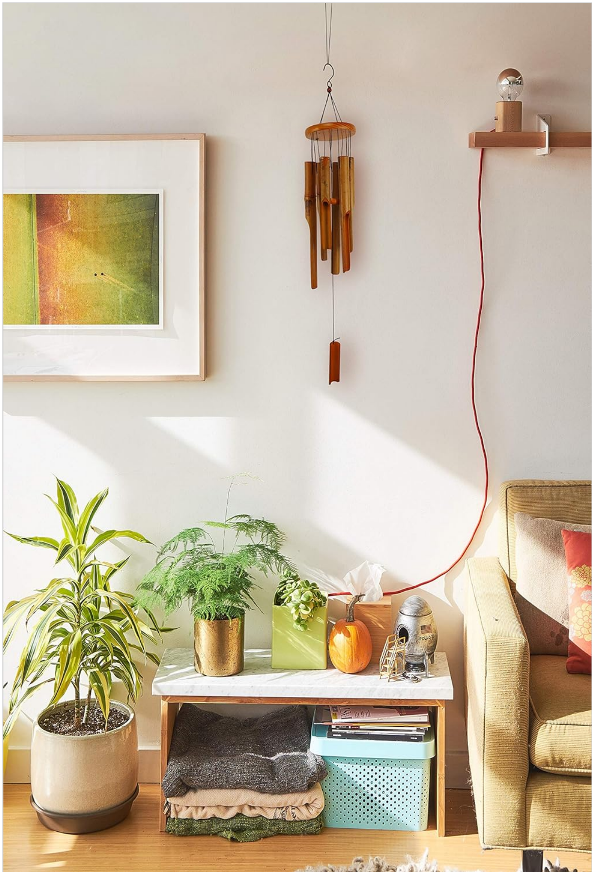
Image: The wind chime hanging inside a room, providing a decorative element.