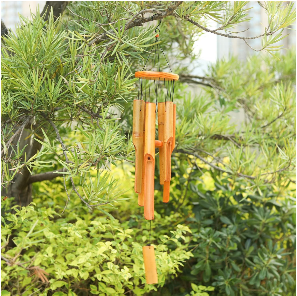
Image: The wind chime suspended from a tree branch, blending with the natural outdoor environment.