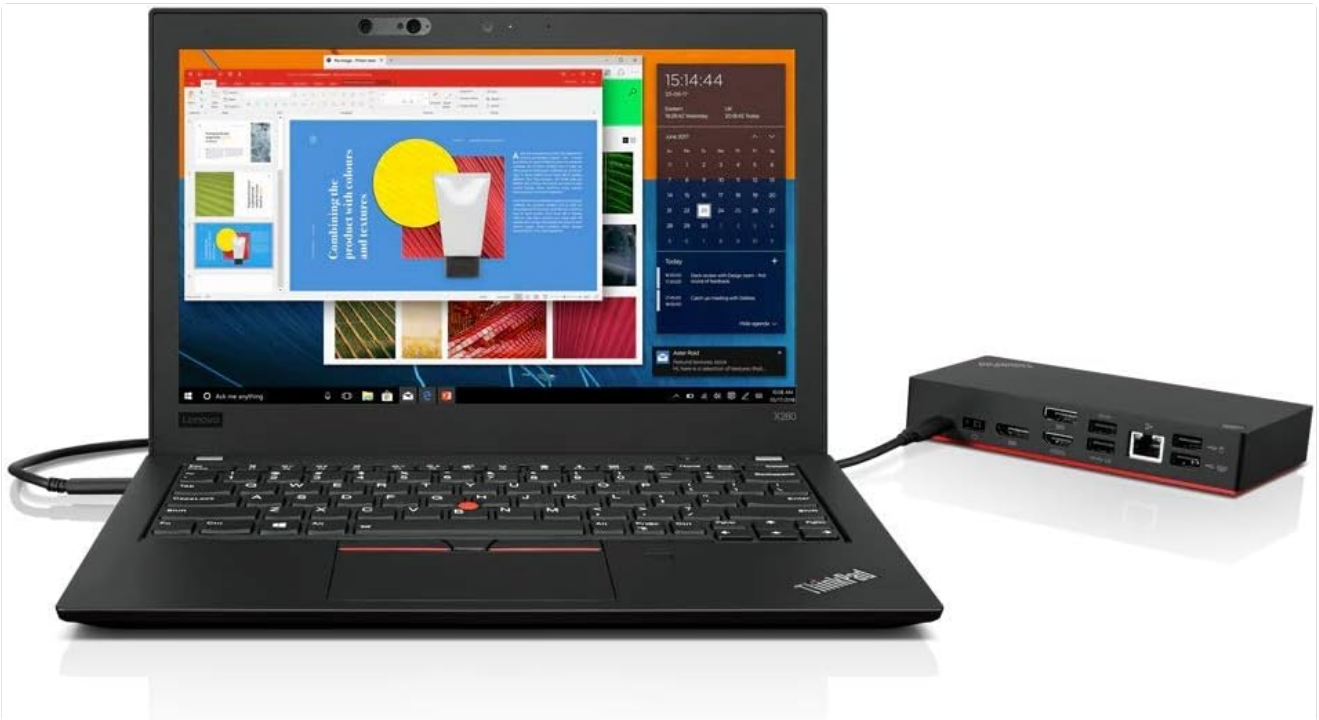
Figure 3: Laptop connected to the docking station with an external display