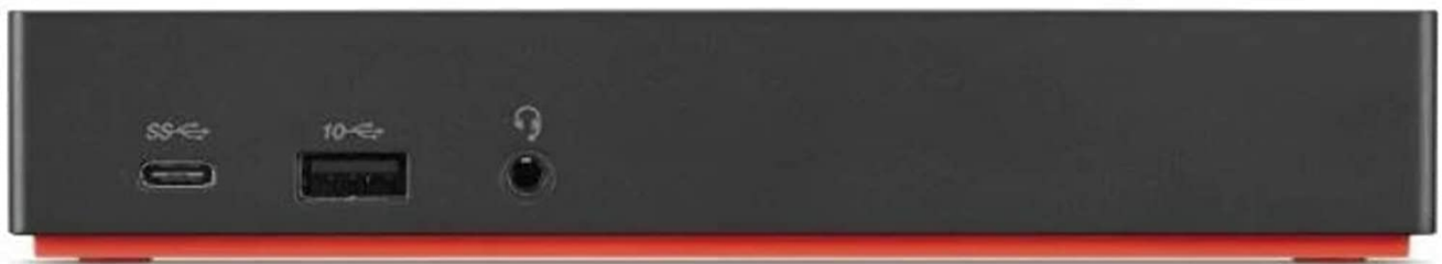
Figure 1: Lenovo ThinkPad USB-C Dock Gen 2

The Lenovo ThinkPad USB-C Dock Gen 2 is a universal docking solution designed to expand the capabilities of your USB-C enabled laptop. It provides a single-cable connection for multiple peripherals, external displays, and network access, while also charging your notebook. This dock is engineered to streamline your workflow and maximize productivity by offering a wide array of ports and features.