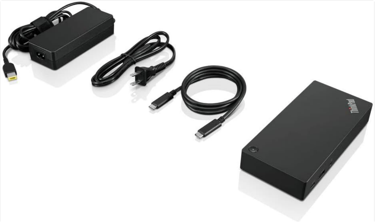
Figure 2: Docking station and included accessories