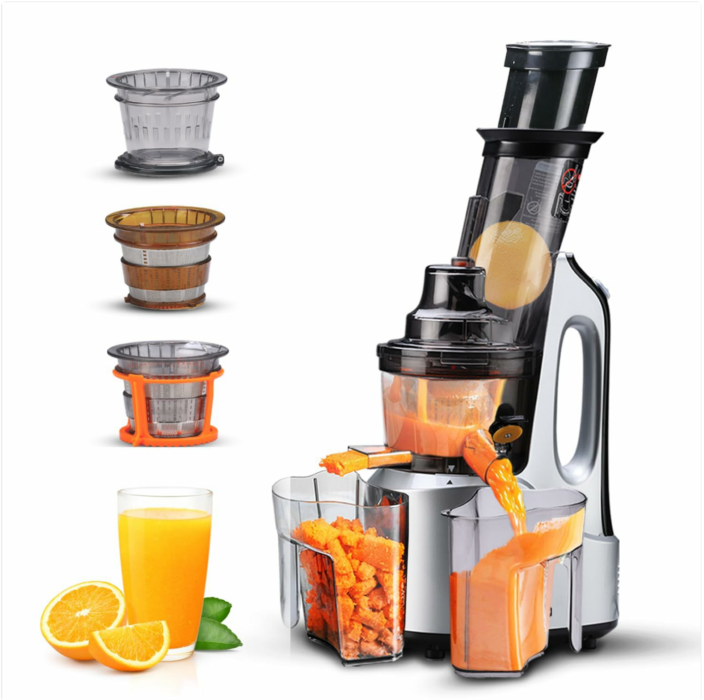
Figure 4.1: The AGARO Imperial Slow Juicer fully assembled and ready for use, showing the main unit, juice container, and pulp container.

7. Ensure all parts are securely locked before plugging in the appliance.