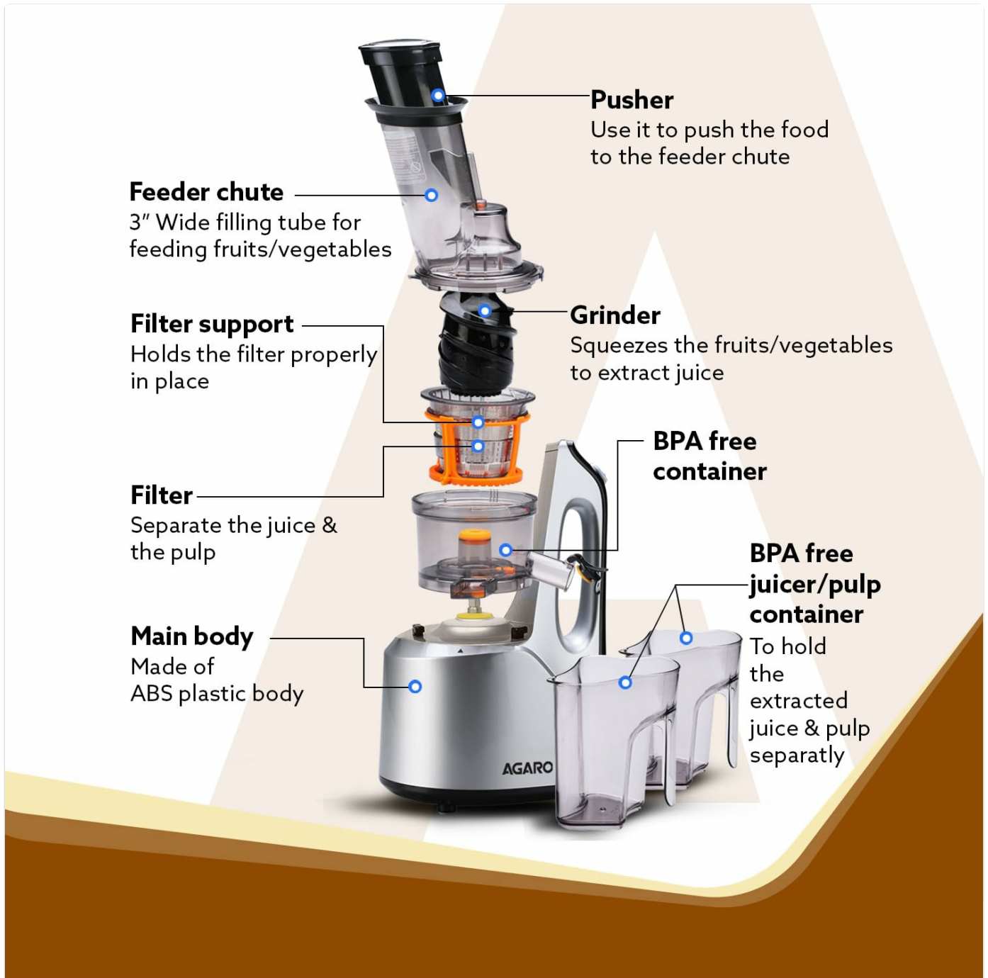
Figure 3.1: Exploded view showing the various components of the AGARO Imperial Slow Juicer, including the pusher, feeder chute, grinder, filter support, filter, main body, BPA free container, juice container, and pulp container.