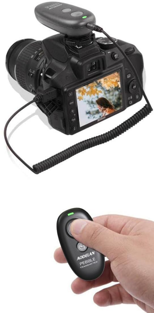
Image: AODELAN SRR-PEBBLE Wireless Remote Control receiver attached to a camera, illustrating both wired and wireless setup options.