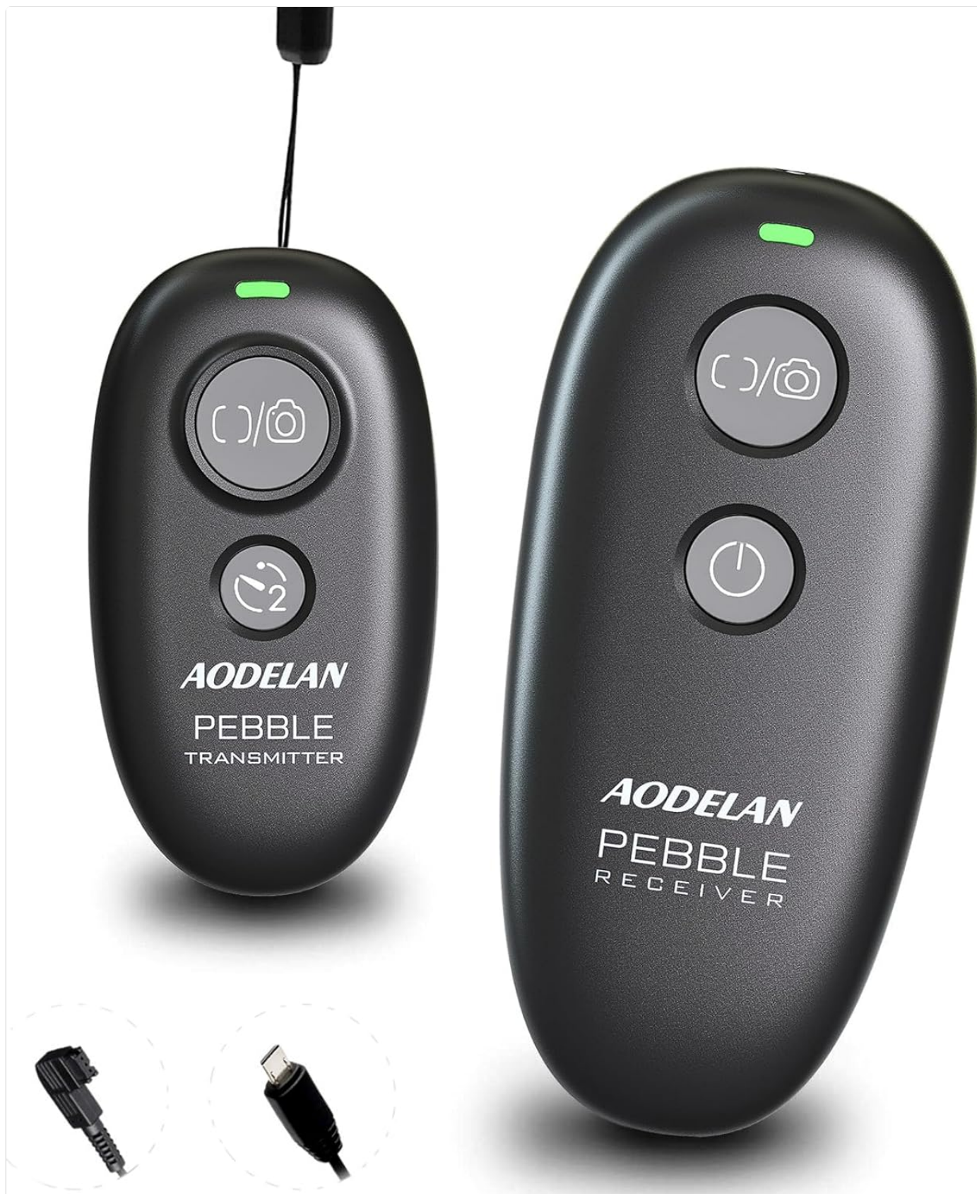
Image: AODELAN SRR-PEBBLE Wireless Remote Control showing the transmitter, receiver, connecting cables, and lanyard.